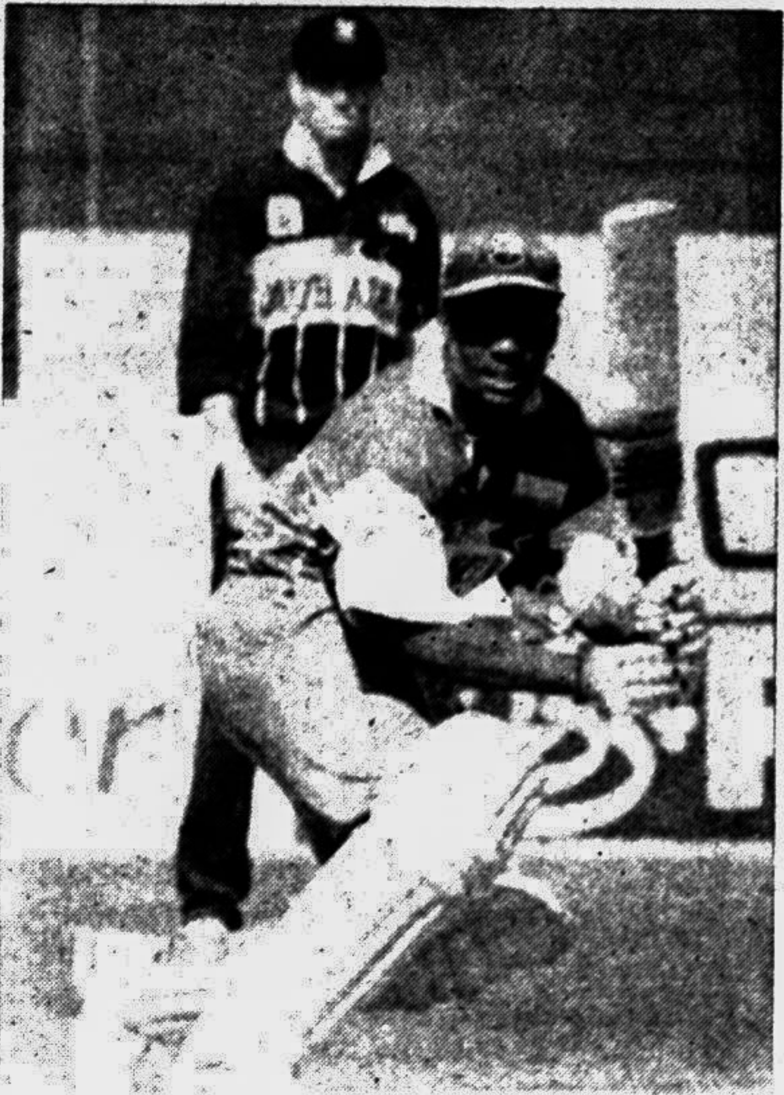
ONE-MAN DEMOLITION SQUAD: Brian Lara executes an improvised sweep shot during his match-winning 111 against South Africa. (Details on page 10).