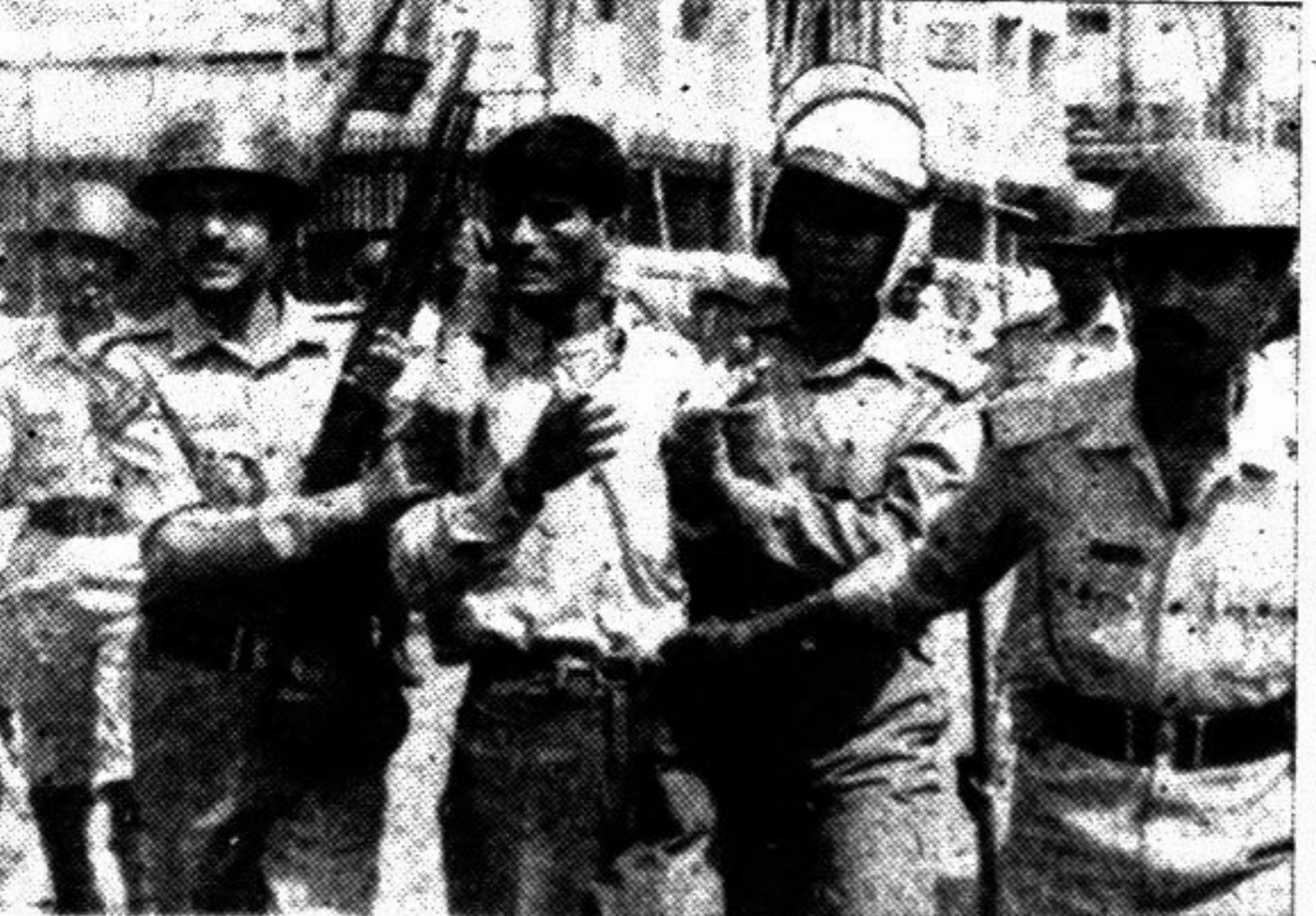
Police picked up this man from city's Paltan area yesterday.

The court rejected the petitions for bail and sent them all to jail hajat.