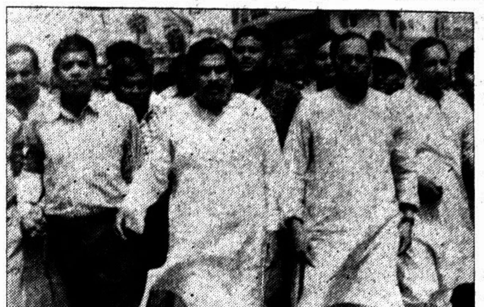
A Jatiya Party procession in city's Mahakhali area during the non-cooperation programme yesterday.

The rally also congratulated the newly-elected executives and members of Dhaka Bar Association, added the release.