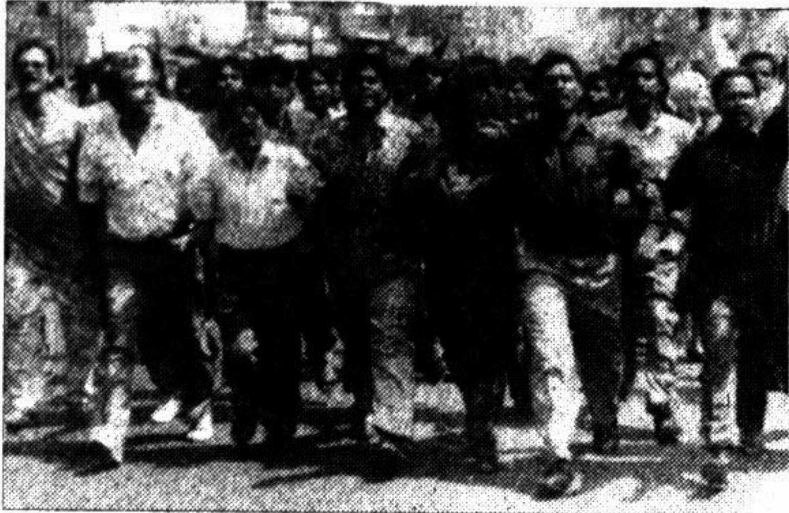
The Bangladesh Awami League brought out a procession in the city on the first day, yesterday, of the opposition's non-cooperation programme across the country.