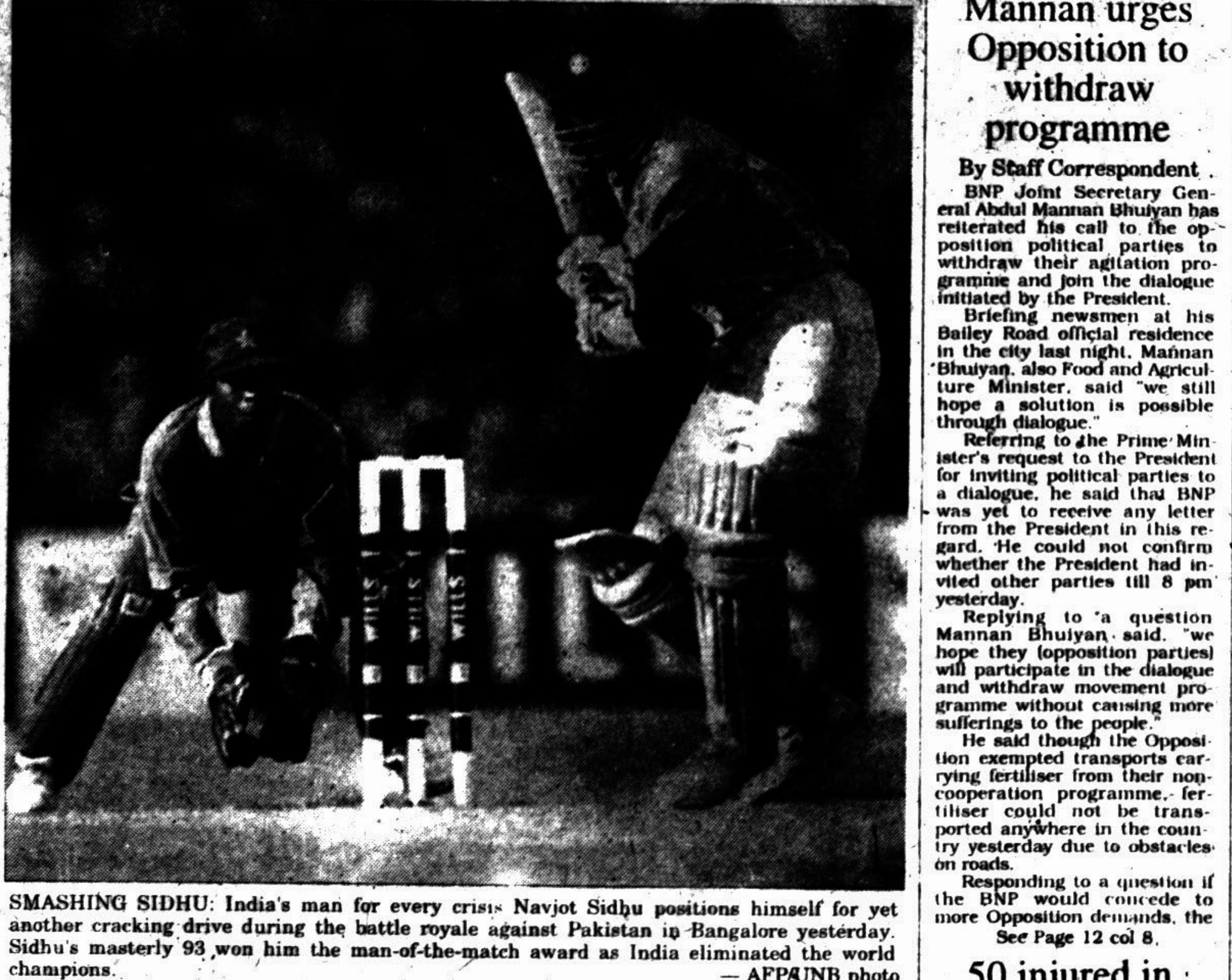
SMASHING SIDHU: India's man for every crisis - Navjot Sidhu positions himself for yet another cracking drive during the battle royale against Pakistan in Bangalore yesterday. Sidhu's mastery 93 won him the man-of-the-match award as India eliminated the world champions.