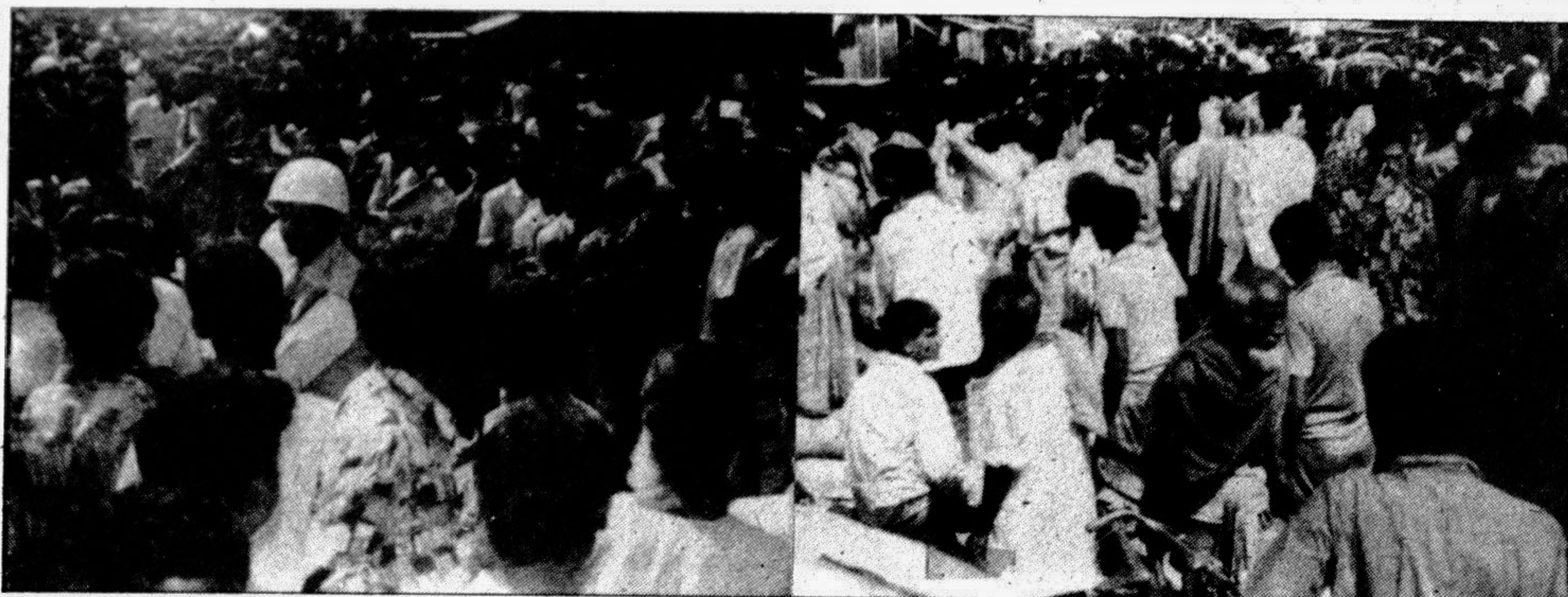
SHERPUR: Farmers demanding (L) fair price and adequate supply of fertilizer in the district gheraoed the residence of the Deputy Commissioner last Monday. After failing to get supply of fertilizer bags angry farmers barricaded Dhaka-Sherpur highway at Nakla thana headquarters. Communication was disrupted for a few hours. The TNO and local leaders later assured the farmers of adequate supply of fertilizer bags.