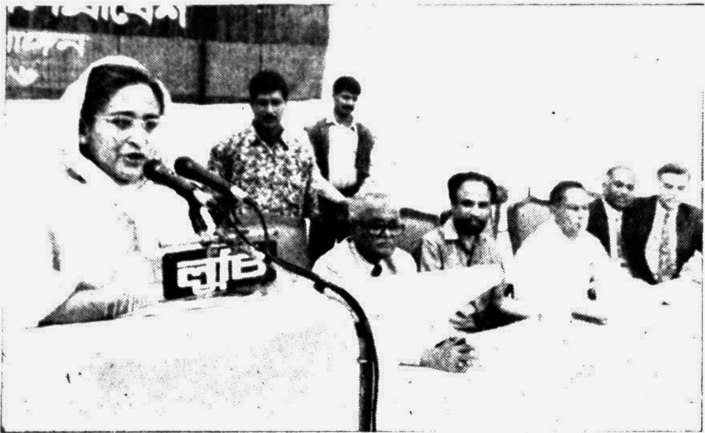
Awami League chief Sheikh Hasina speaking at a rally organised by the Bangladesh Ainjibi Samannoy Parishad at Supreme Court premises yesterday.