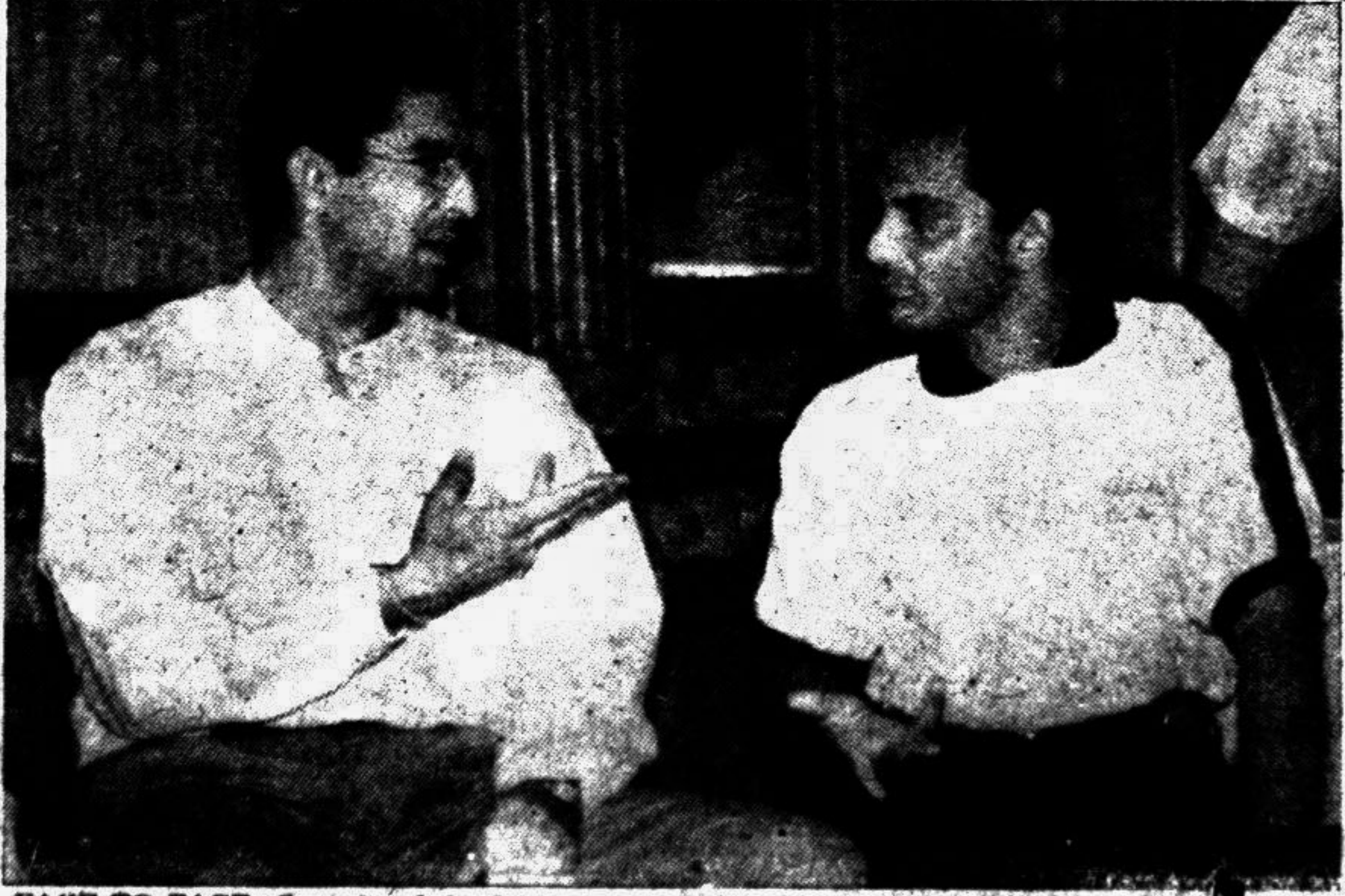
FACE TO FACE: Captain of the Pak team Wasim Akram (L) talks with Indian captain Mohammed Azharuddin at a hotel restaurant in Bangalore on the eve of their quarterfinal match of the World Cricket Cup.

movement, said separate press releases of AL, JP and Jamaat last night. Rickshaws, however, would be exempted from the programme after 10 am everyday. Meanwhile, the three parties brought out separate processions in different areas of the city yesterday to drum up support for their movement. Markets, particularly those of grocery and food items, attracted larger number of buyers yesterday than on the normal Fridays. Many buyers complained of shortage of fresh meat, fish and vegetable. The inter-district bus terminals and the launch terminal in the city experienced a huge rush of people leaving the city. Rickshawpullers were found charging fare much more than the normal in various areas.