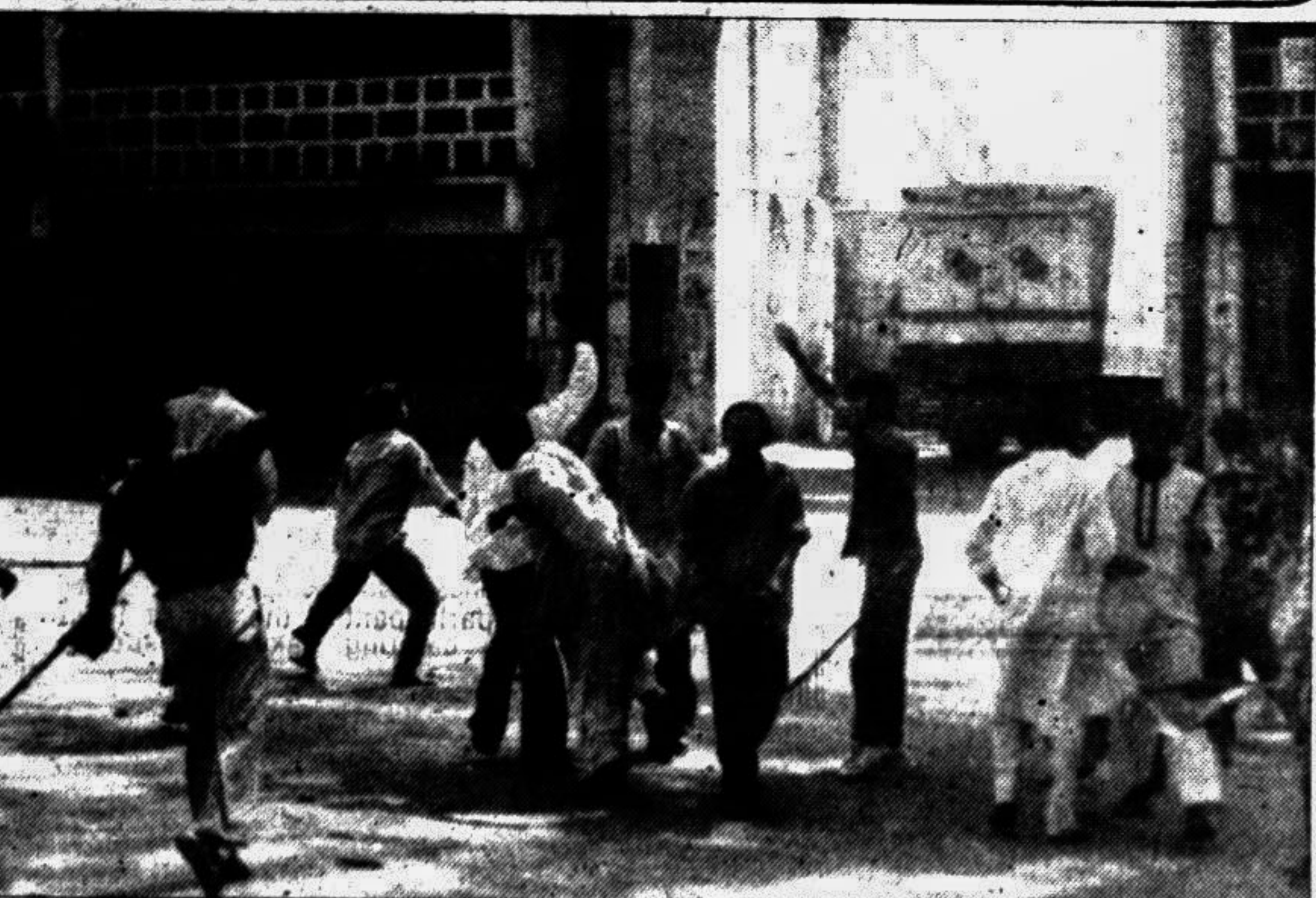
Jamaat activists enforcing hartal in city's Stadium Market area yesterday.

Kusum etc) did it in a much more refined way than the roadside ones. They put long tables under shades in front of their restaurants where chefs in long white caps stand with hot dishes and sold many other than the traditional stuff. They even had iftar boxes and arranged iftar parties. Of course, it goes without saying that this was not what everyone is able to afford; and these posh places are a great contrast to the roadside restaurants and hotels, especially those in the old part of the city, Chawkbazar etc. It must be mentioned that there was a place near Dhanmondi called "Saiham Iftari Bazar," heaven only knows why it was called an iftari bazar, perhaps because it was overflowing with different types of iftari delicacies! Looking at the extent to which some people go (with all due respect to the rozadaars) one can't help but wonder sometimes if the people are not often forgetting that Ramadan means "abstinence"? And making such a big deal about our iftari is not really what Ramadan is all about!