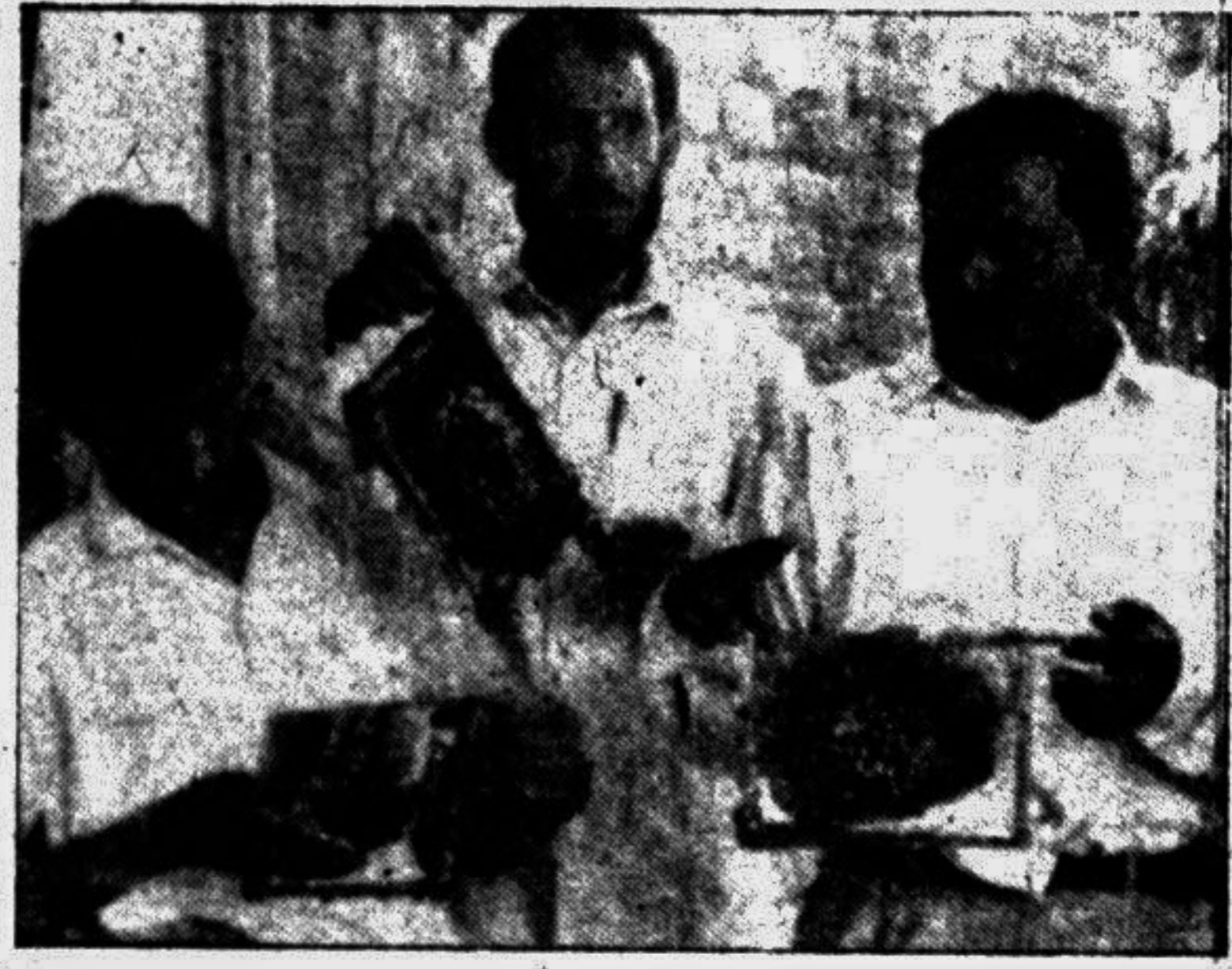
Interested persons displaying bees raised in their farms in Sirajganj town. facilities to the interested honey collectors as well. The district office sources of BSCIC told that primarily training schemes have been

taken up in Sirajganj sadar, Raiganj, Ullapara and Kamarkhanda thanas areas. So far 37 persons in sadar, 73 in Raiganj, 30 in Ullapara and 36 in Kamarkhanda thanas have been trained. During two months' training course, the BSCIC pays Tk 200 per month to every trainee as stipend. Honey collected from the boxes may be sold by the farmers or through BSCIC. When contacted the Assistant General Manager of Sirajganj BSCIC told The Daily Star that training courses in other thanas areas will also be extended. It was observed while visiting few farms in Sirajganj town that the farmers are mostly