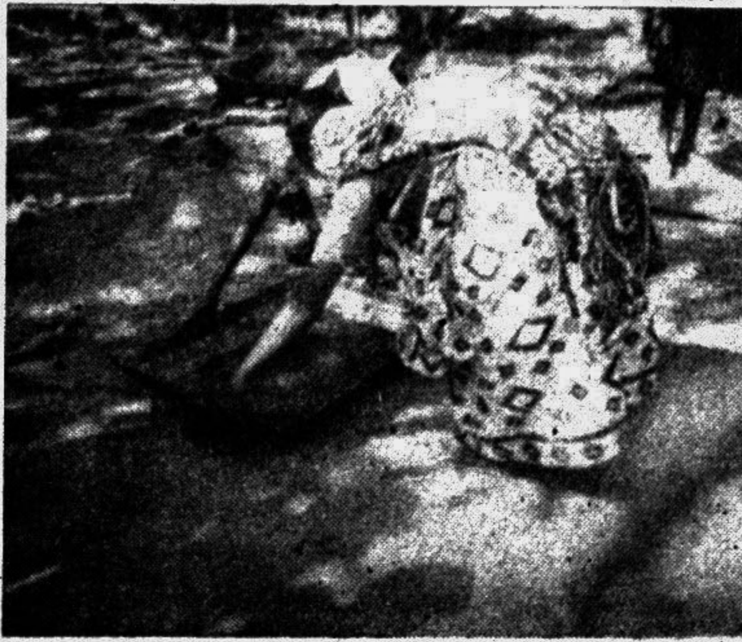
Women removing a gur tray from an oven.

was available in certain selected grocers shop. It continued to be produced by some local men for use as medicine in stomach trouble. These days, it is fully out of market as the demand has been lost with loss of confidence of users in its utility.