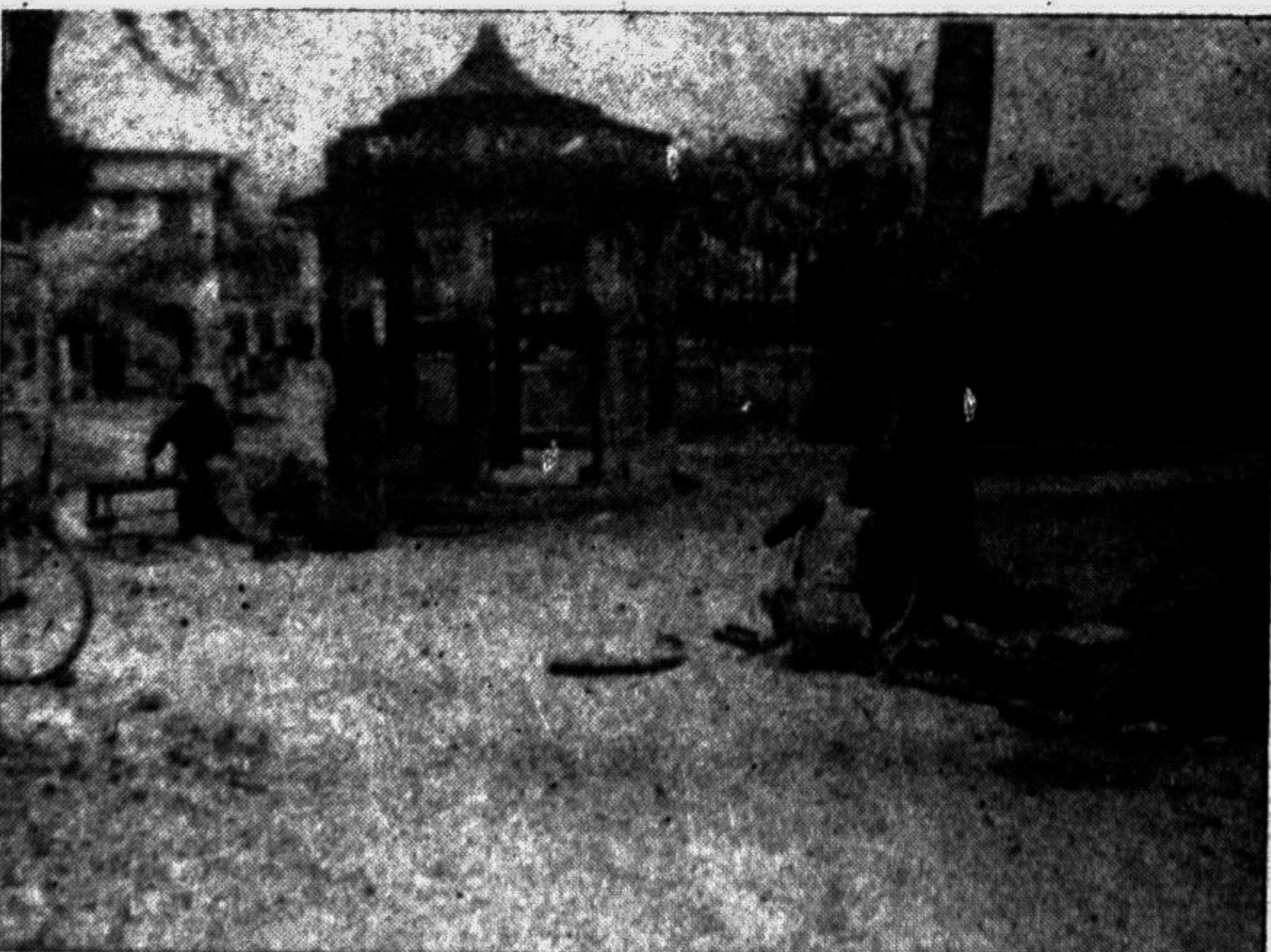
The centuries-old rest room or the shed inside the park left uncared.

with Dhaka from Sunamganj. The road when completed, will be only 102 kilometres, an official source said. It would facilitate the transportation of different commodities. It may be stated here that, major part of these districts are low-lying and lack minimum road communication. It hinders the development activities and others in the region. The people have to depend on either foot or on boat during the monsoon, as means of communication. The hilly thanas in these two districts which are considered as the backward areas would be benefited, if the proposed road is constructed. Besides, the Sylhet region which faces frequent natural calamities like floods and storms almost every year will also be able to use the highway as a substitute road during the disaster period.