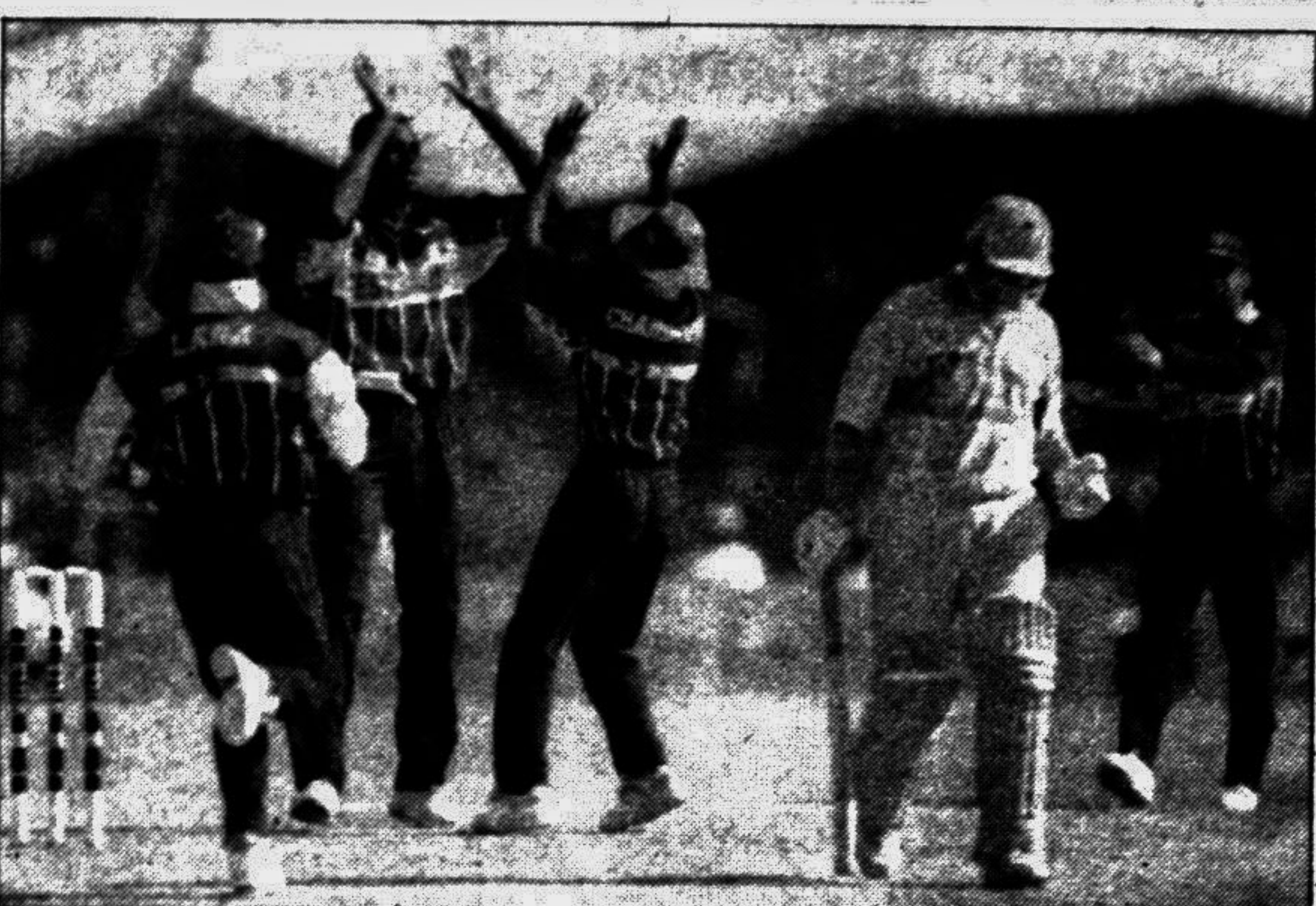
WINDIES WALTZ: A resurgent West Indies side celebrate the fall of Australian skipper Mark Taylor — caught Browne bowled Walsh — during yesterday's thriller at Jaipur, India. West Indies romped home by four wickets.