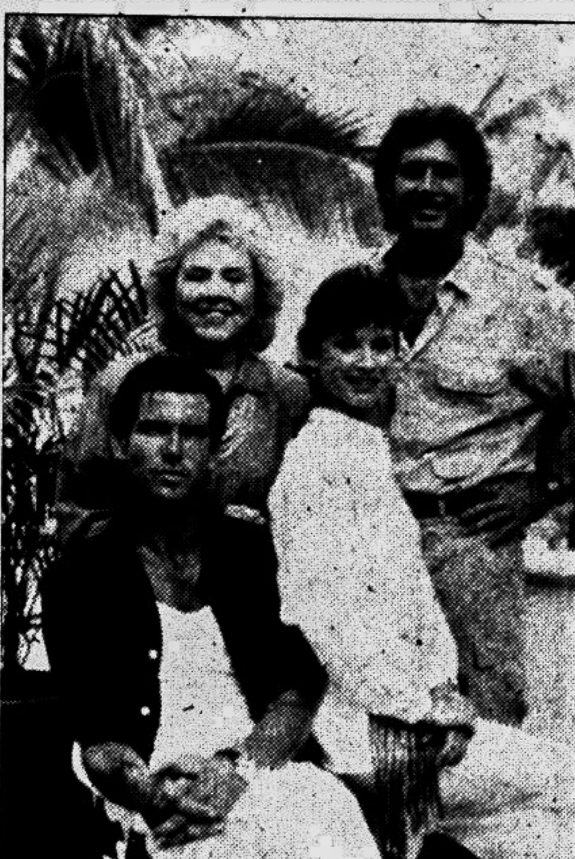
Remington Steele on Star Plus, Today at 3:00 pm