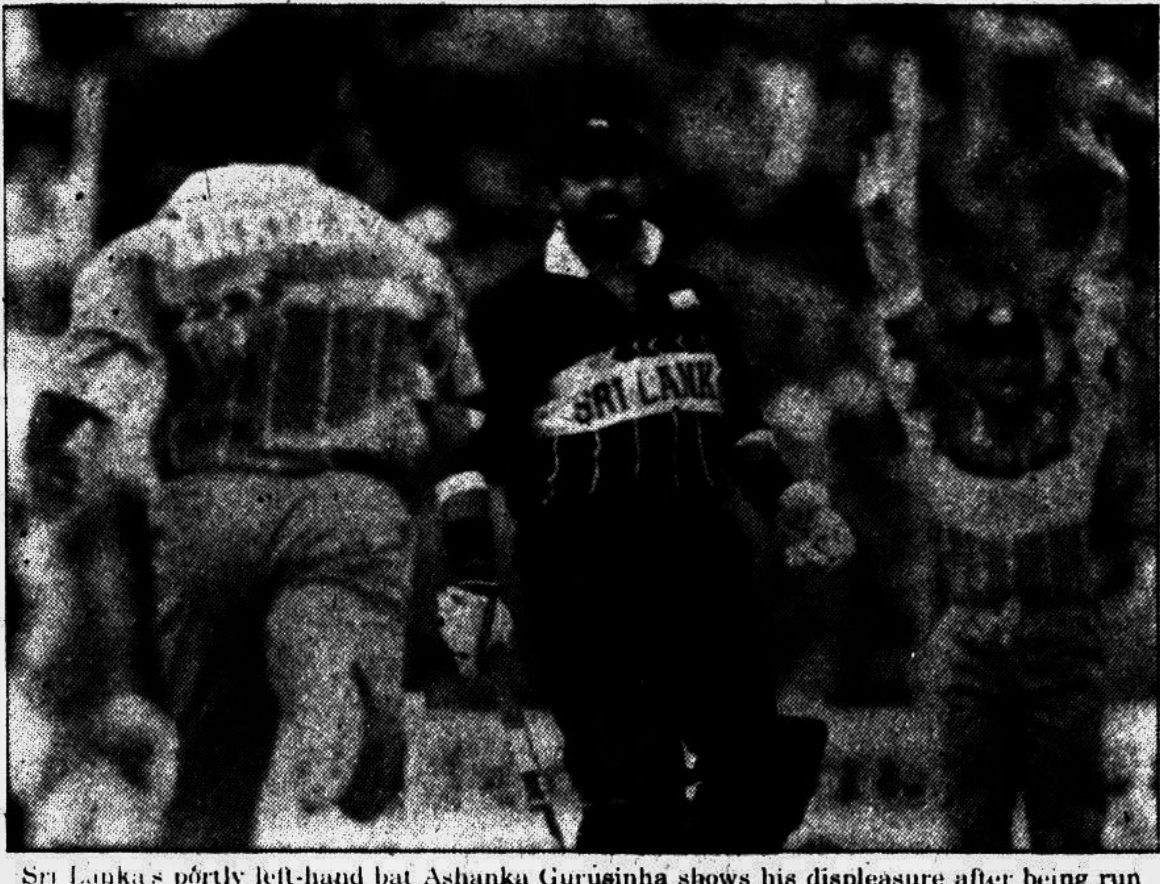
Sri Lanka's poorly left-hand bat Ashanka Gurusinha shows his displeasure after being run out by Indian leggie Anil Kumble in a high-voltage encounter in Delhi yesterday. The fiery islanders shushed the Indians with a scintillating six-wicket victory.

Result: Sri Lanka won by six wickets. Man-of-the-match: Sanath Jayasuriya (Sri Lanka)