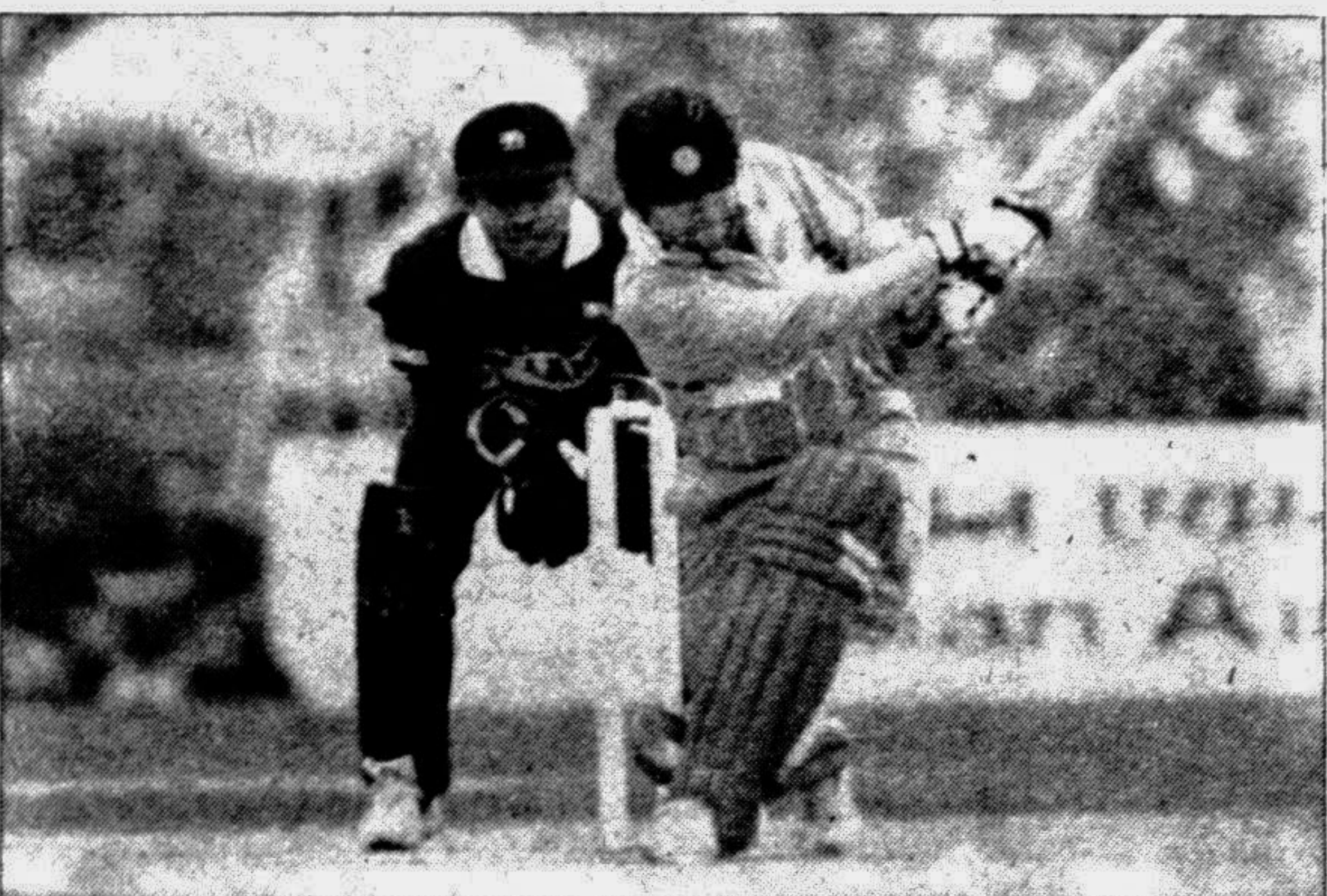
ENTHRALLING... BUT NOT ENOUGH. The sparkling Sachin Tendulkar sweeps during his swashbuckling knock of 137 against Sri Lanka in Delhi yesterday. The wonder boy's majestic exploits were however not sufficient as Sri Lanka dazzled their way to victory with six wickets to spare.

The effort earned the Sri Lankans a rousing ovation from some 30,000 Indian fans, who earned their money's worth by seeing 543 runs being scored in an enthralling day's cricket. It was not the first time the Sri Lankans had defied a vic-