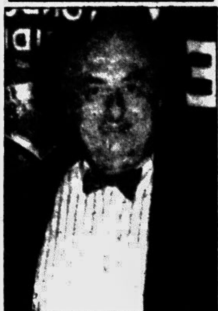
Henry Blofeld (Noted English cricket commentator)

The World Cup will undoubtedly be an unforgettable experience for all who are involved in it, in whatever capacity. The subtleties, its fascinating, frustrating, infuriating and fulfilling in just about equal part and the memories will come as much from off the cricket field as they do from on it.