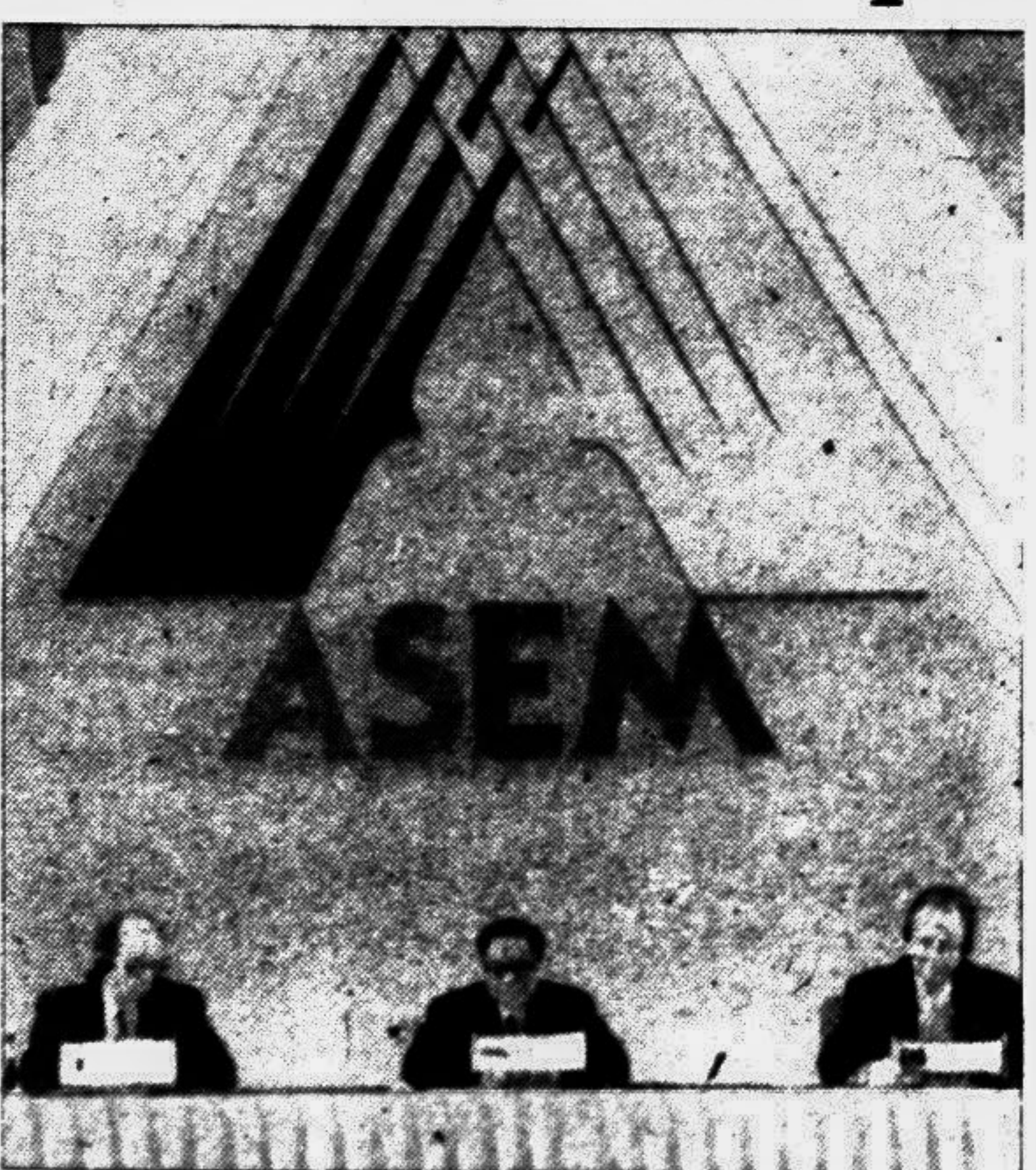
(From left) Italy's Prime Minister Lamberto Dini, Thailand's Prime Minister Banharn Silpa-archa and EU Commission's president Jacques Santer at the closing ceremony of the Asia-Europe Meeting in Bangkok yesterday.

BANGKOK, Mar 2: Leaders of 25 Asian and European nations proclaimed a new 'partnership' after a landmark summit ended here today, muting differences over human rights in favour of economic cooperation and political harmony, report AFP Reuter.