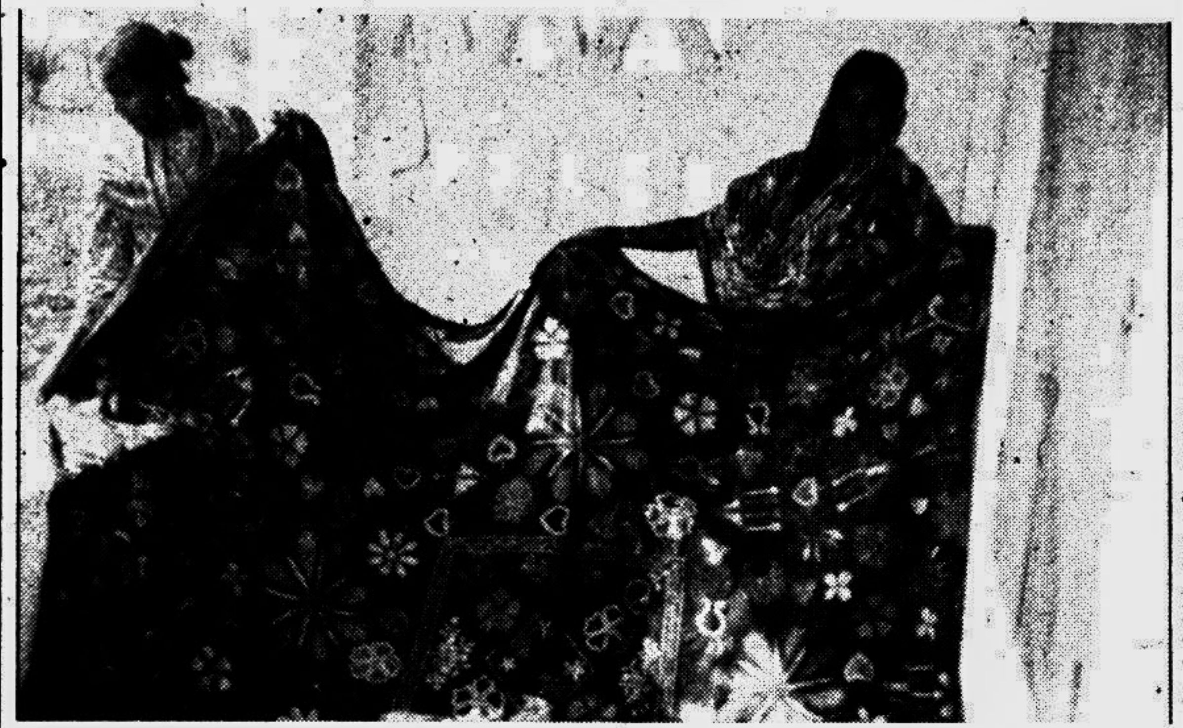
DESHA handicrafts showroom in Jessore town.

"Still a woman in our society is not left alone for peace — people, specially the greehas (husband rich) criticise my coming out of home, and along with it, my work," she says, adding, "I don't care. I was unhappy before I left my husband, and then of course, I had no money. I am still unhappy digesting the comments of my critics; well, it's much more comfortable to be unhappy when you can feed yourself and your kids."