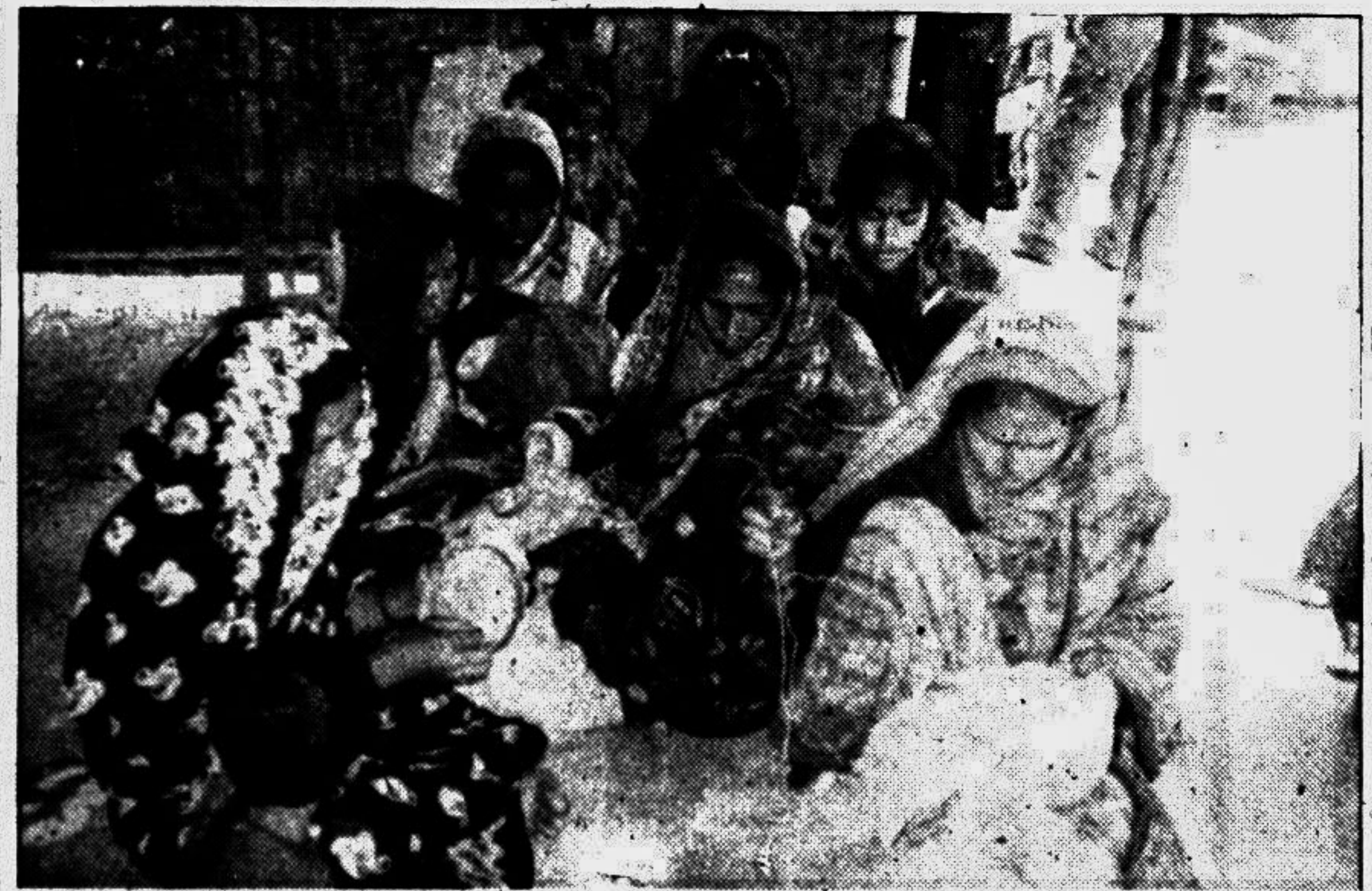
Stitching their lives together at Khajura project site