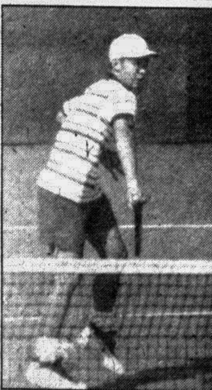
Action from a doubles match of the Beximco 10th Bangladesh International junior tennis championship played yesterday at the Ramna Tennis Complex.