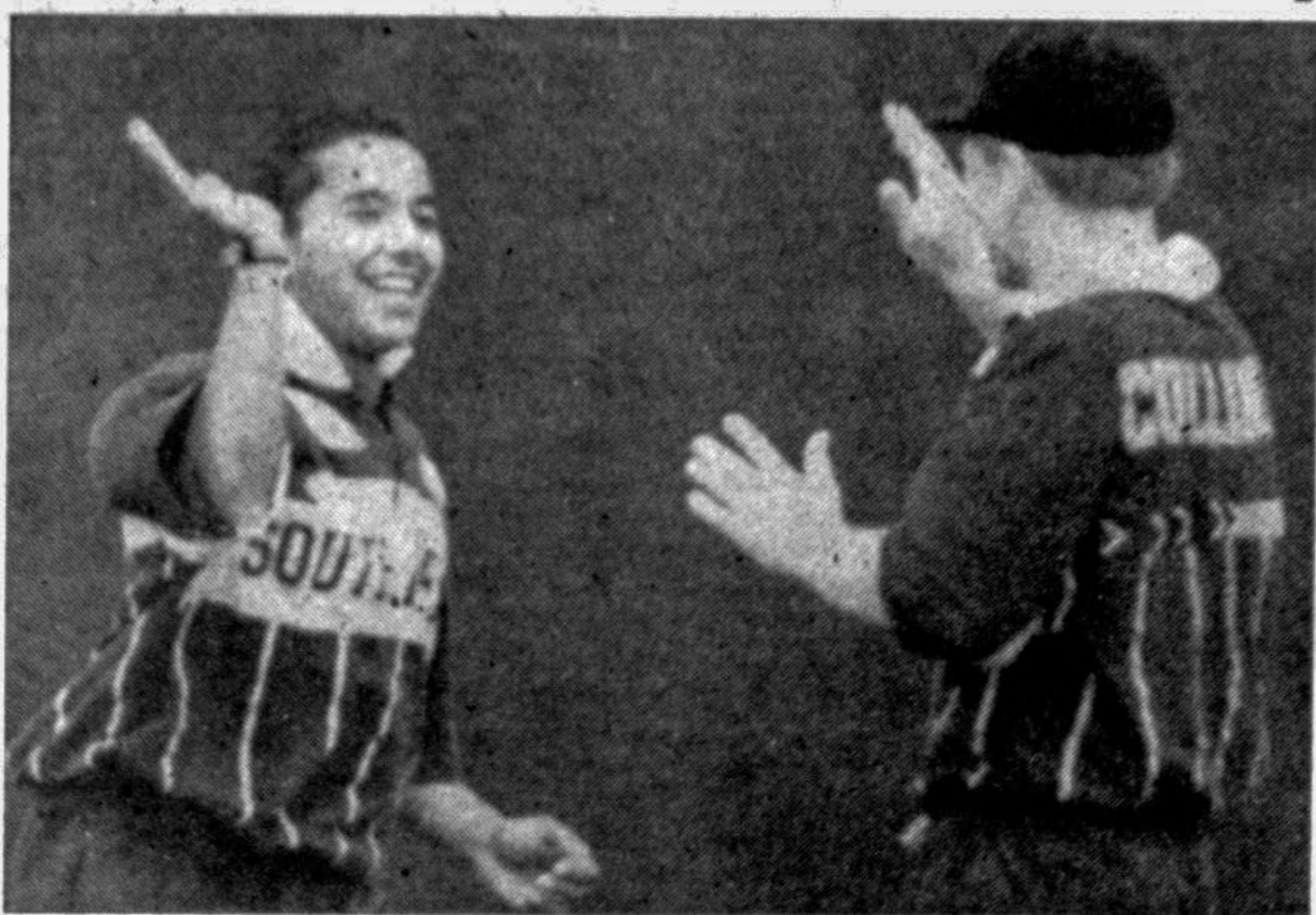
HIGH FIVE: South African teenage bowling sensation Paul Adams (L) celebrates capturing his maiden World Cup wicket of Salim Malik with teammate Daryl Cullinan during their crucial match against Pakistan in Karachi yesterday.