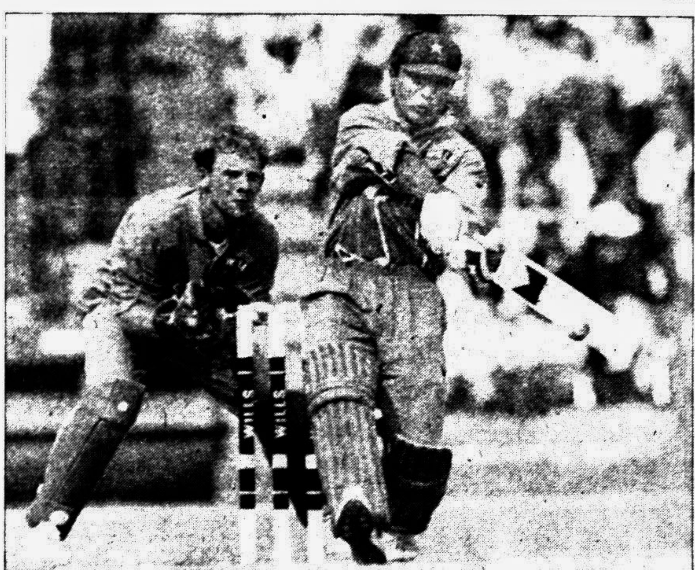
WHACK! Dashing Pakistani opener Saeed Anwar executes a pull shot during his sizzling unbeaten innings of 83 against Holland in Lahore yesterday. Pakistan romped home keeping eight wickets, intact.