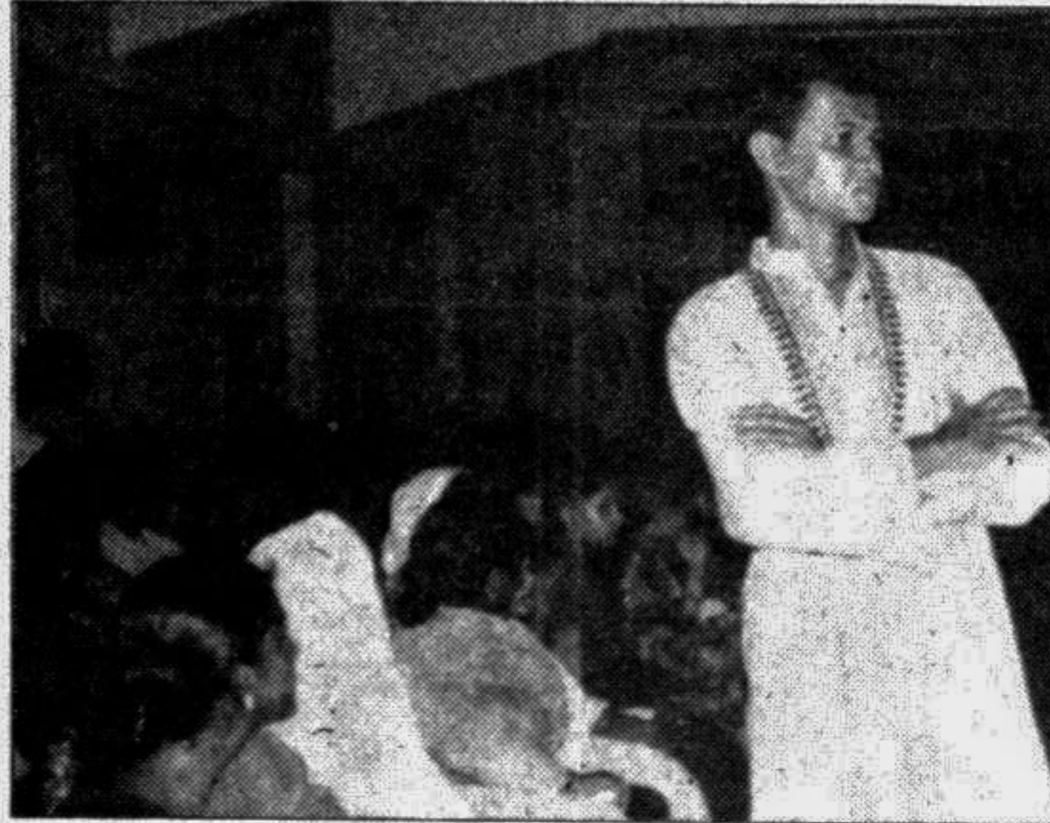
An Eid fashion show, first of its kind, was organised in Barisal town recently.