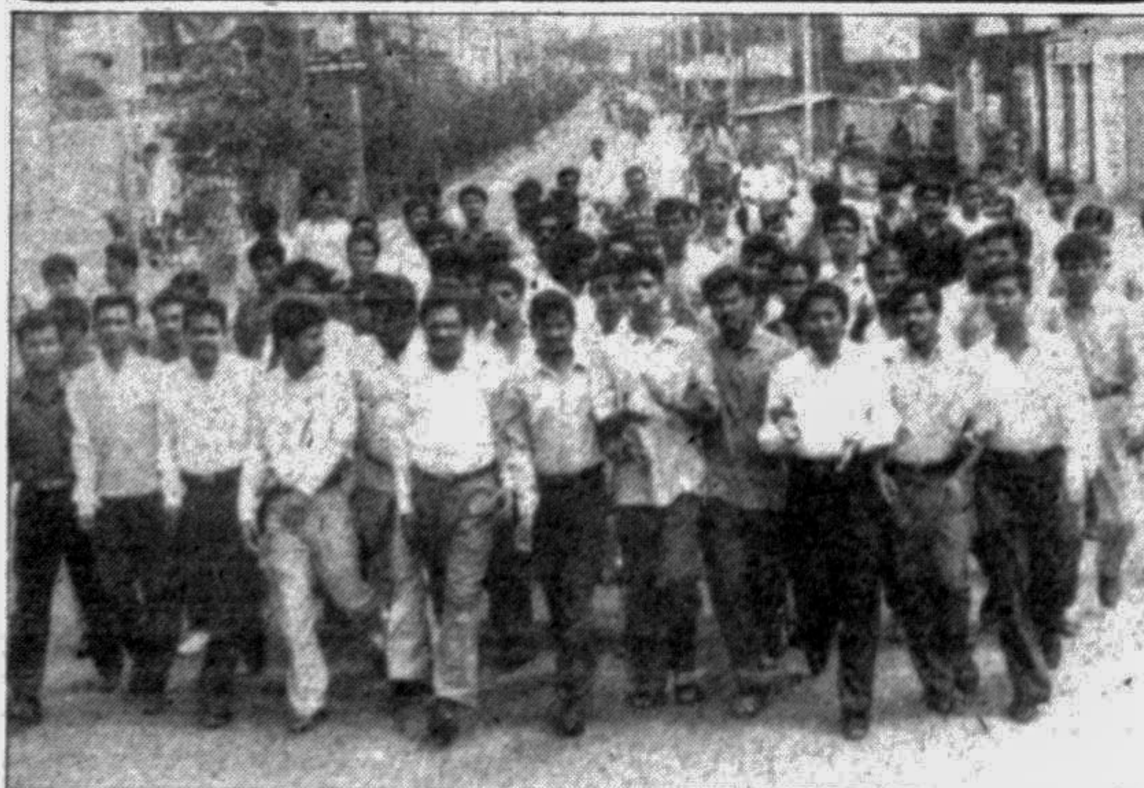
The Jatiyatabadi Chhatra Dal brought out a procession in the city yesterday protesting opposition's programme.

Nor are the baby-taxis being left behind in this game. One zoomed past me, bearing the legend, "Ei rasta kobey phurabey" (when will this road finally come to an end) A number of them have also adopted the slogan of "Amakey mero na, ami choto" (don't hit me, I'm little. Though perhaps in their case, it has less to do with a sense of humour and more with a sense of self-preservation! Whatever their motives, they certainly provide the bored motorist with some amusement during Dhaka's rush-hour gridlocks.