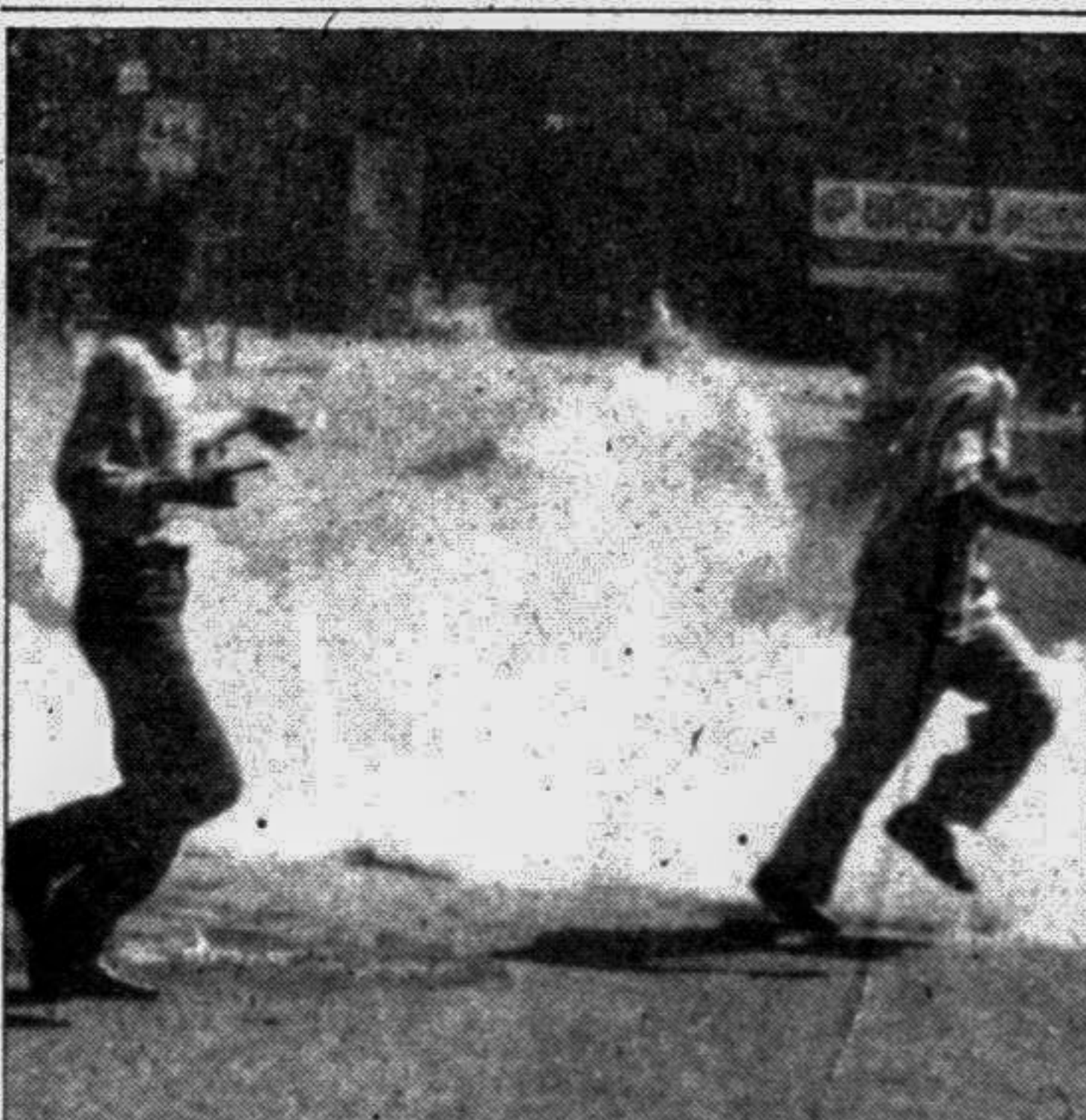
Police lobbed tear gas shells to disperse pickets at the Bangabandhu Avenue in the city yesterday.

It further observed that more strikes and street violence, and an unwillingness to compromise suggested by Sheikh Hasina's increasingly confrontational political vocabulary would also risk a more severe clampdown. Absence of negotiations is threatened with a resulting cycle of agitation and repression.