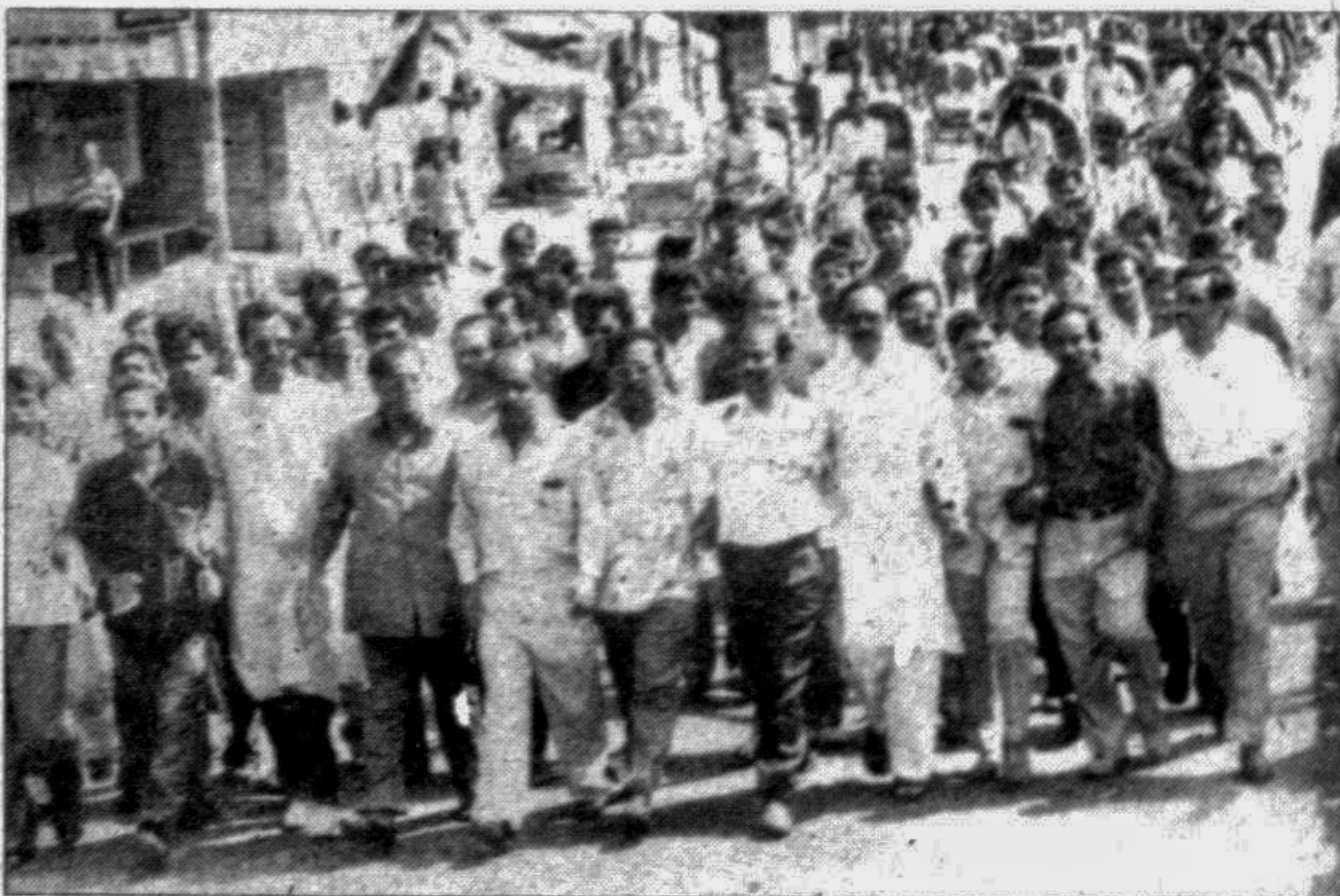
A Jatiya Party procession in city's Purana Paltan area yesterday.