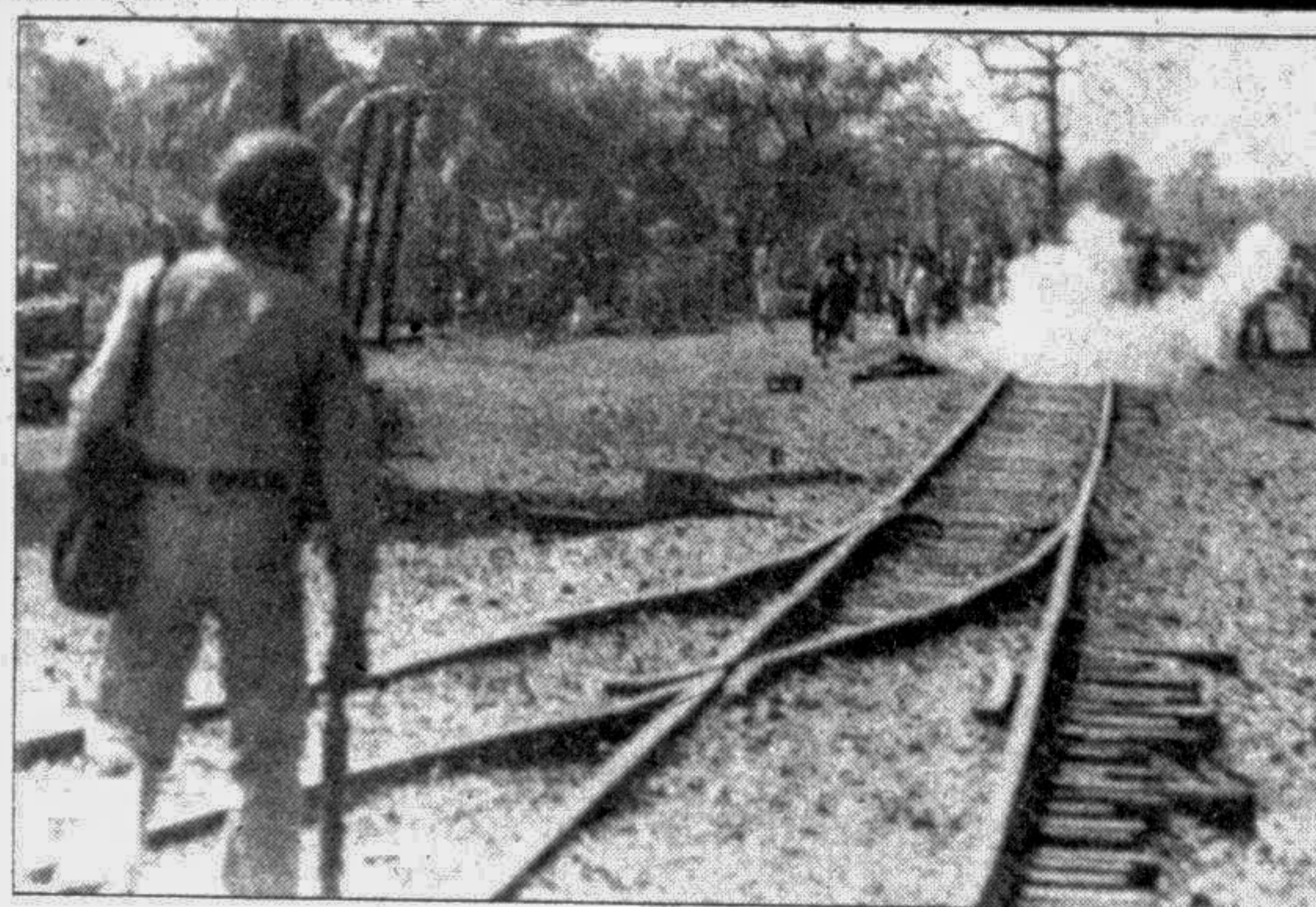
Pickets hurled bombs during clashes with police in Tongi yesterday.