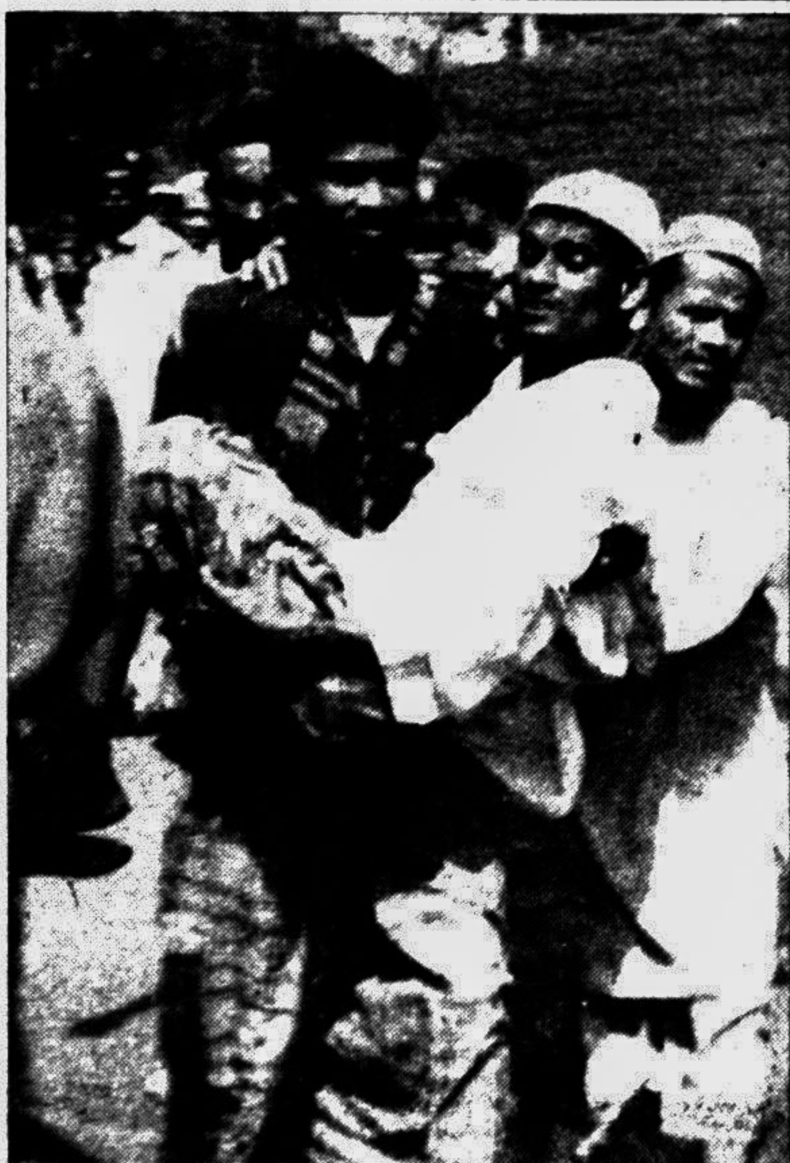
A pedestrian was injured in a bomb blast in front of the Jatiya Press Club during Opposition's non-cooperation programme yesterday.