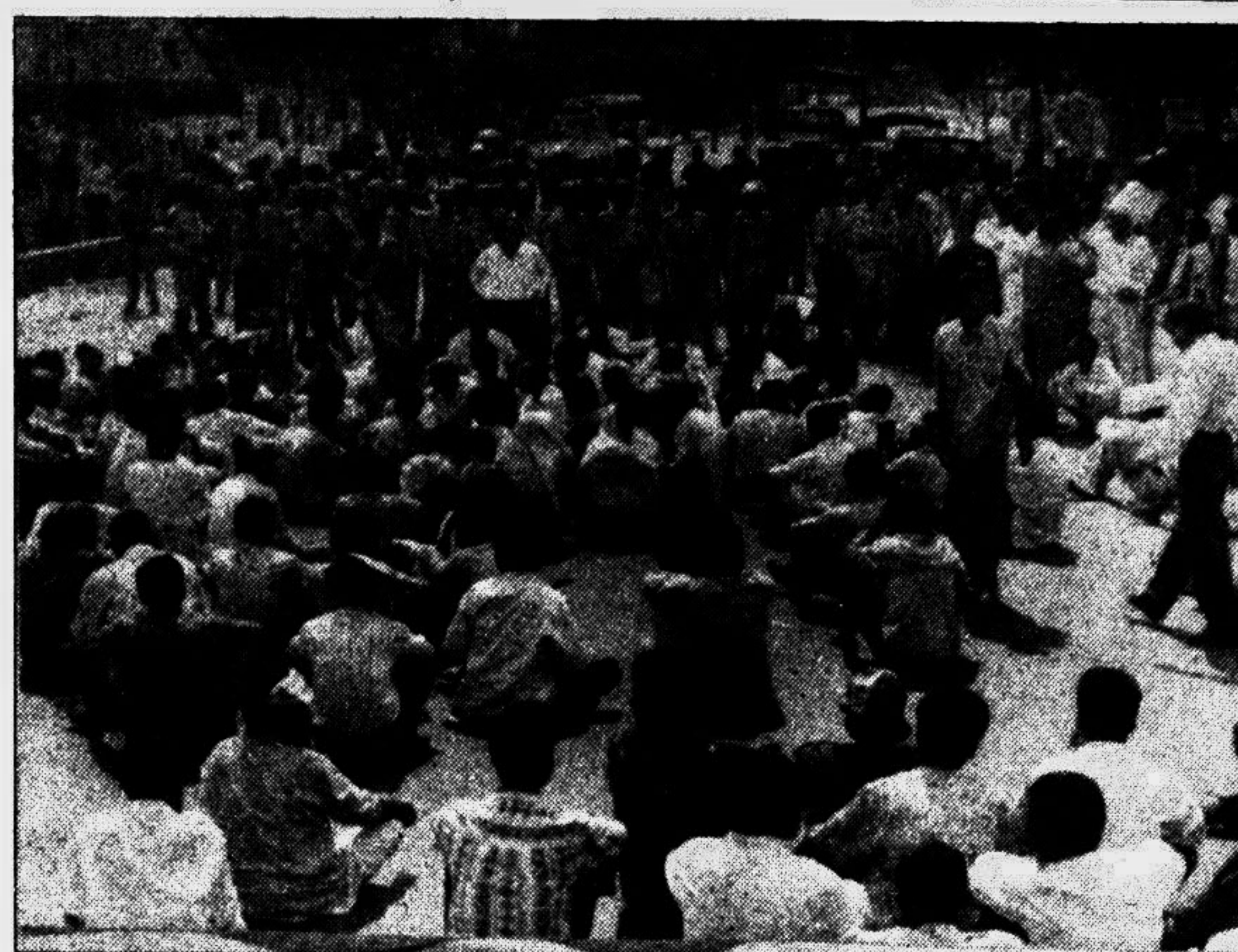
Awami League activists staged a sit-in in front of the Bangladesh Secretariat yesterday.

The DRU leaders urged the government for proper investigation into the incident and measures to stop recurrence of such incidents.