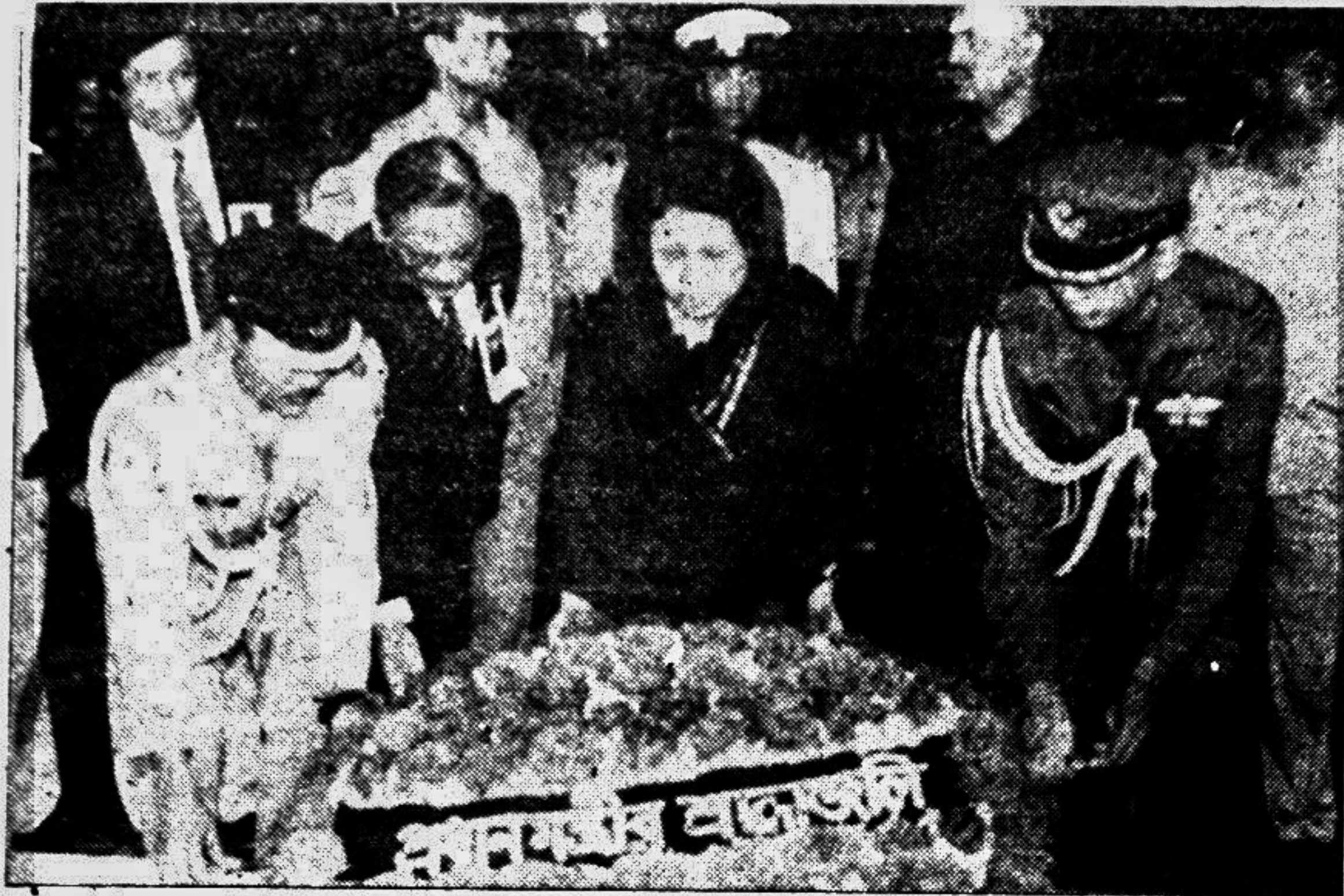
Prime Minister Begum Khaleida Zia placing wreaths at Shaheed Minar.