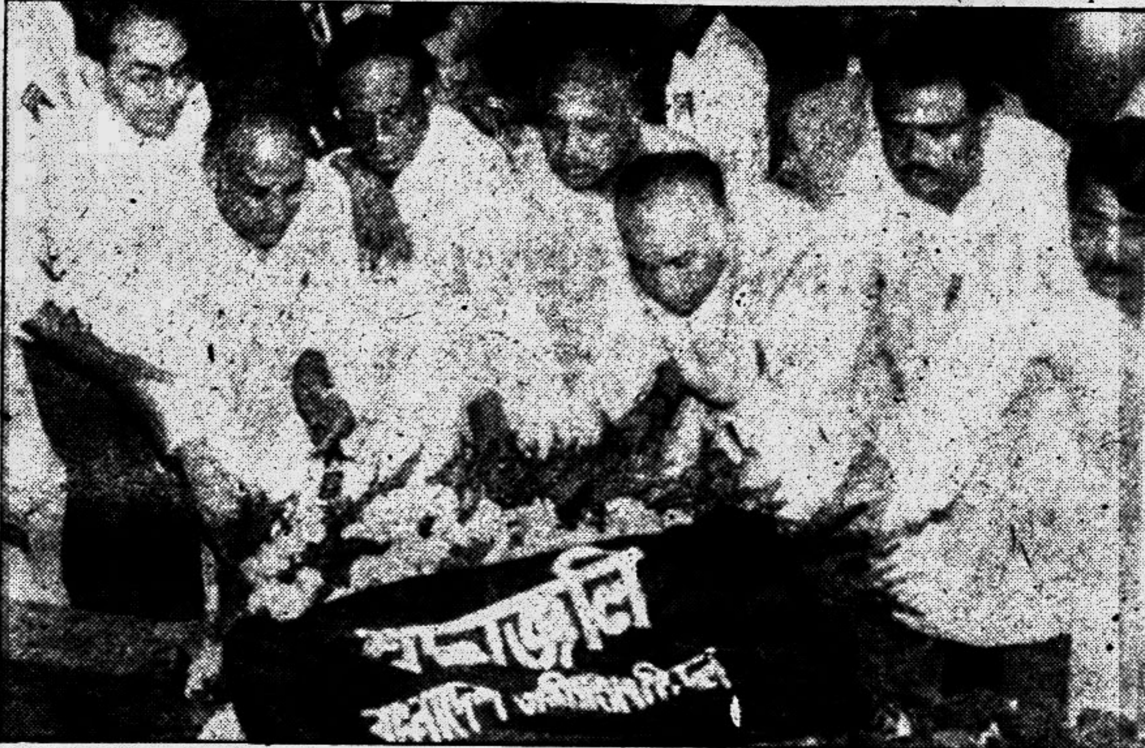
BNP leaders.