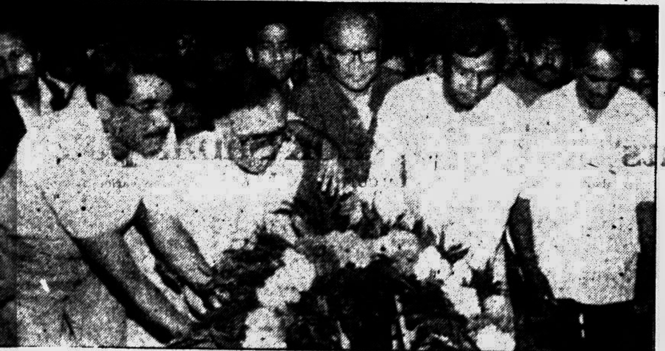
Sammilito Sangskritik Jote.