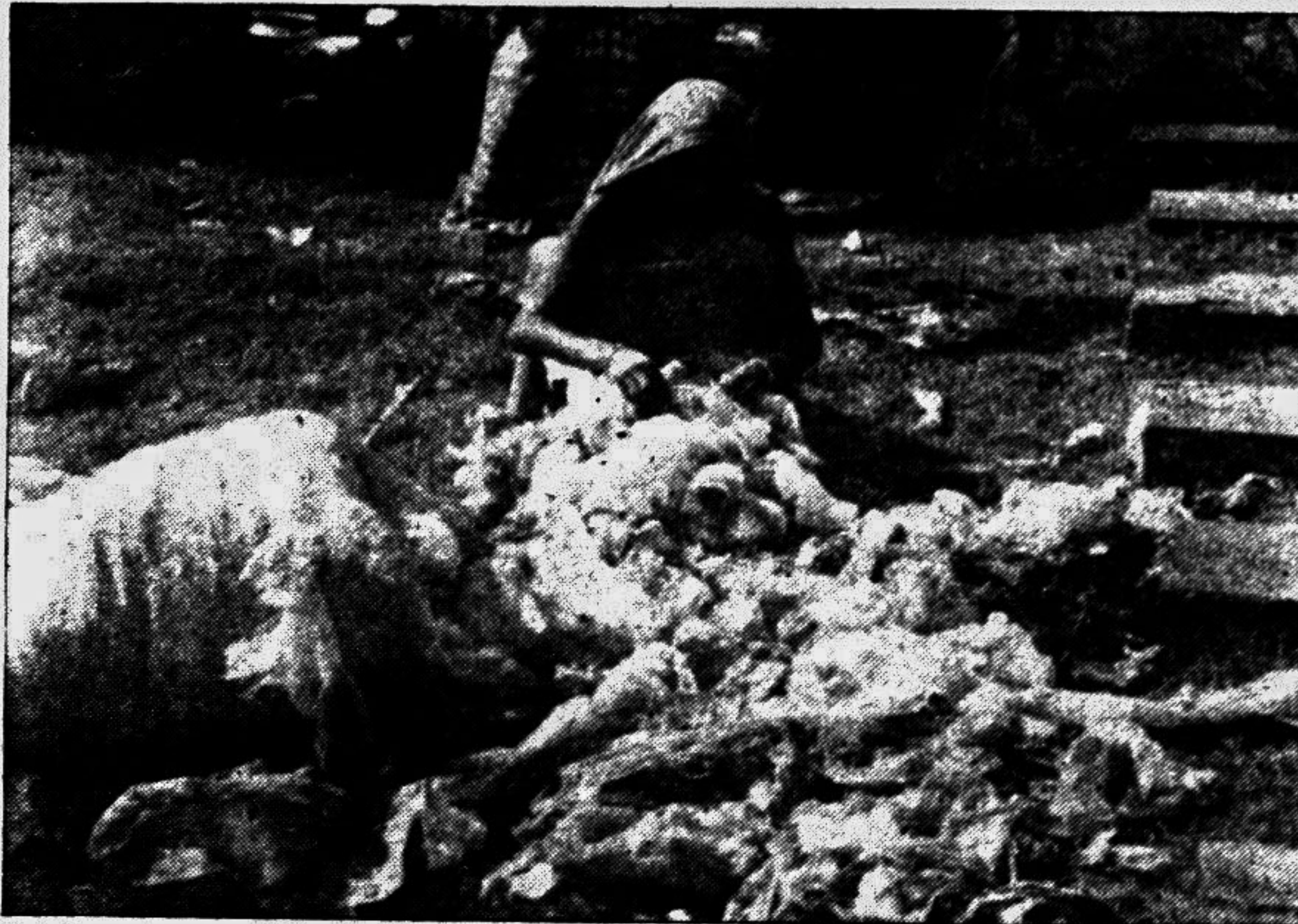
Polythene bags are being cleaned after collection for sale.