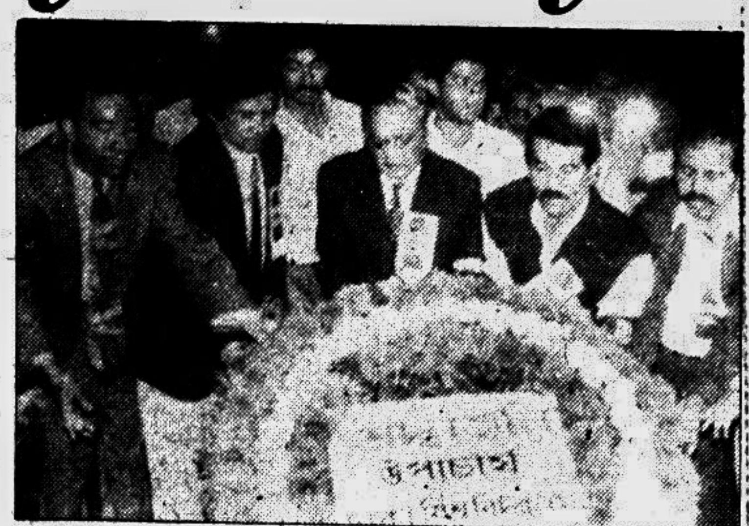
Dhaka University VC.