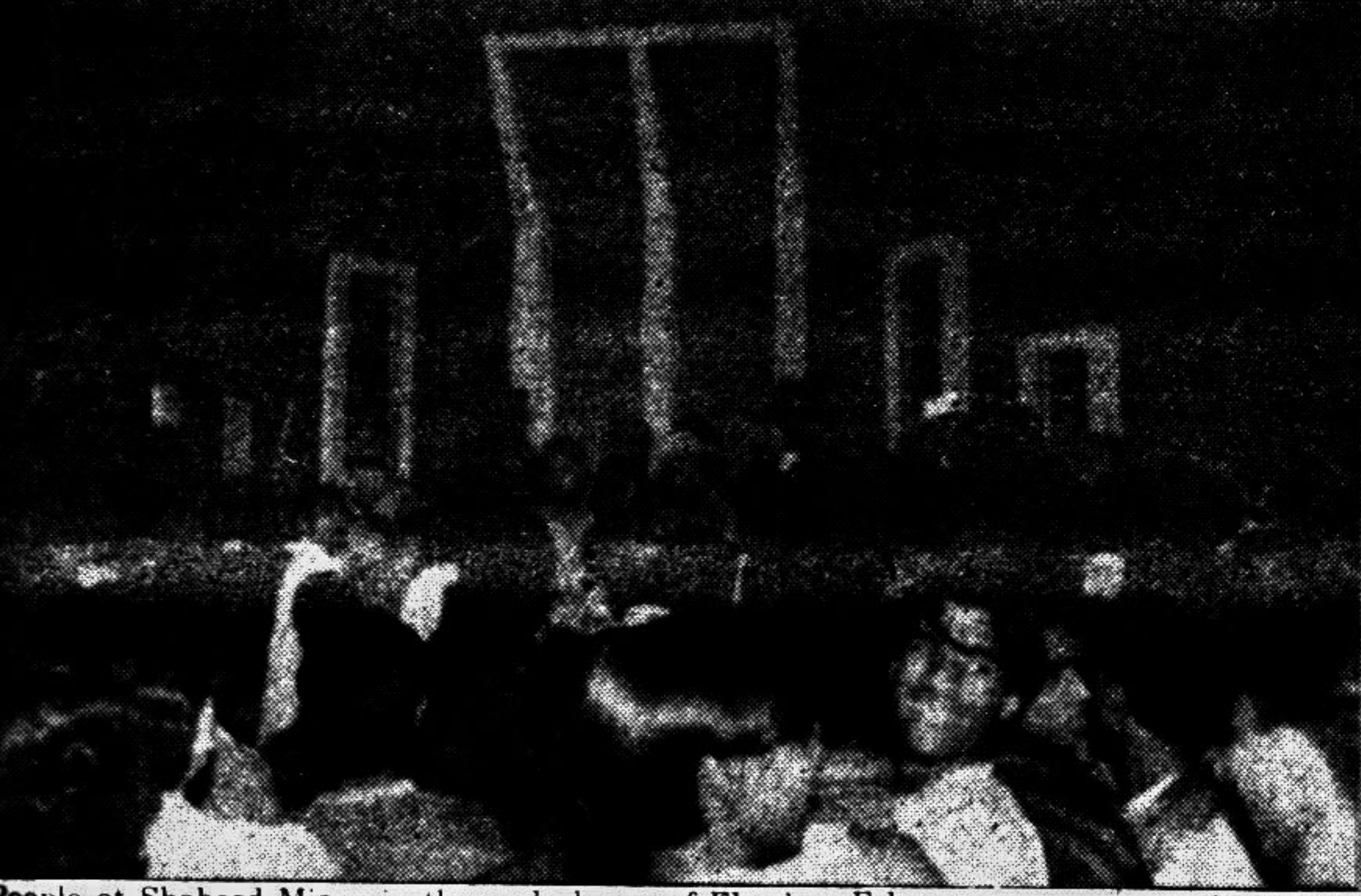
People at Shaheed Minar in the early hours of Ekushey February.