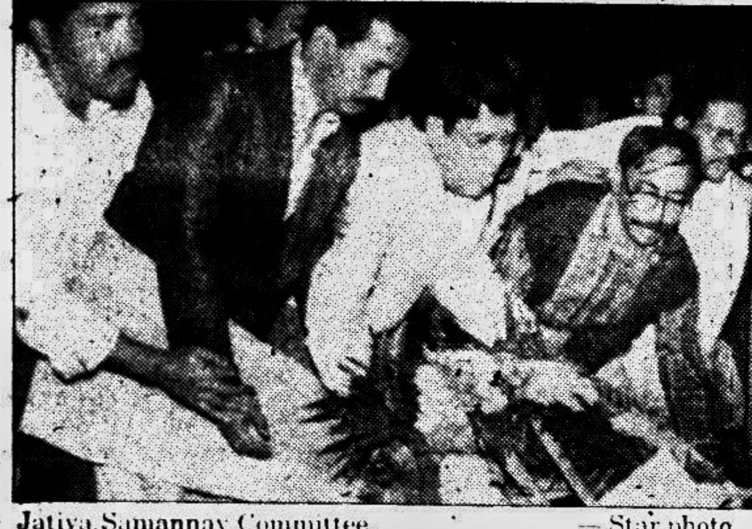
Jatiya Samannay Committee.