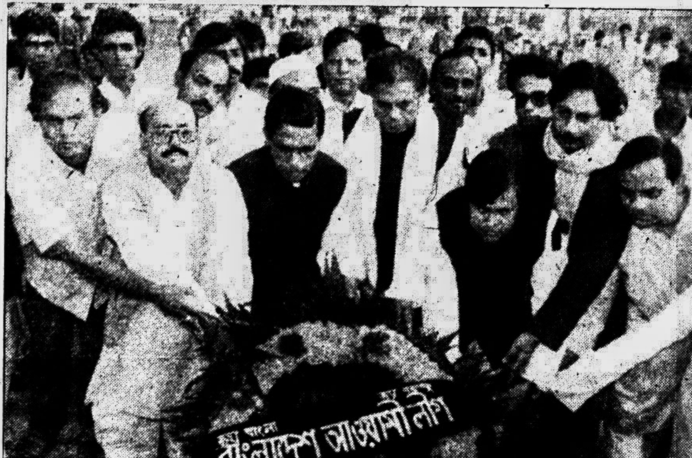
Awami League leaders.