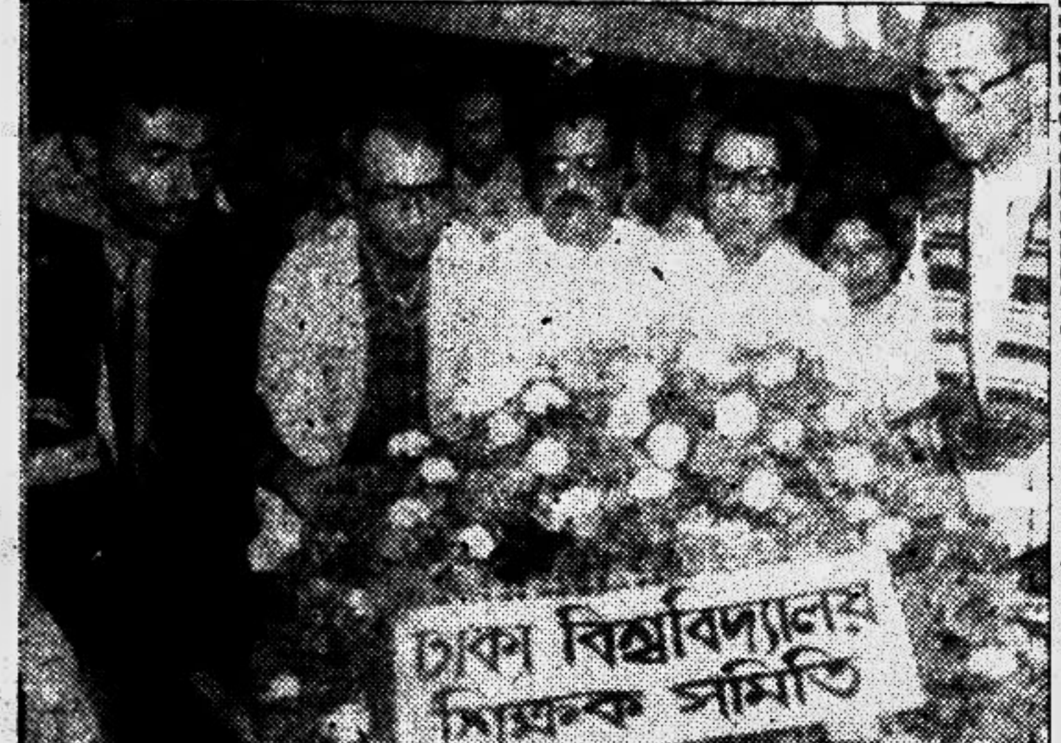
Dhaka University Teachers' Association.