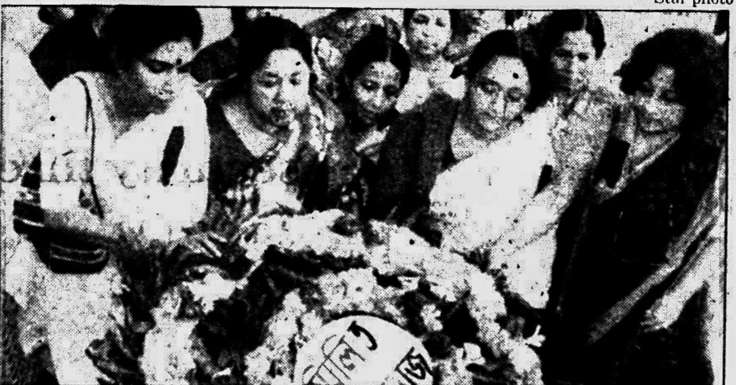
Sammilito Nari Samaj.