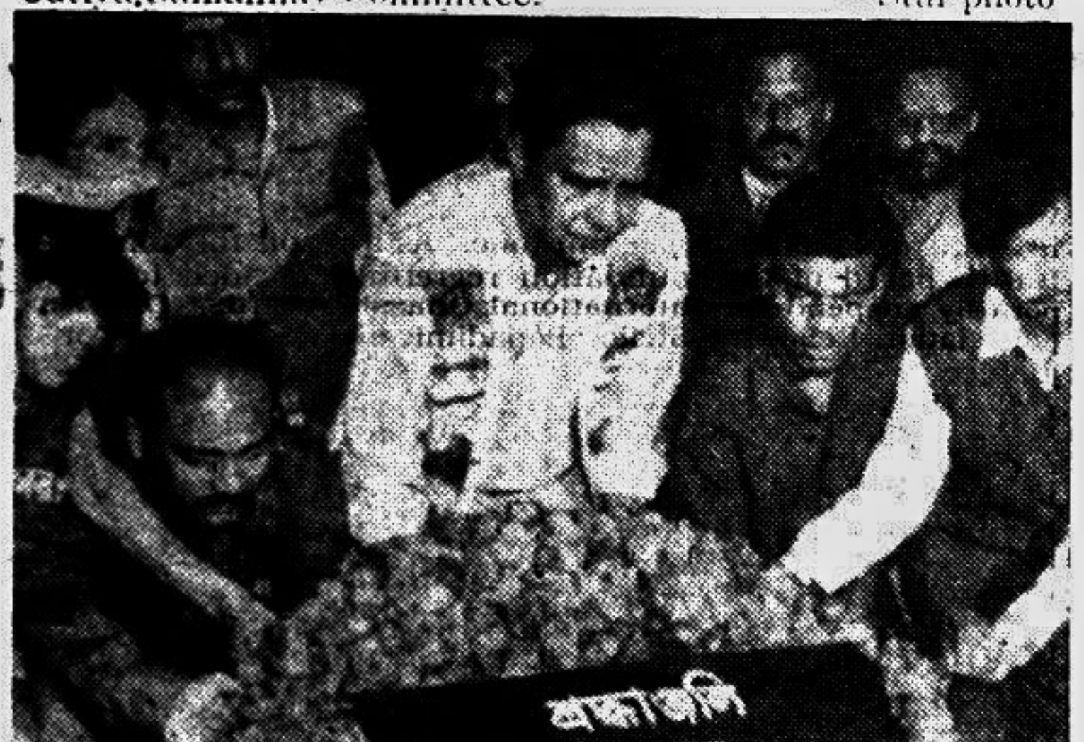
DCC Mayor.