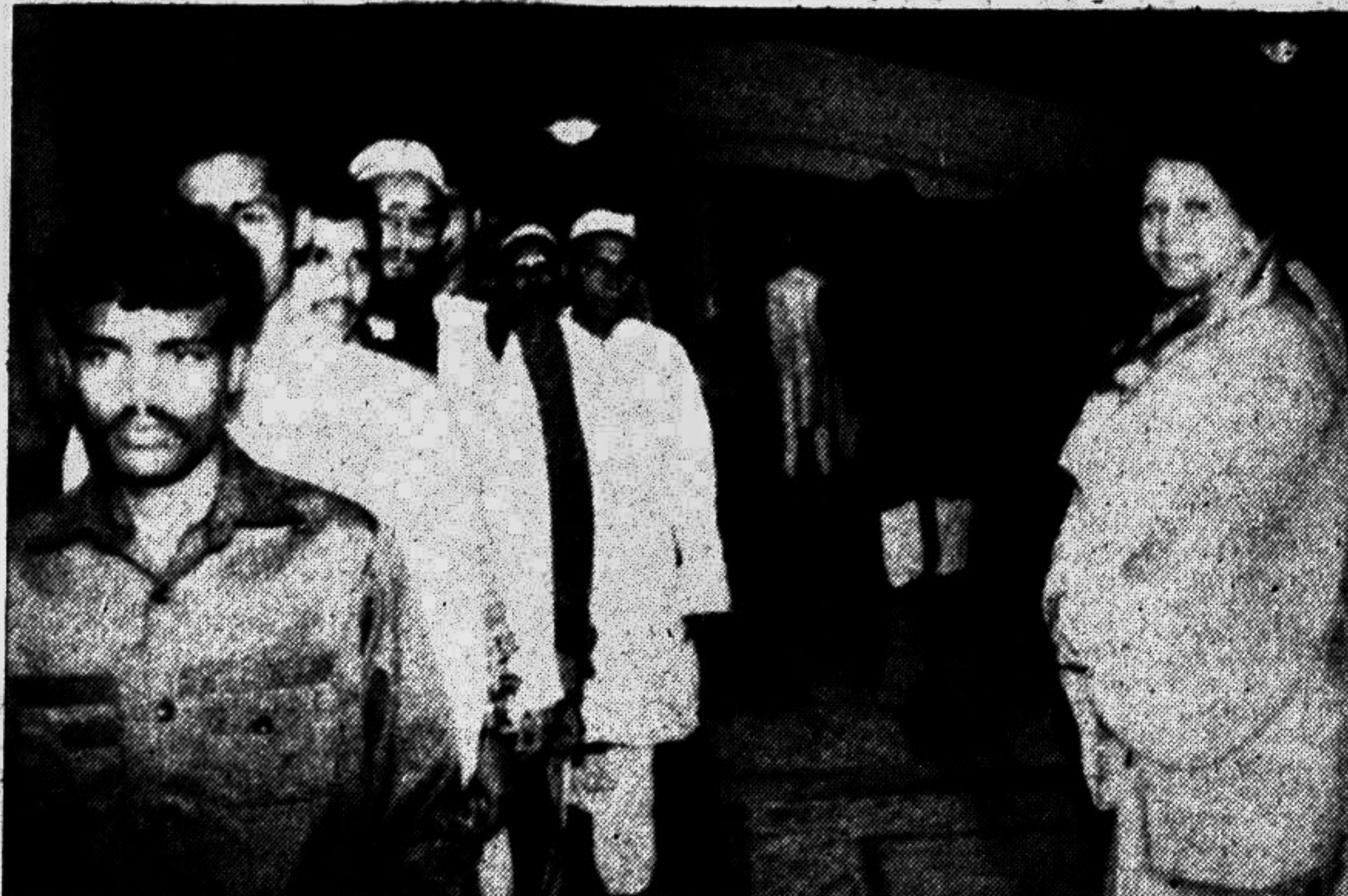
Prime Minister Begum Khaleda Zia exchanging Eid greetings at her Hare Road office on Wednesday.

Government of the People's Republic of Bangladesh Ministry of Food Bangladesh Sectt, Dhaka No. MOF/SEC-12/IMPORT-1/96-209 Dated 18.02.96 Sub: Ministry of Food's International Tender Notice for Import of 50,000 MT Parboiled Rice vide Memo No. MOF/SEC-12/IMPORT-1/96/77 Dated 18.2.96 Due to unavoidable circumstances, the opening date of the above tender is hereby shifted from the 26th February, 1996 to 27th February, 1996 for convenience of the Tenderer. The validity of the Offer to be kept up to 1700 Hrs. BST on 03.03.96. 2. The other terms & conditions of the tender will remain unchanged. DFP-4261-18/2 G-283 Dr Yeamen Akbory Asstt Secretary