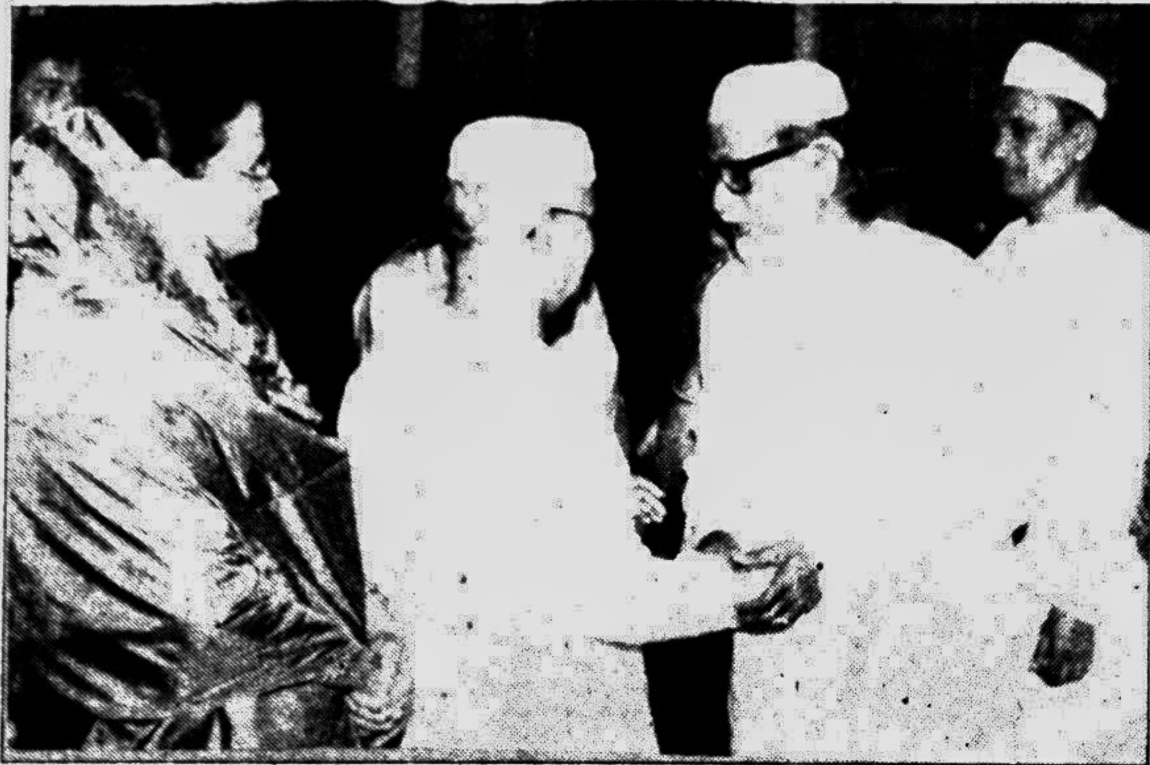
President Abdur Rahman Biswas and Begum Biswas exchanging Eid greetings with Land and Justice Minister Mirza Golam Hafiz at the Bangabhaban on Wednesday.