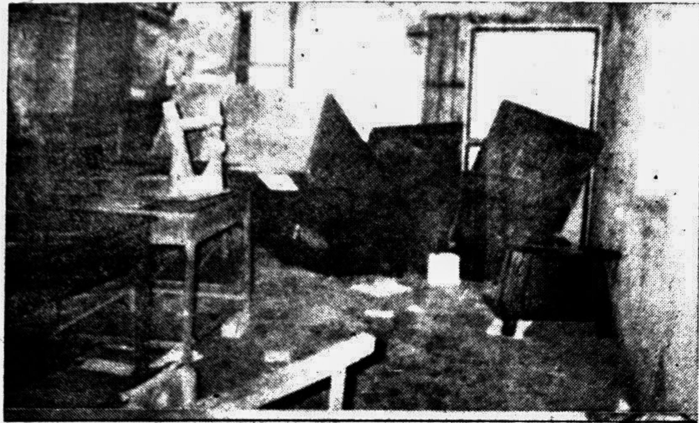
CHANDPUR: An election booth was ransacked at Railway Academy High School on the election day.