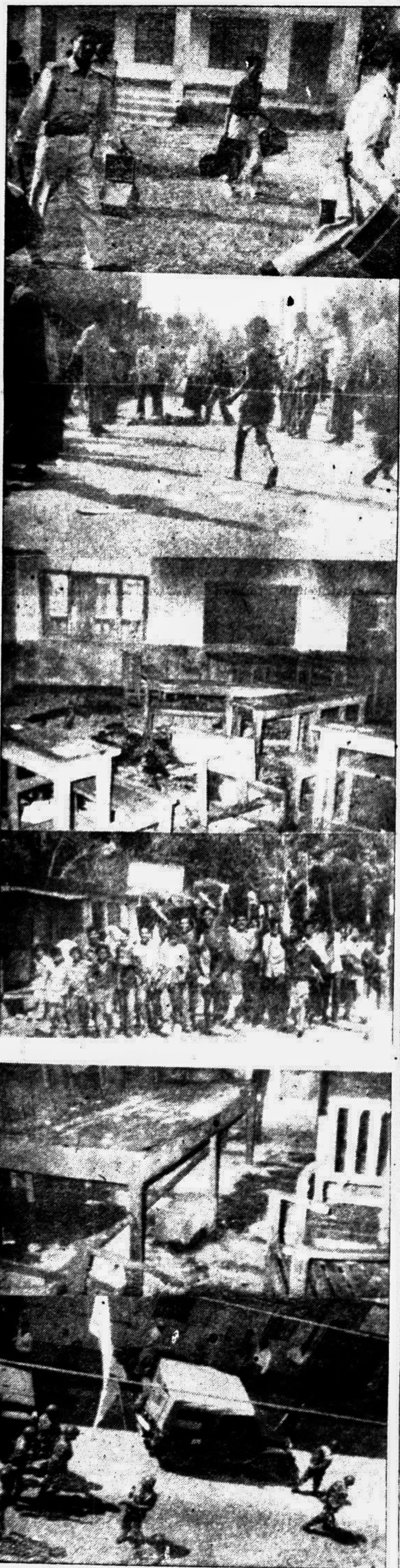
From top: Police recovering ballot boxes snatched away earlier on the election day. Ballot papers seen lying on the streets near Digerpar school in Sherpur district pourashava. A polling centre ransacked on the election day in Barisal town. Anti-election activists brought out a procession after snatching away ballot boxes from a polling centre in Sherpur district town. Scene of a polling centre in a girl's school in Barisal town after it was set on fire. Army personnel patrolling