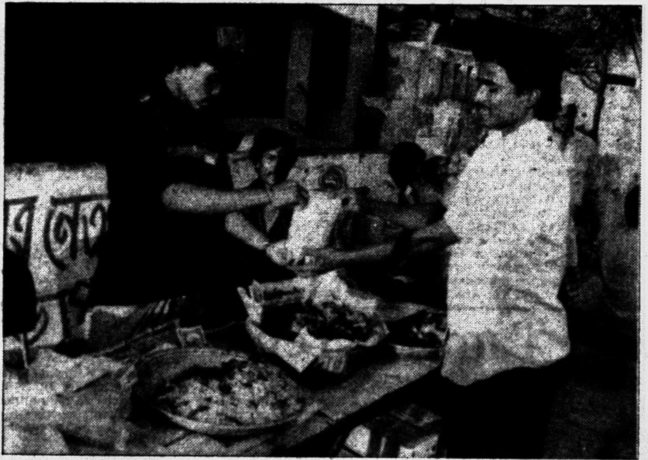
Delicacies all right, hygiene doubtful.

participating in the Ramadan spirit. In the afternoon, the city wears a festive look as food stalls are set out at almost every strategic points or road corner. One sees this kind of a cloth-draped stall every few hundred yards selling samosas, chola bhaja , jalebis, murt (puffed rice), halim etc etc and many other types of Ramadan delicacies. The stalls in old Dhaka are the ones that offer the best varieties and mouth-watering delicacies. Sales are extremely high though one wonders a bit about the "hygiene" conditions as the salesmen grab the food in their bare hands and pack them and handle our dirty taka-notes with the same. Yet, there is no shortage of happy customers and many of the stalls become overcrowded by 4 pm. The mouth-watering aroma fills up the air and arrests the attention of all the people in the streets, especially those stuck in our ever familiar traffic-jams as almost every one at this time returns home to break their fasts at iftar. Even the poor people return back and the beggars start making their usual rounds around the houses just before iftar. The people, in keeping with the holy spirit, are very generous and hardly any beggars are returned without a fair offering of iftari. Ramadan is the month of sanctity, the month that we are to test our temptations and the holy spirit more or less brings out the best in every one. How nice it would have been if we all would have shown our better sides all the time!