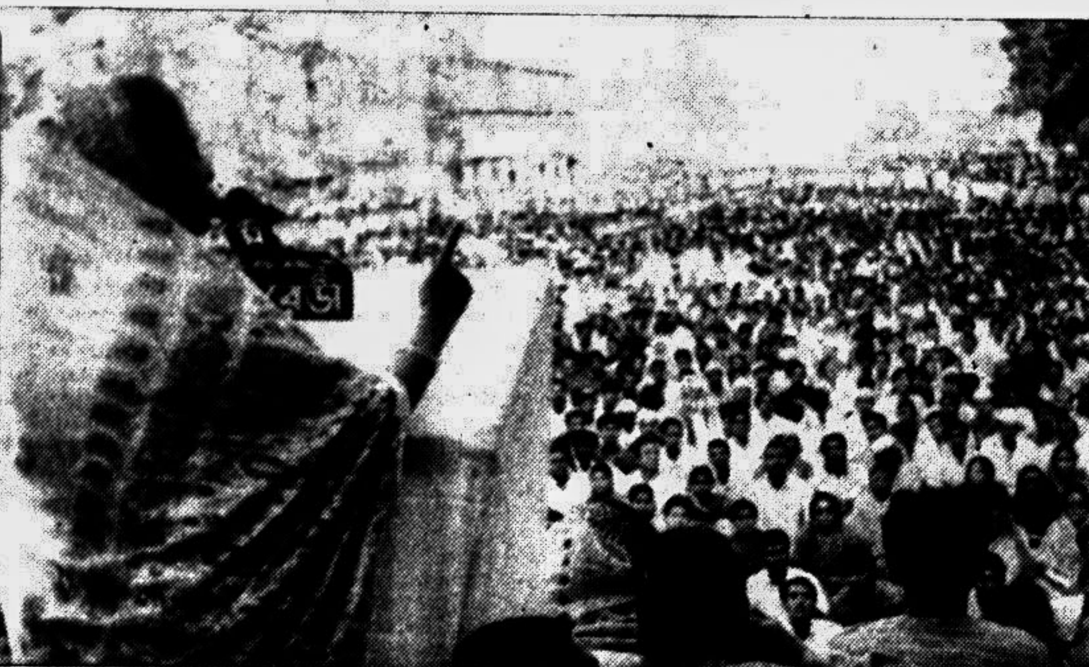
Awami League chief Sheikh Hasina addressing a rally in front of the Jatiya Press Club yesterday.