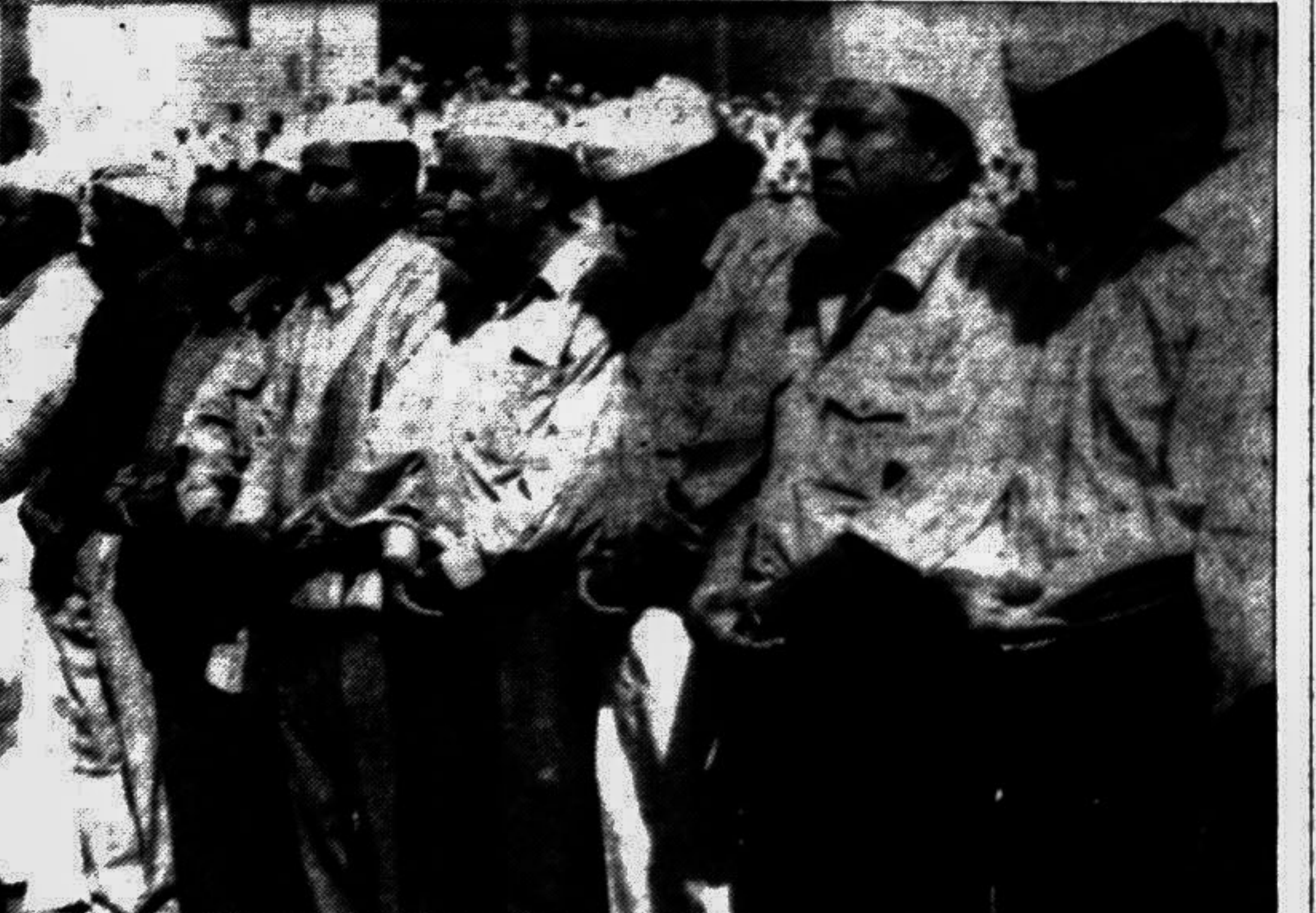
A gayebana janaza was held at the Baitul Mukarram Mosque yesterday seeking blessings for those killed in election-related violence on Thursday.