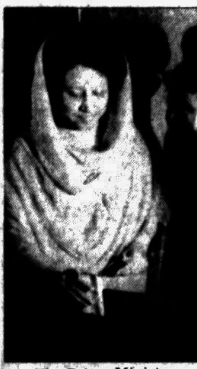
The Prime Minister casting vote