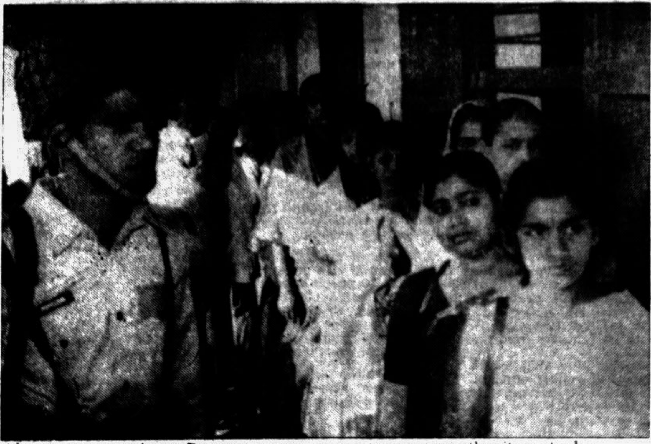
Female voters queuing at Batamuli High School polling centre in the city yesterday.