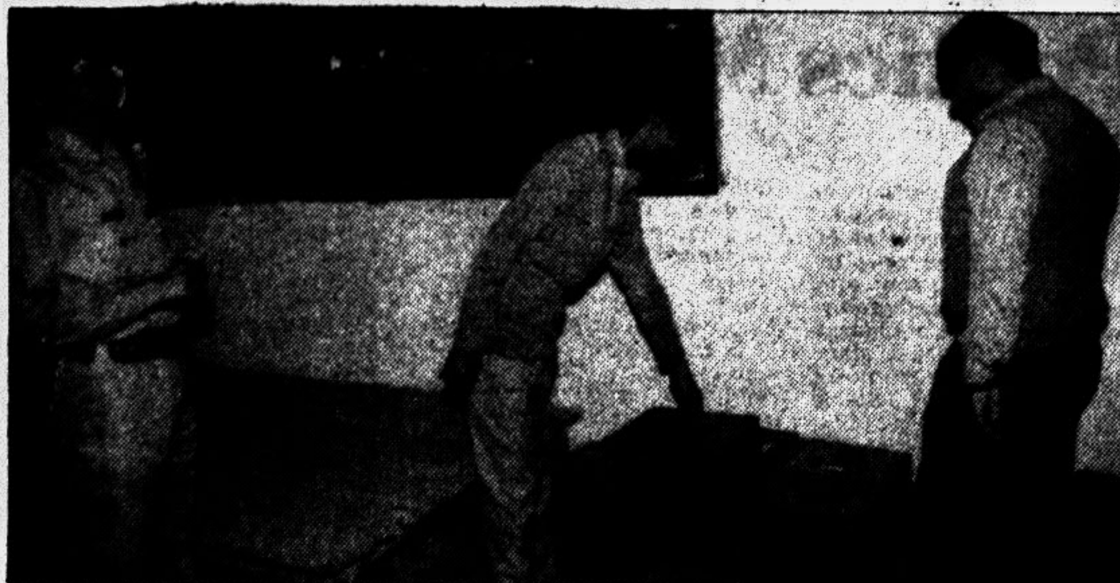
Ballot boxes have been dispatched to the polling centres. This picture was taken from city's Ideal High School yesterday.