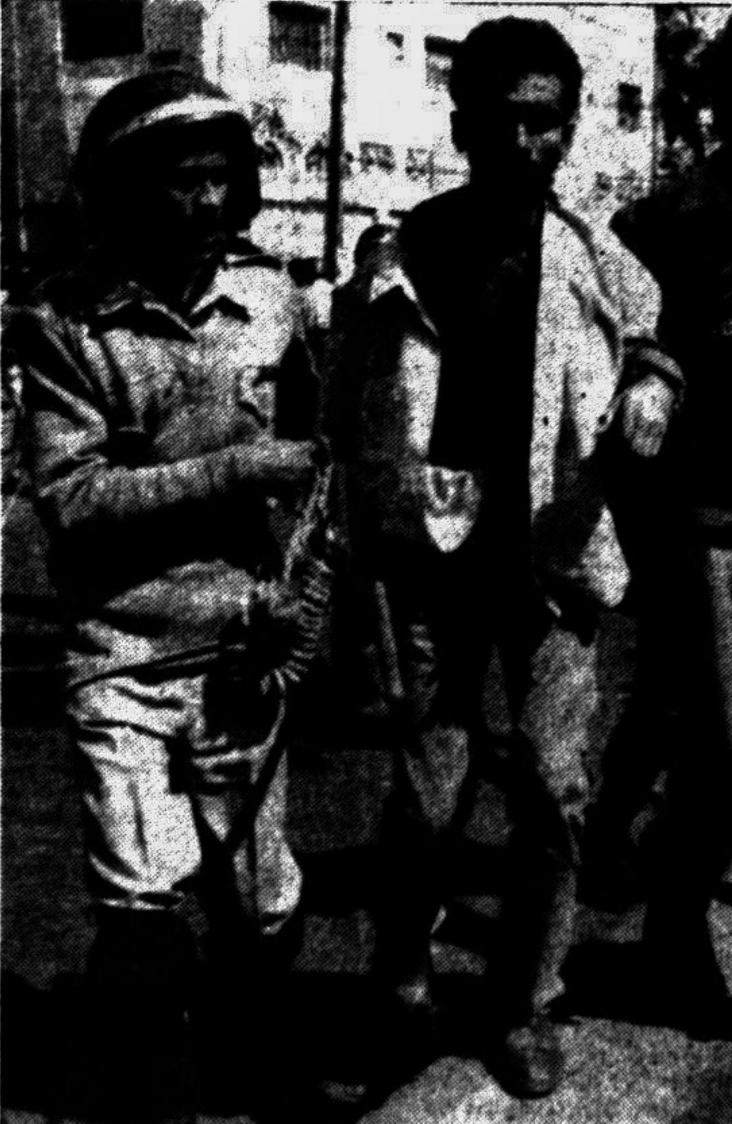
A hartal activist being taken into police custody from city's Tophkhana Road yesterday.

The 10 kilometre road links the town with Kotbari which is well-known for various reasons. The Bangladesh Academy for Rural Development (BARD) is situated here. A large number of dignitaries from home and abroad, including head of states, ambassadors and scientists frequently visit the academy. Besides, Kotbari is also famous for its tourist importance.