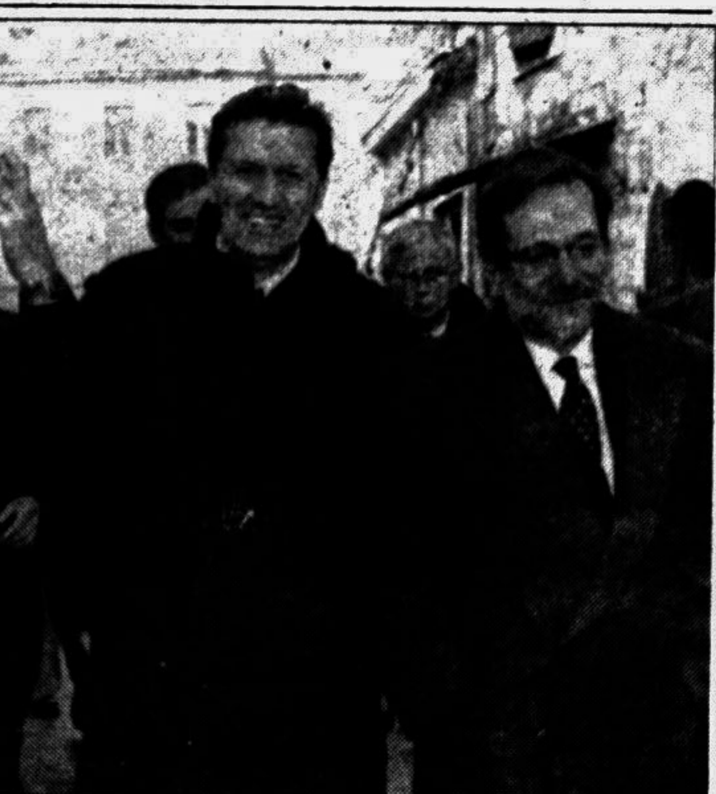
EU Administrator Hans Koschnick (L) shows 'crossed fingers' as he along with Ejjup Ganic (C), Vice-President of the Bosnian-Croat Federation, and NATO Secretary General Javier Solana (R) tours the Muslim part of the divided city of Mostar on Monday.

Off the Record Deal with drug dealers: RIO DE JANEIRO: Reports Monday said pop superstar Michael Jackson paid drug traffickers for permission to film a music video in a city slum.