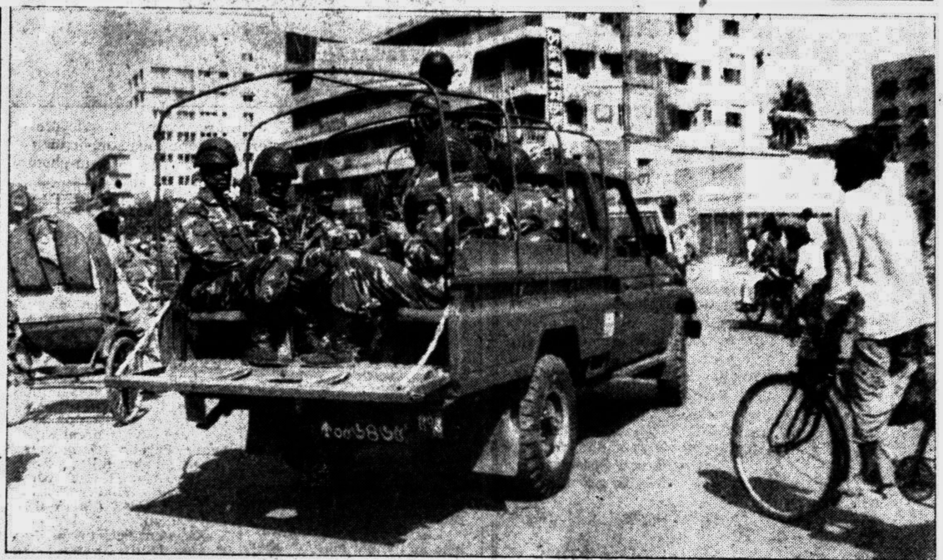
Army patrolling the City streets during the Opposition-called barricade programme yesterday.