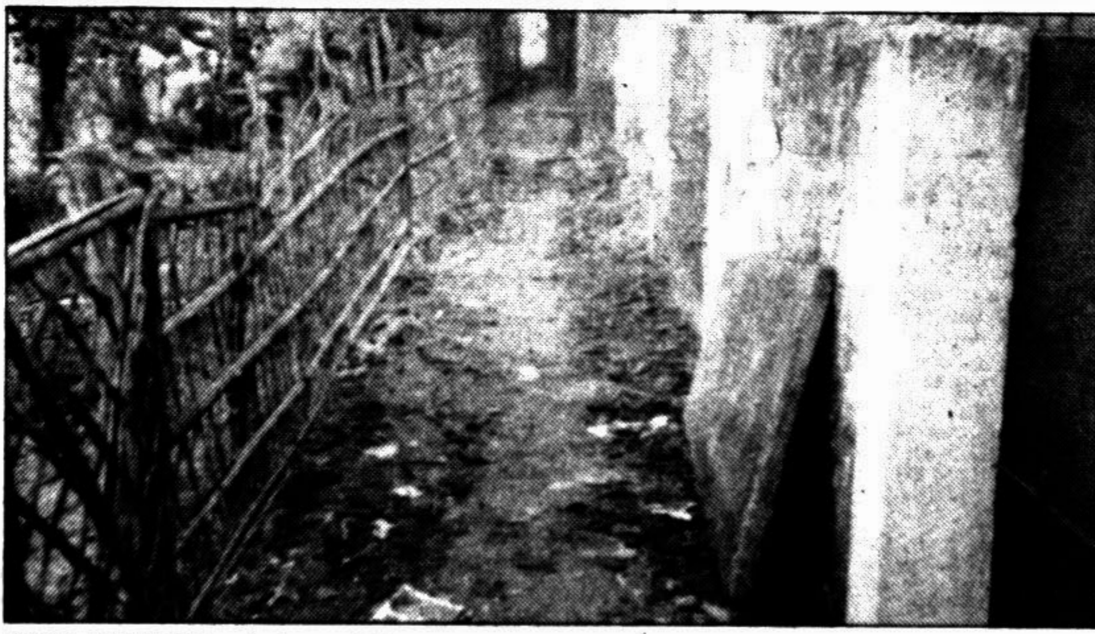
MOULVIBAZAR: A view of illegal occupation by local people on the Monu river flood protection embankment.

ter in the embankment with human habitation causing serious threat to the flood protection embankment.