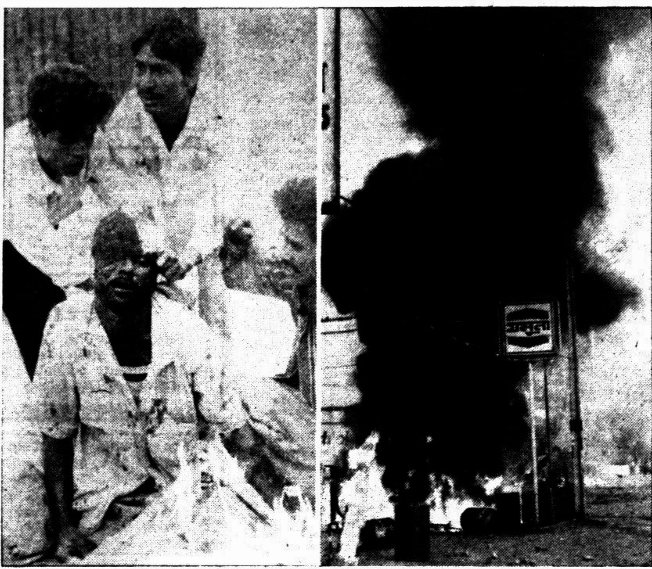
A bullet-hit person is being dressed (L) at petrol pump was set afire in Sobhanbagh area (R) during yesterday's clashes.