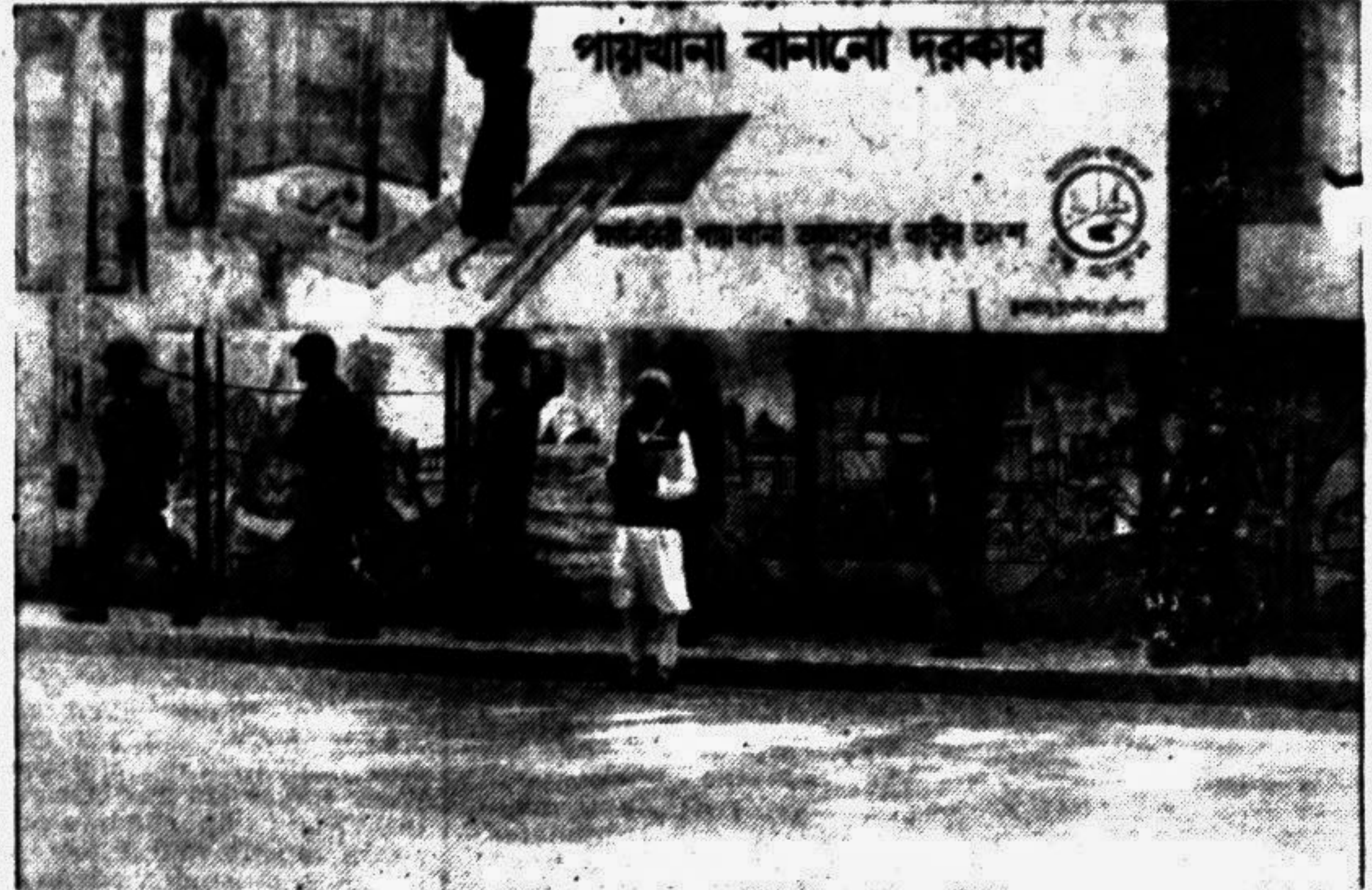
Members of the combined force cordoned the Dhaka University campus during raid on the halls yesterday.