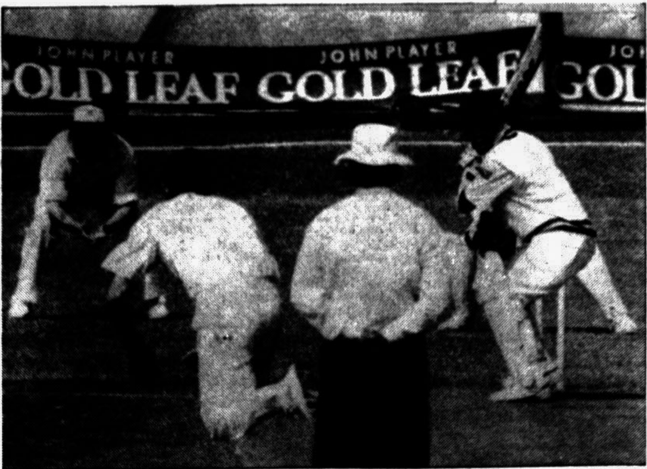
Ziaur Rashid Rupom in all concentration as he prepares for a backfoot stroke. Rupom made an impressive debut for the national side yesterday.