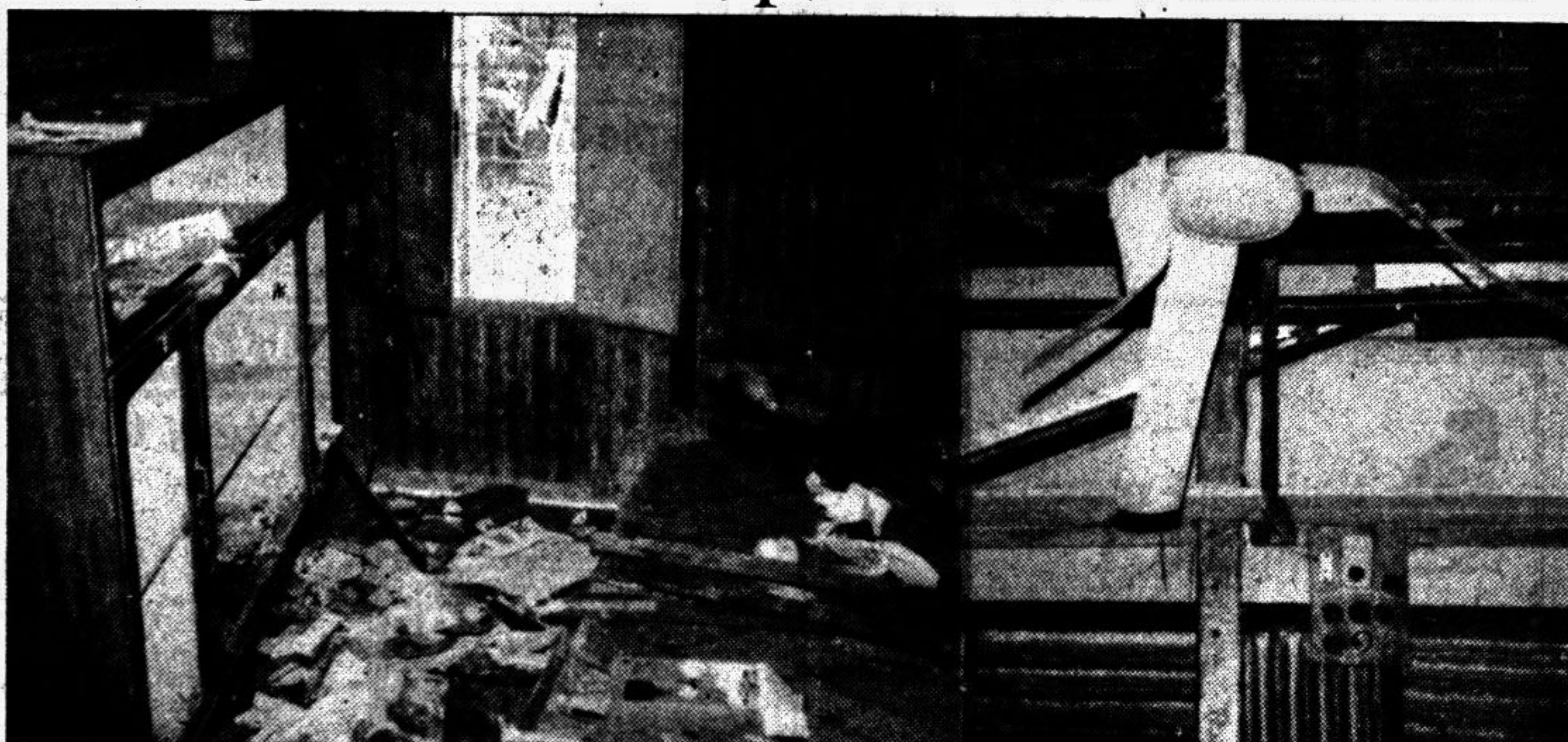
A ransacked house in village char Sayedpur.