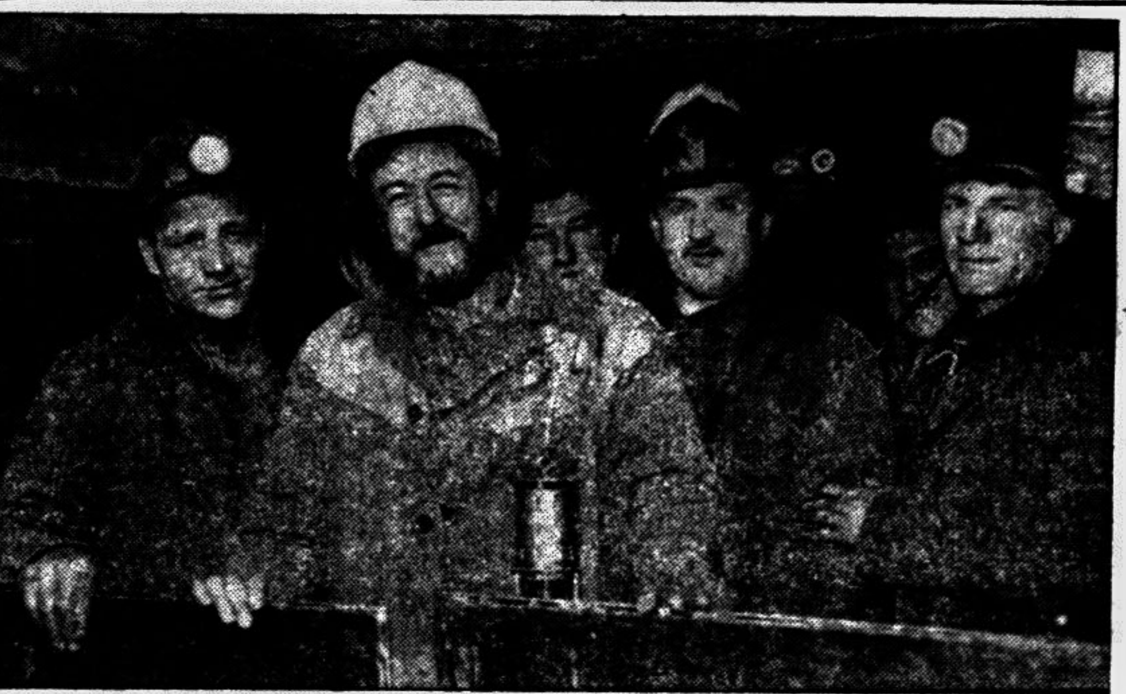
A group of Russian coal-miners gets ready to go back to work in the Rodmoskovkaya mine, 200 km south of Moscow, after the mines' union accepted the offers from the government...