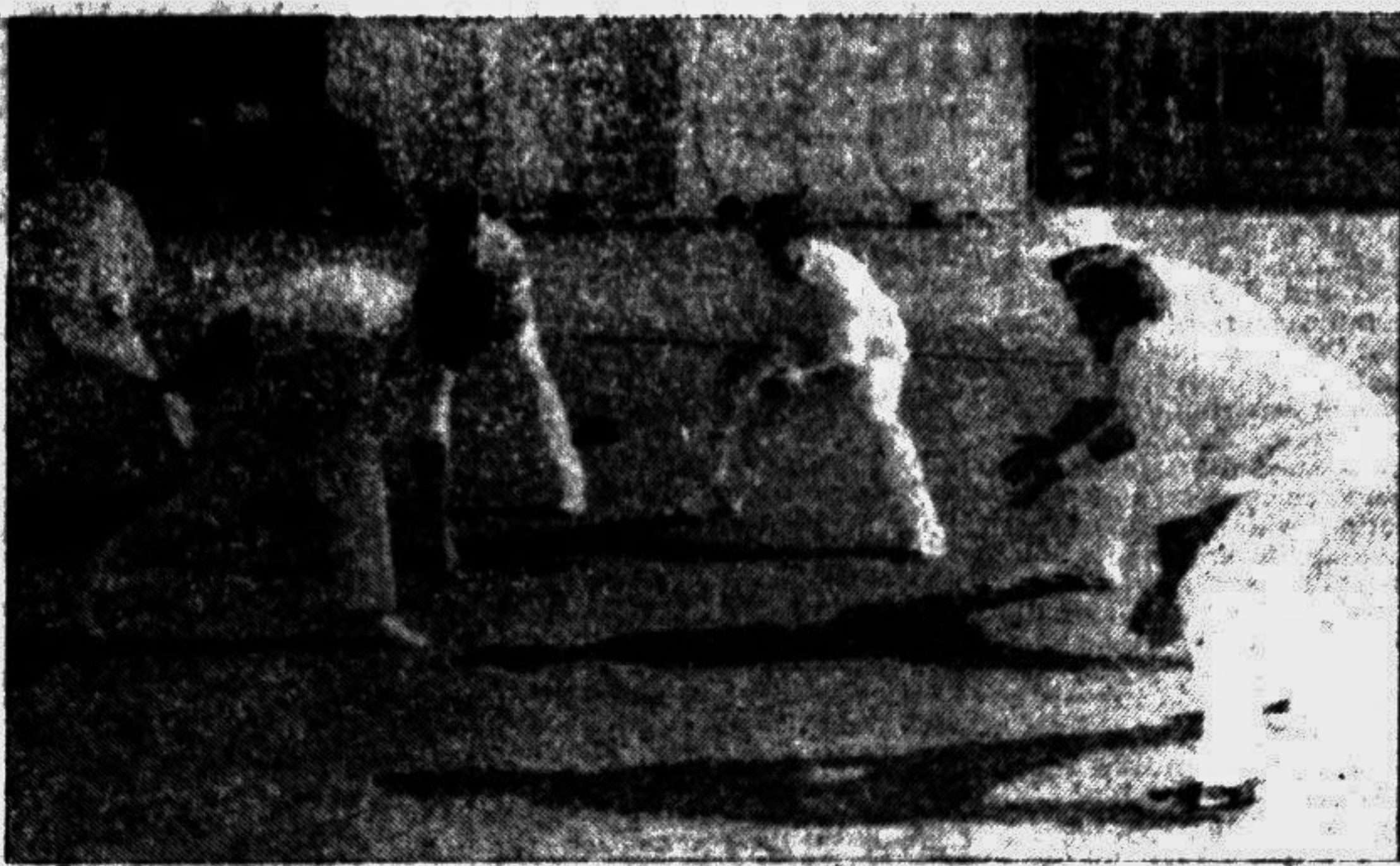
The visiting MCC cricketers, who arrived in the capital Friday to play a series of exhibition matches against different local selections, enjoying a light practice session at the Dhaka Stadium yesterday evening.