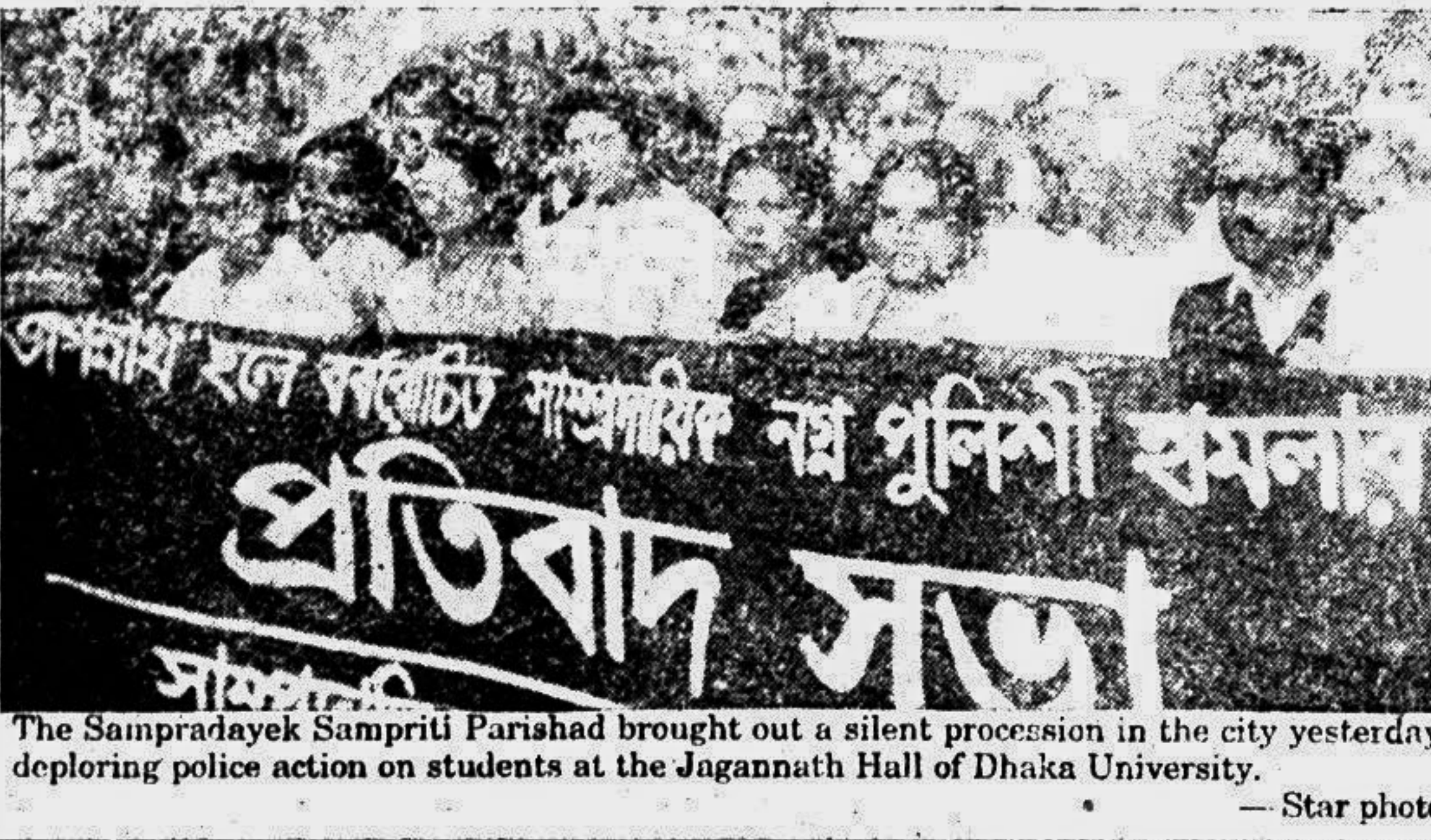
The Sampradaye Sampriti Parishad brought out a silent procession in the city yesterday deploring police action on students at the Jagannath Hall of Dhaka University.