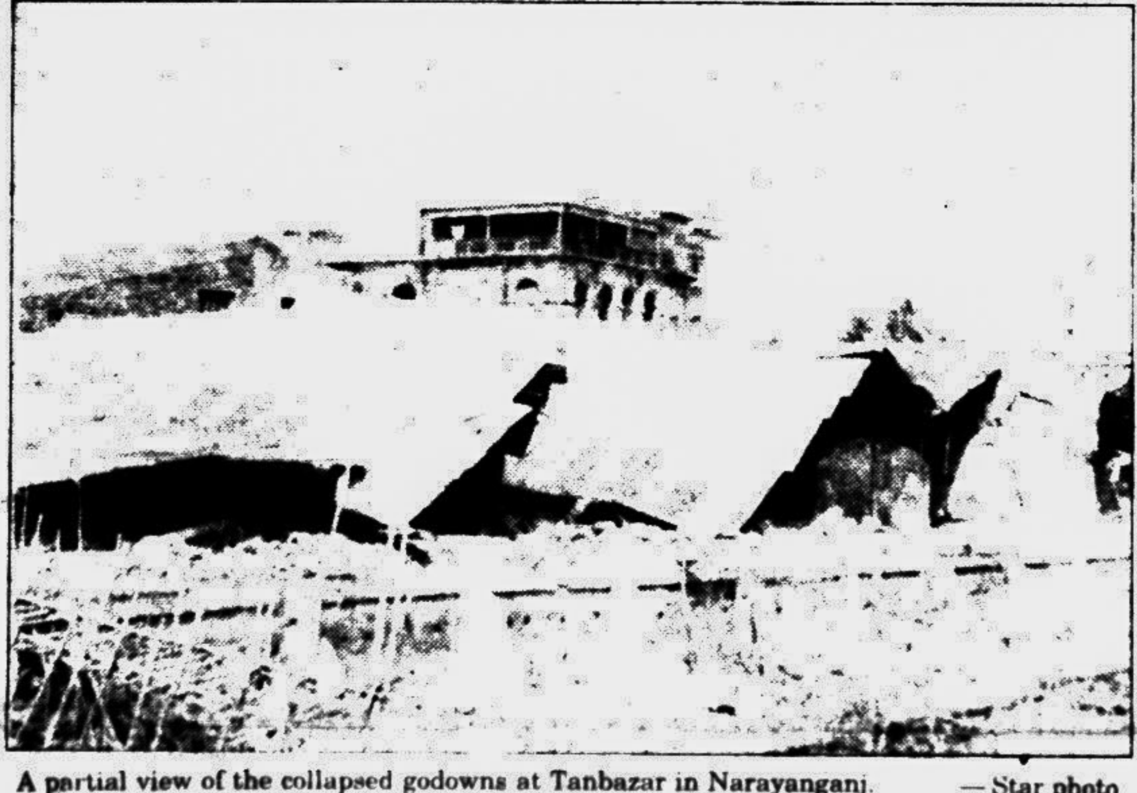
A partial view of the collapsed godowns at Tanbazar in Narayanganj.