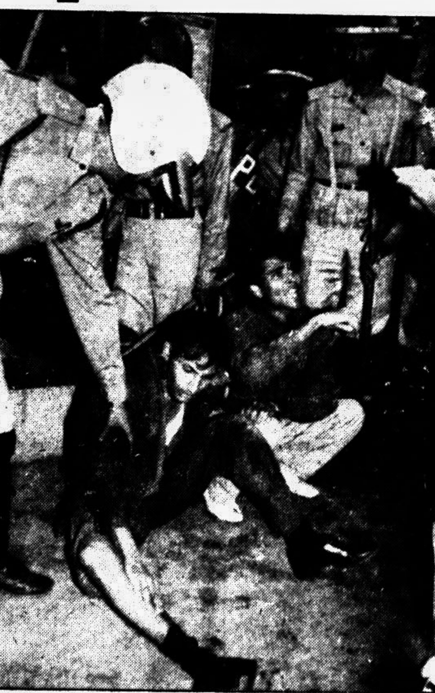
Two students were arrested from the TSC area yesterday.

At about 11-45 am, shots were fired in the TSC area. Police swung into action and used tear gas canisters and batons to disperse the mob. They also chased several processions, campus sources said.