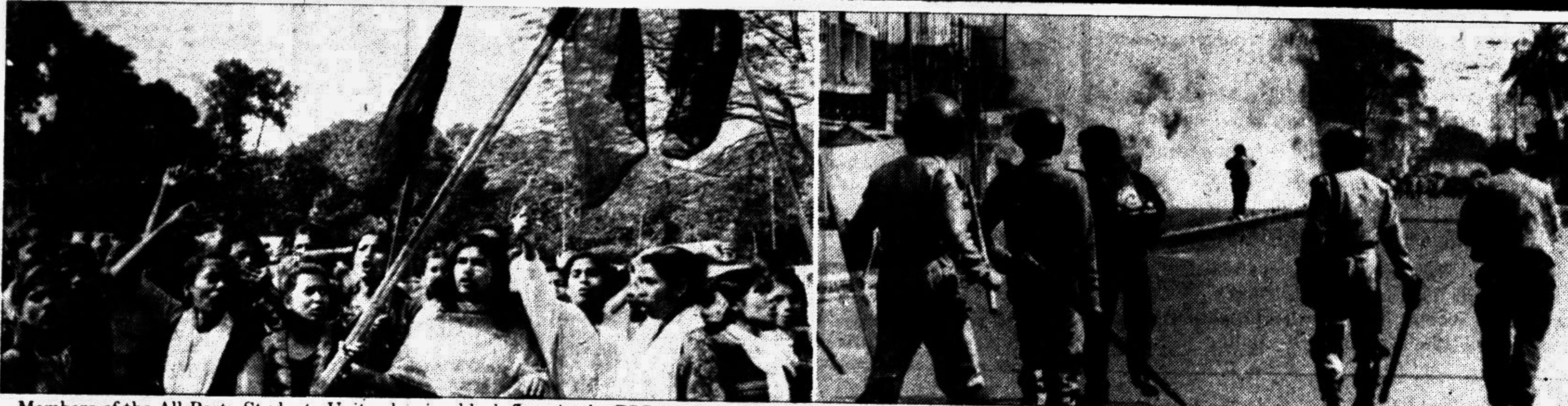
Members of the All Party Students Unity showing black flags in the TSC area of the Dhaka University when Prime Minister Begum Khaleda Zia came to the Bangla Academy to inaugurate Ekushey Book Fair yesterday (L) and clashes between police and BCL activists spread to the Topkhana Road from TSC area (R).