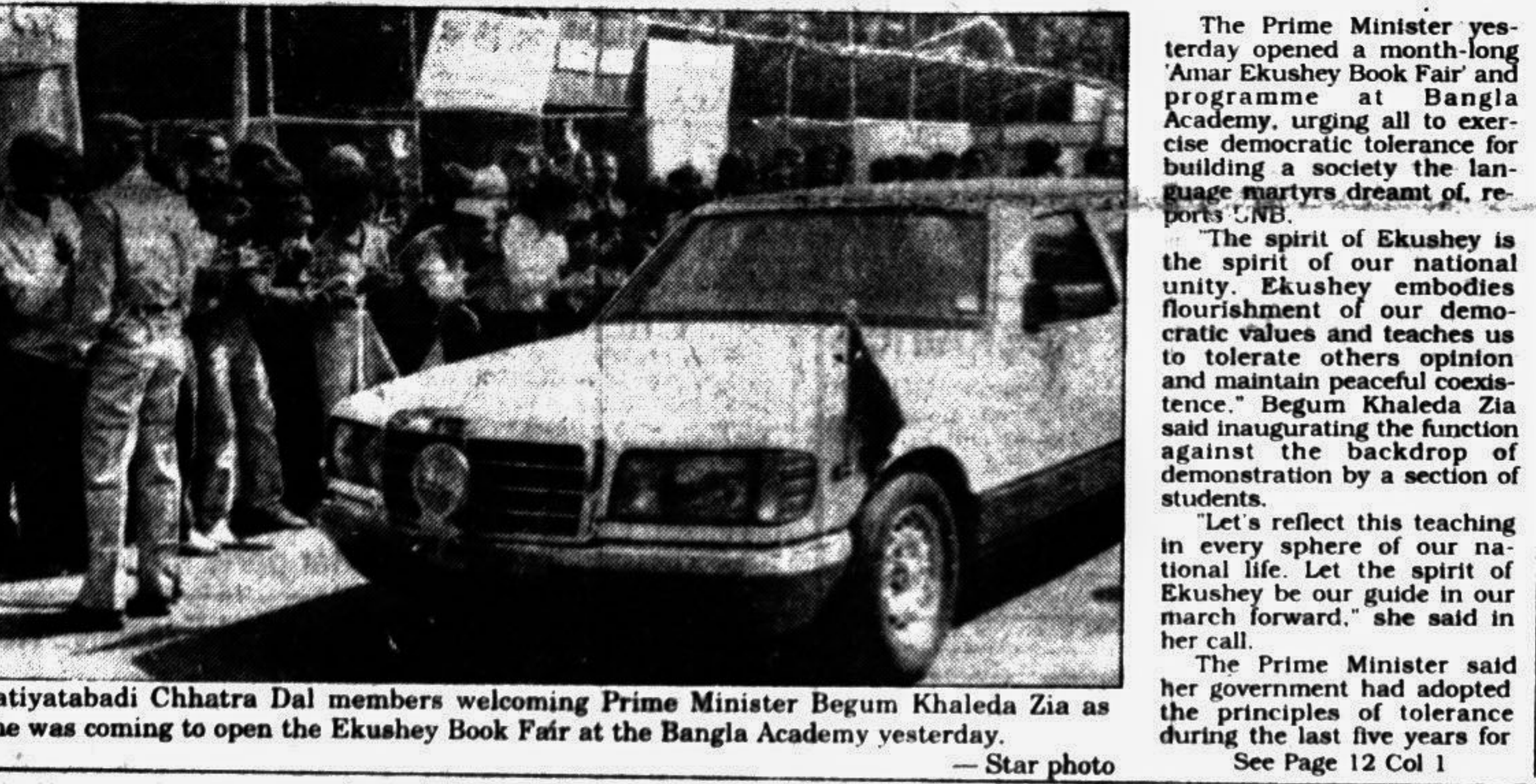
Jatiyabadi Chhatra Dal members welcoming Prime Minister Begum Khaleda Zia as she was coming to open the Ekushey Book Fair at the Bangla Academy yesterday.