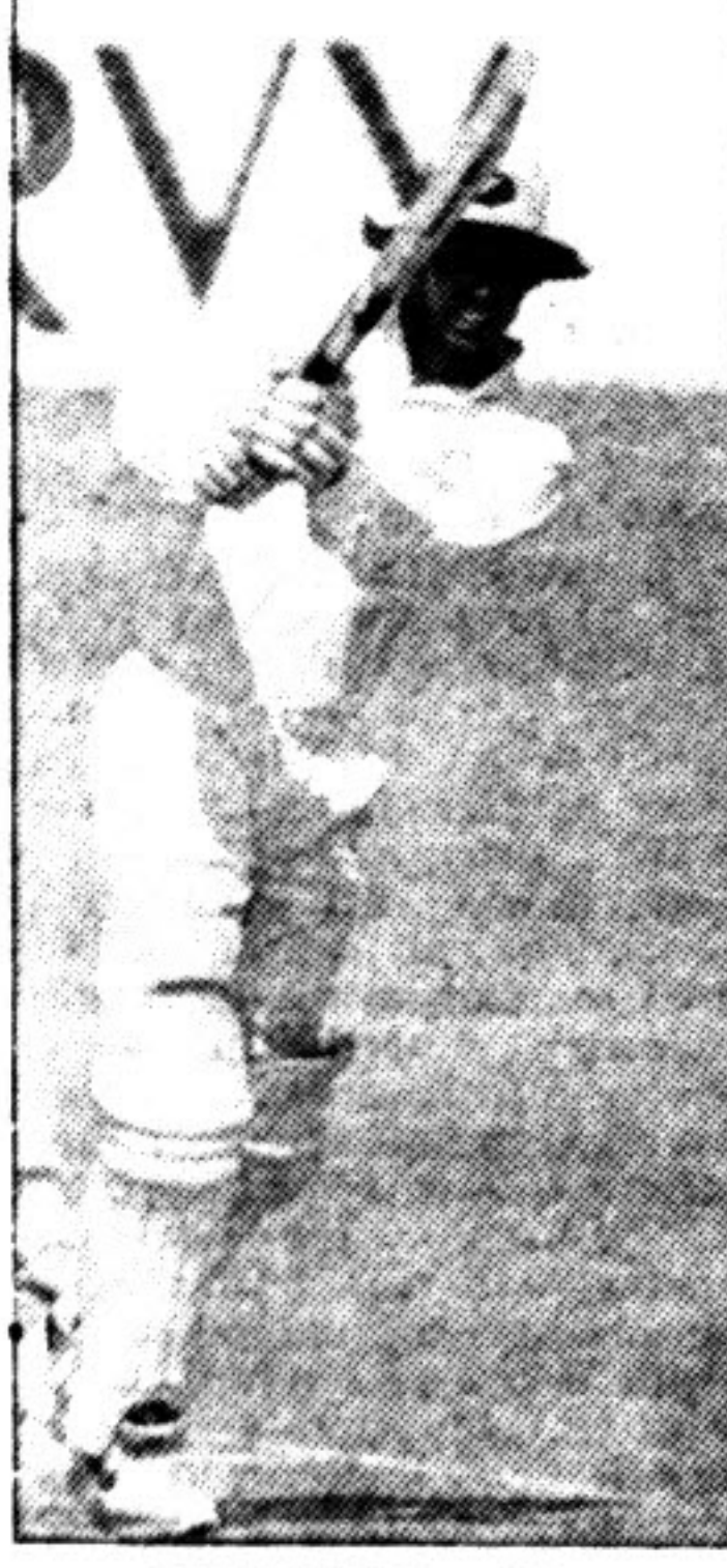
FLEMING ... 70

The last match in the series is in Napier on Saturday.