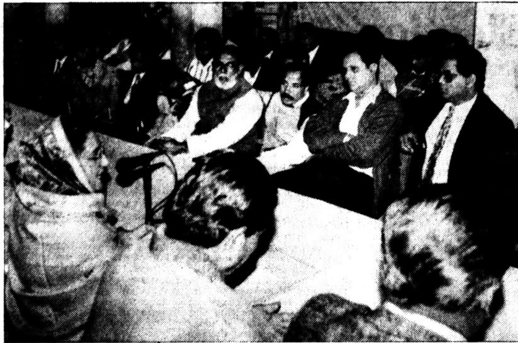
Awami League chief Sheikh Hasina exchanging views with journalists at the party's Bangabandhu Avenue office yesterday.

A condolence meeting under the auspices of the Chittagong Press Club and CUJ will be held at the press club here tomorrow.