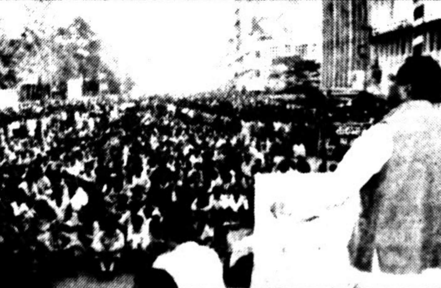
Jatiya Party leader Moudud Ahmed addressing a party rally in the city yesterday.