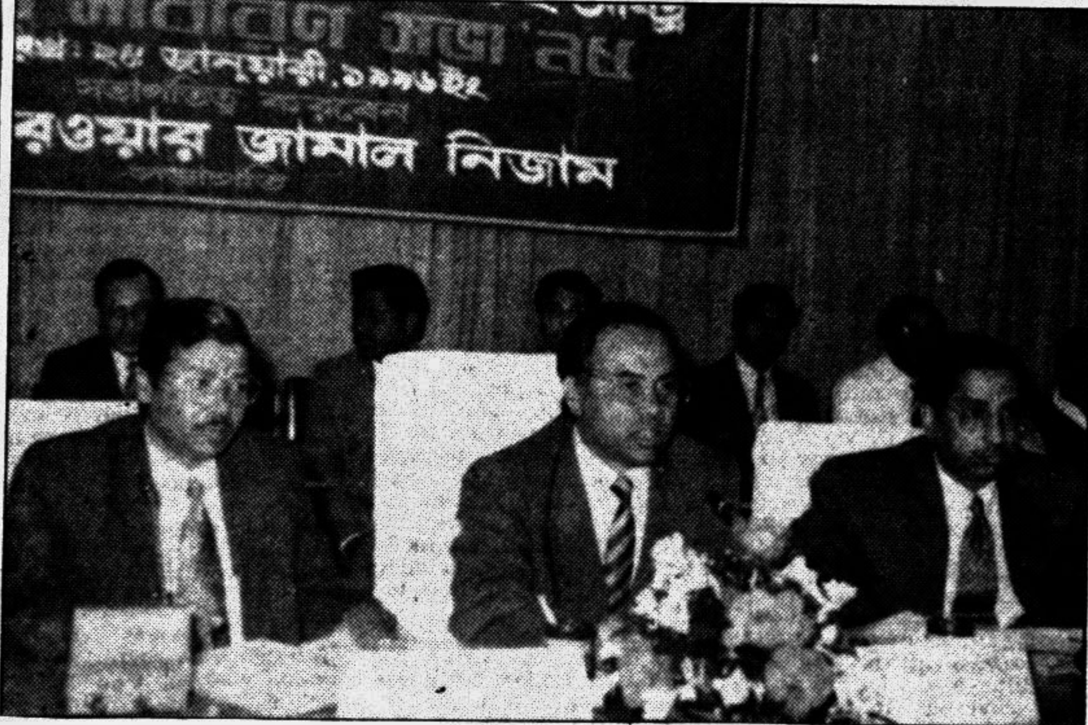
CHITTAGONG: President of Chittagong Chamber of Commerce and Industry (CCCI) seen addressing the annual general meeting held recently.

Over 90 per cent of the people of these areas are farmers fully dependent on agriculture and farm labourer. Their living standard was better ten years ago when there was a flood protection embankment along the eastern bank of river Katakhal via Badikhali, Nayabander, Sankerganj, Trimohini ghat up to Dewantola bridge. But the said embankment was completely washed away by the onrush of flood water in 1988 which could not be reconstructed as yet. As a result every year flood water engulfs the vast track of crop land of said unions and continued its devastation due to absence of an embankment in eastern bank of river Katakhal.