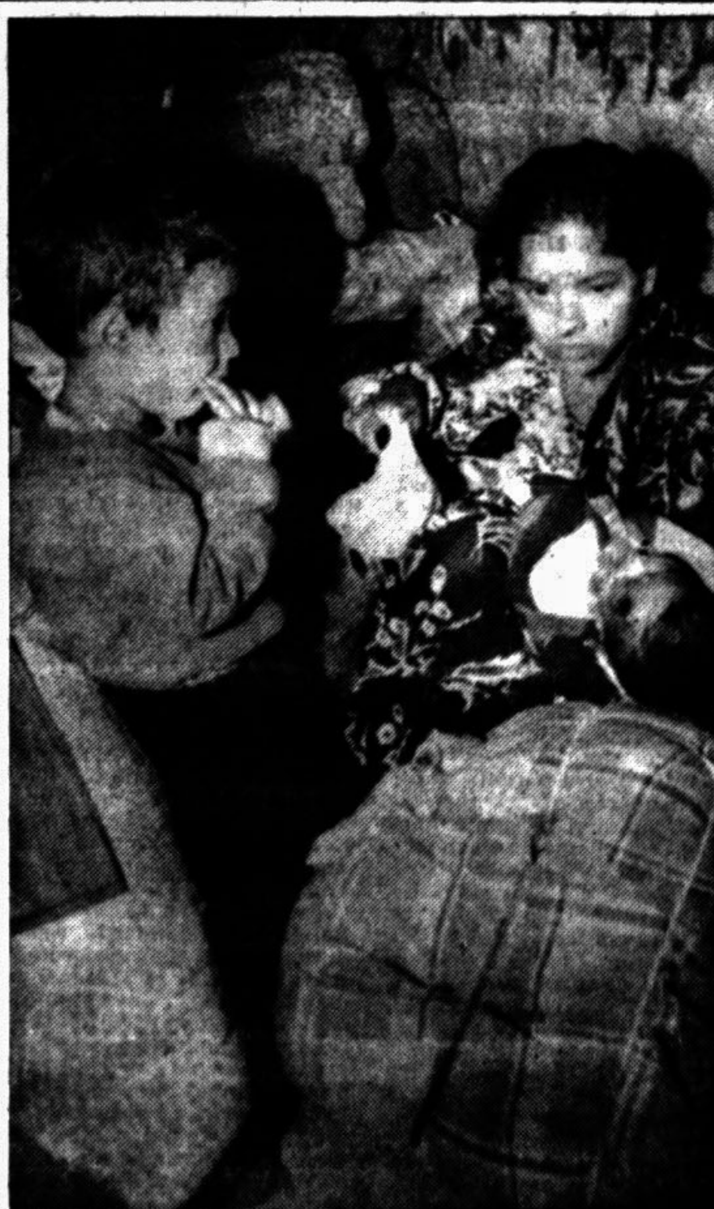
Stranded passengers at Sadarghat launch terminal during yesterday's hartal.