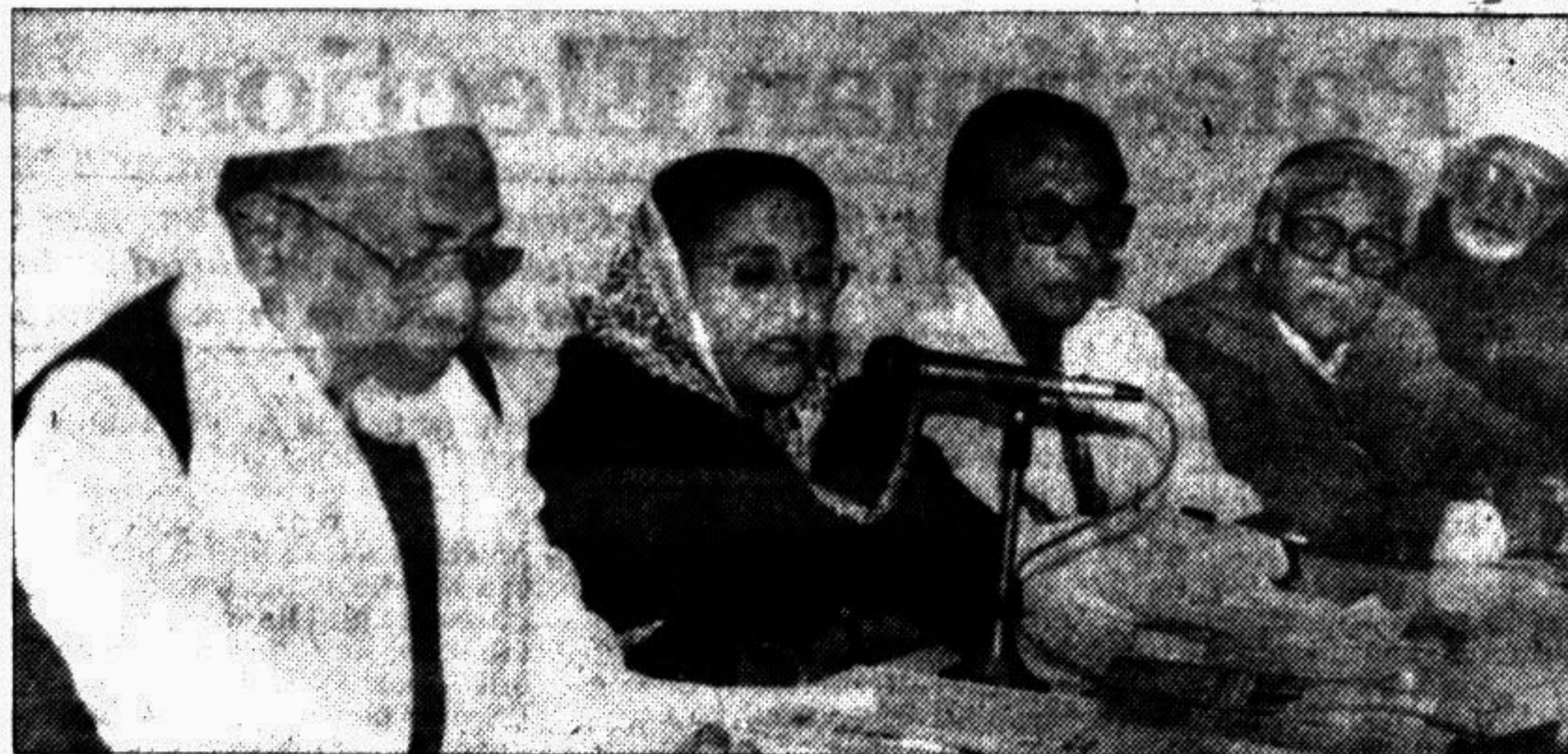
Awami League chief Sheikh Hasina speaking at a meeting with teachers at the party's central office yesterday.