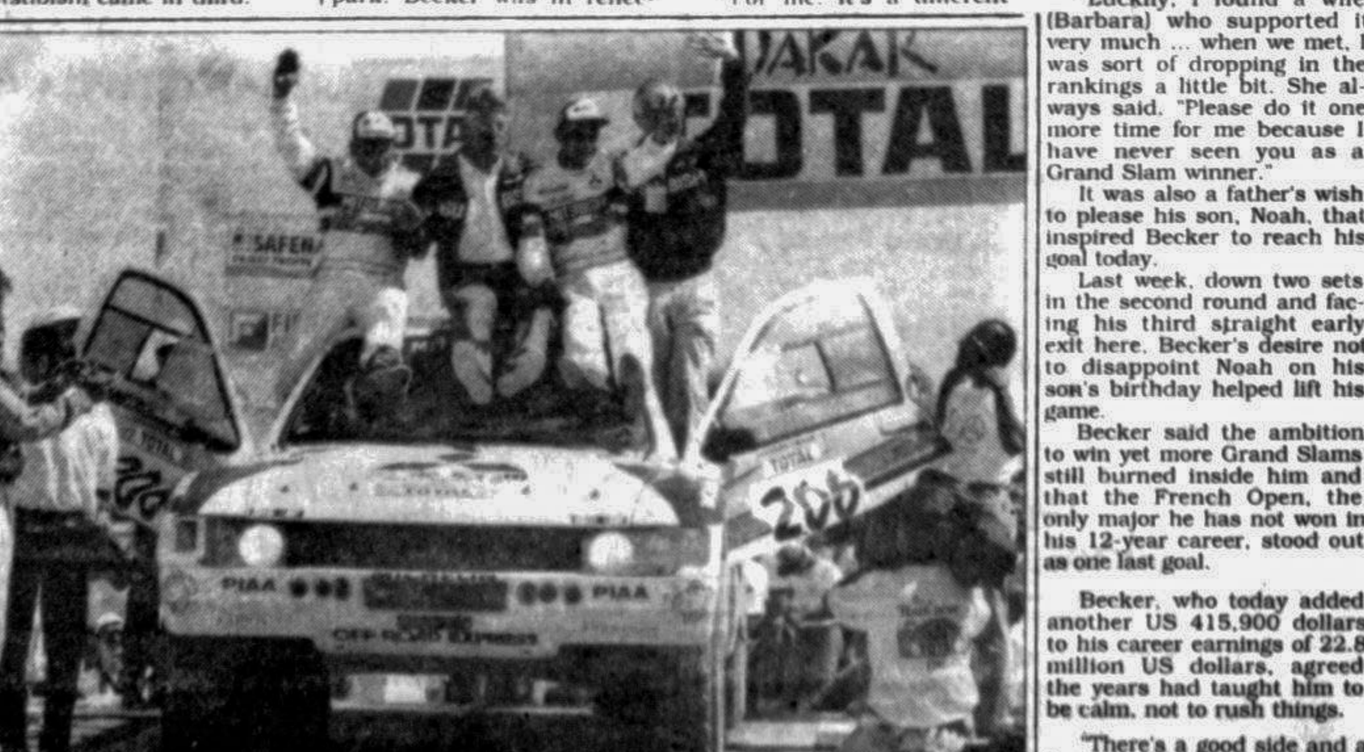
The victorious Mitsubishi team celebrate aboard at Pajero T3.