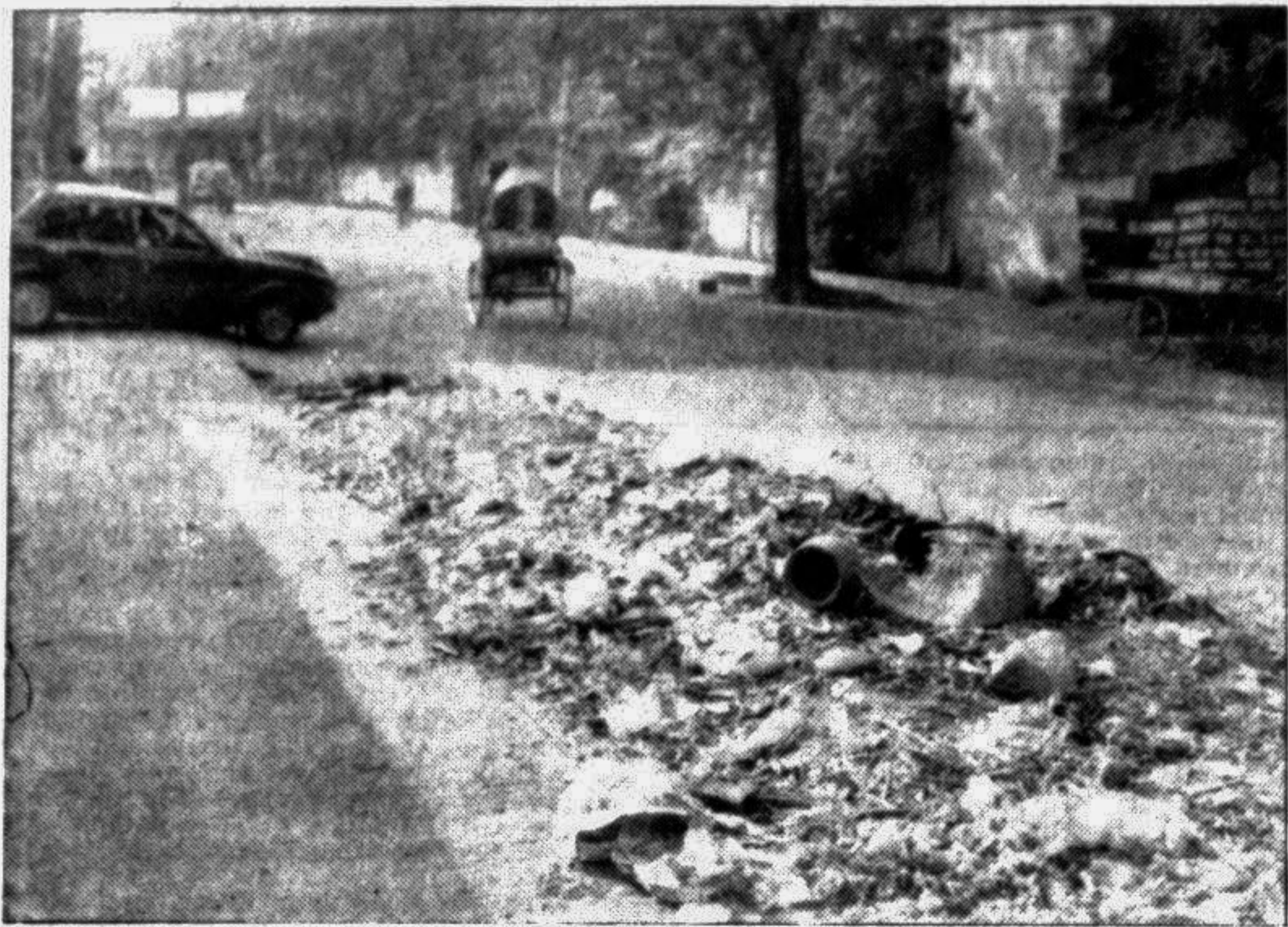
TURNING A BLIND EYE: This heap of garbage at the entrance of Dhanmondi Road No 3 remains unattended to for days.