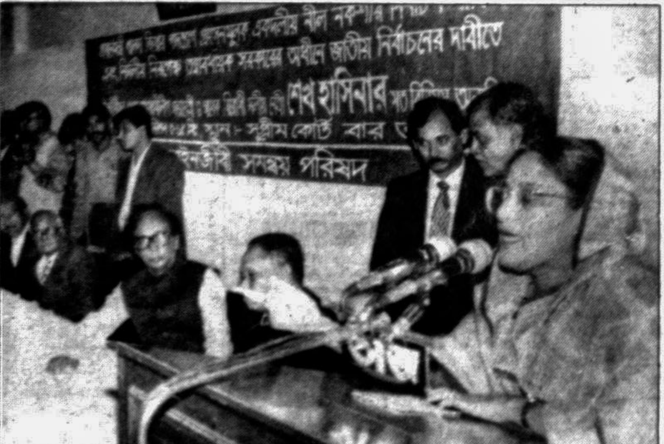
Awami League President Sheikh Hasina addressing members of the Lawyers' Samannaya Parishad at the Supreme Court Bar Auditorium yesterday.

the ongoing movement on caretaker government issue "unique" in democratic history. In a resolution, adopted earlier, the Anjibi Samannaya Parishad expressed solidarity with the Opposition a current movement and called upon the people to resist the "farical" election. The one party farical election would further deepen the present political crisis. The government which will be formed through the present electoral process will not get legitimacy and will have no moral right to rule the country," resolved the umbrella body of country's legal professionals. The parishad urged all officials and employees of the Republic engaged in the electoral process to reject, what it called, a mock vote. It also urged police, BDR and army not to cooperate with the government in implementing its "blueprint" to