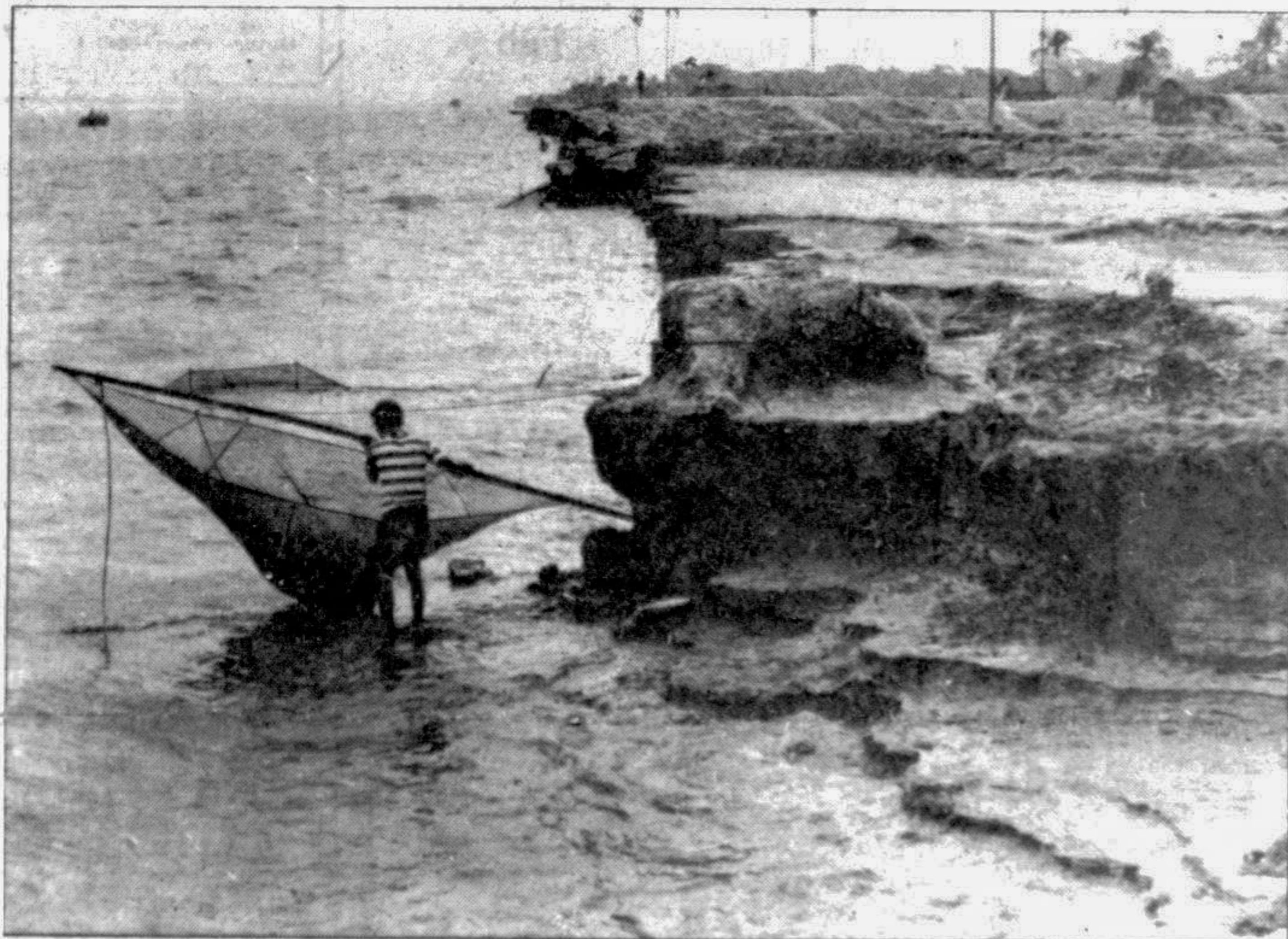
Vast areas in Hatiya being devoured by the mighty Meghna.

An expert committee has recommended restructuring of the country's outmoded administrative set-up, abolishing certain ministries, reports UNB. The Administrative Reorganising Committee is also learnt to have suggested amalgamation of some divisions and creation of new offices suiting the present socio-economic condition of the country. There are now 274 government organisations, including ministries, divisions, directorates and departments — many of which were modelled on the prevailing conditions in British period. Set up in August 1993, the committee has so far submitted reports to the authorities concerned after examining 180 of the government.