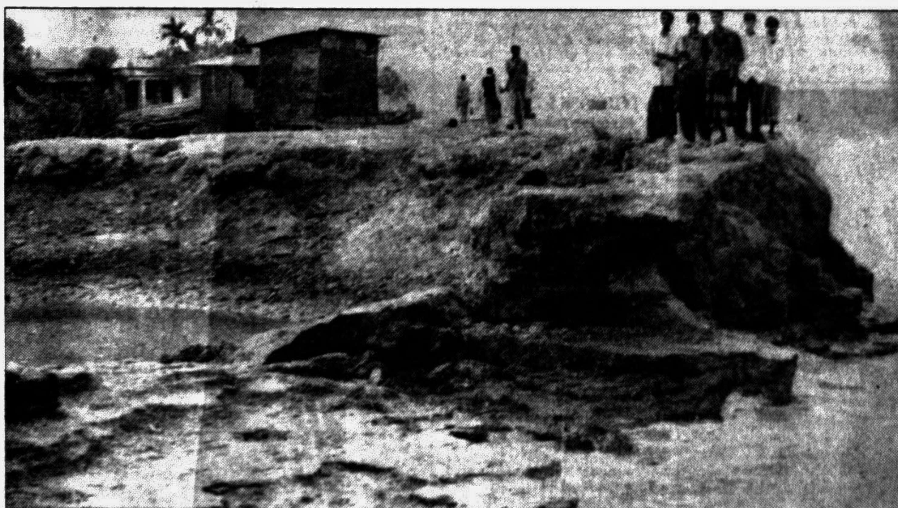
Huge areas of land on the southern part of the island have been eroded. An embankment could stop erosion and save property.