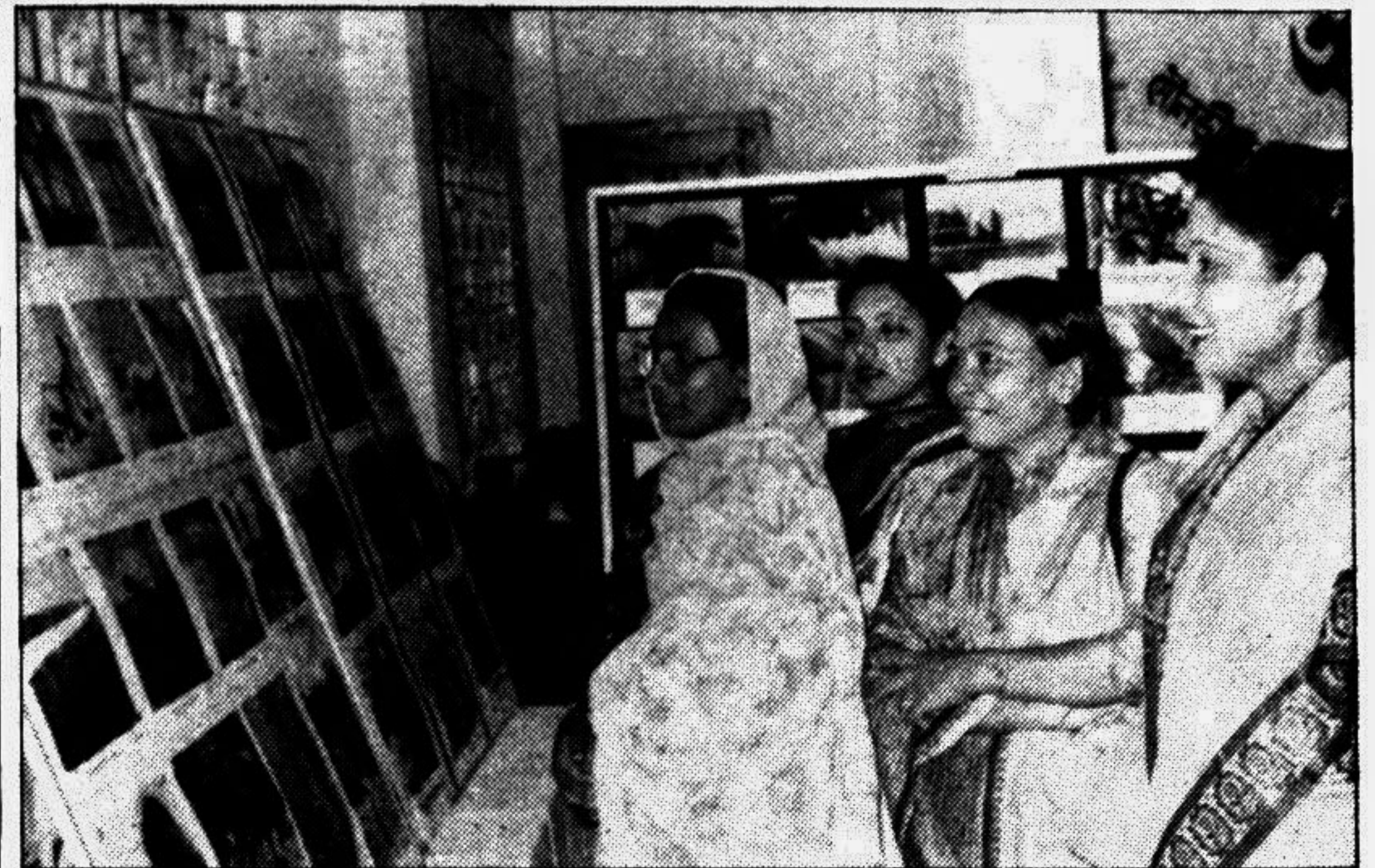
Visitors at a photo exhibition show in Moulvibazar town. More than 500 photos, both, colour and black & white photos were on display.

When contacted, students appealed saying, "We earnestly request our teachers and all others not to do anything that can hamper our academic career."