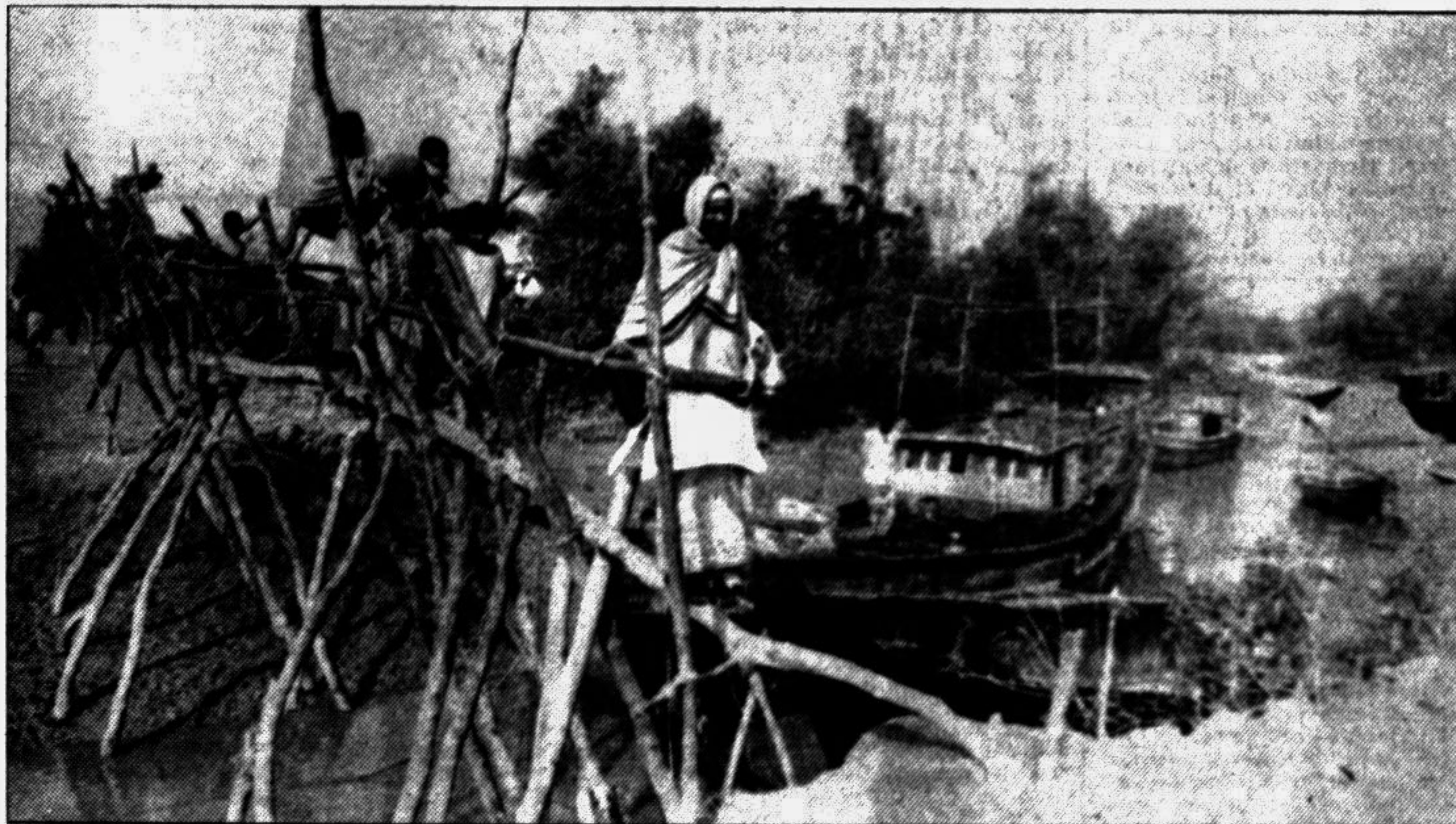
Locals cross this canal using the shako. There is virtually no sign of development in the island. Many such shakos have been built by local people but the Local Government takes no interest for the service of the inhabitants of the island.