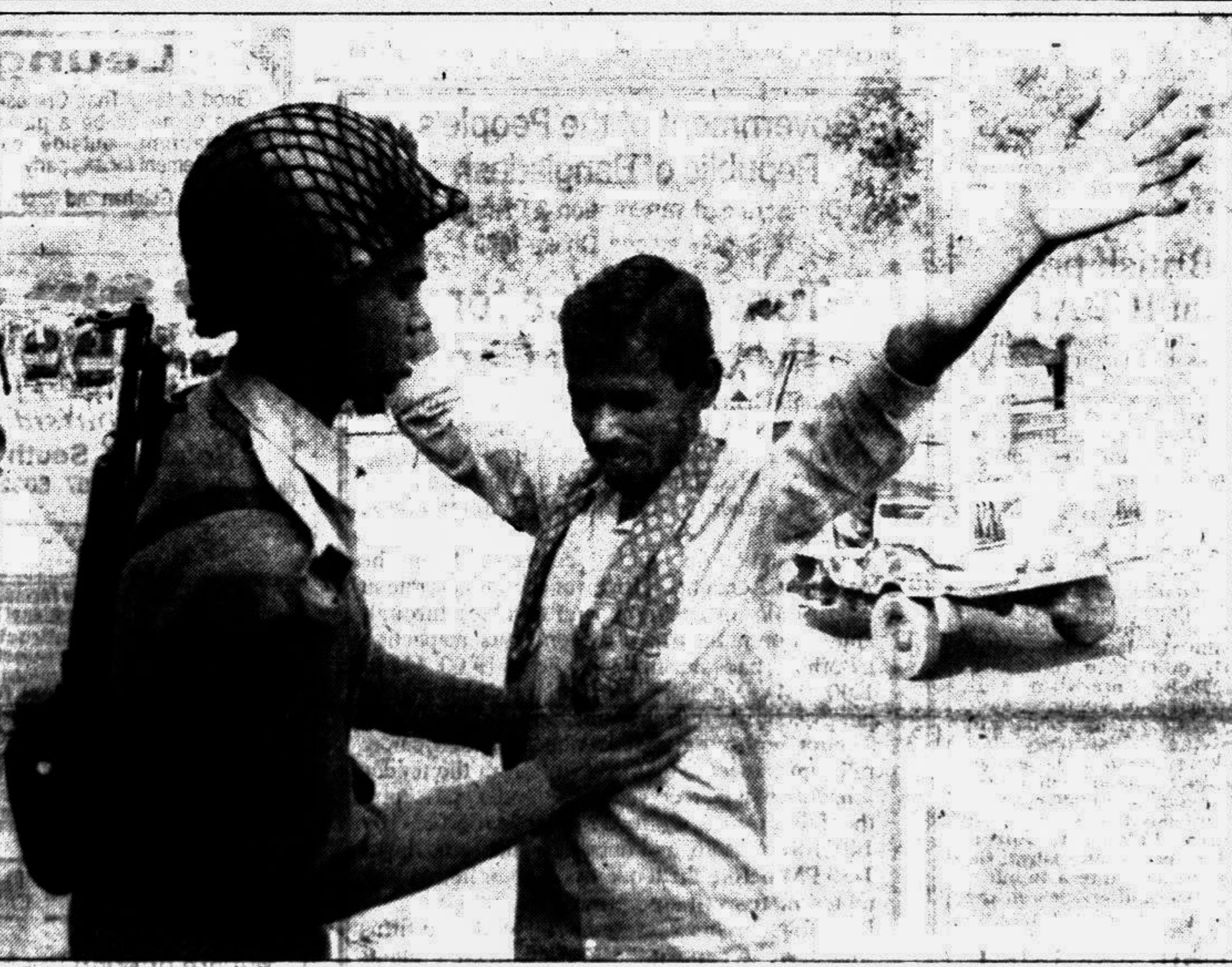
BDR checking autorickshaw drivers and passengers yesterday as part of its anti-hacking drive in the city.