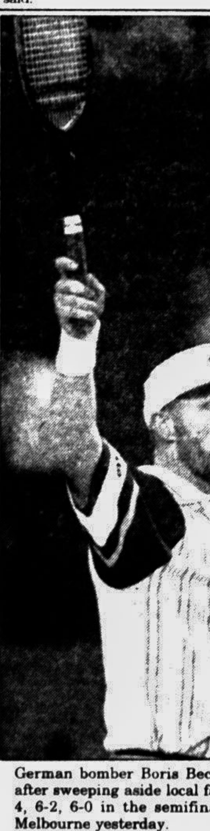
German bomber Boris Becker acknowledges the fans after sweeping aside local favourite Mark Woodforde 6-4, 6-2, 6-0 in the semifinals of the Aussie Open in Melbourne yesterday.