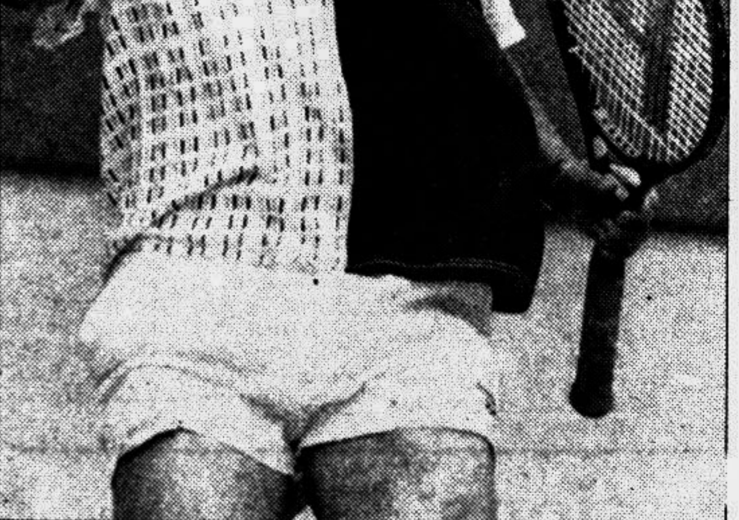
The gritty American Michael Chang shows little emotion after spoiling compatriot Andre Agassi's dream of consecutive Aussie Open crowns in Melbourne yesterday. Chang outclassed a stunned Agassi in the semifinal 6-1, 6-4, 7-6 (7/1).