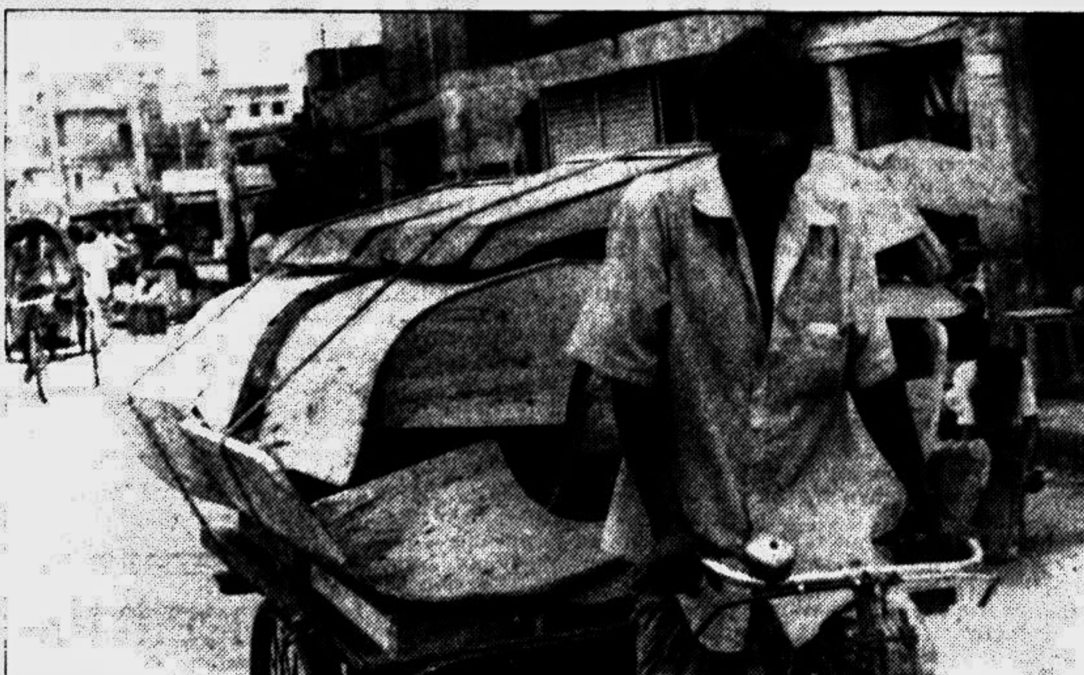
ADDING TO TRAFFIC PROBLEM: This man is transporting parts of rickshaws. With the city's traffic system becoming chaotic with the ever-increasing number of these three-wheelers, the rickshaw manufacturing trade is booming.